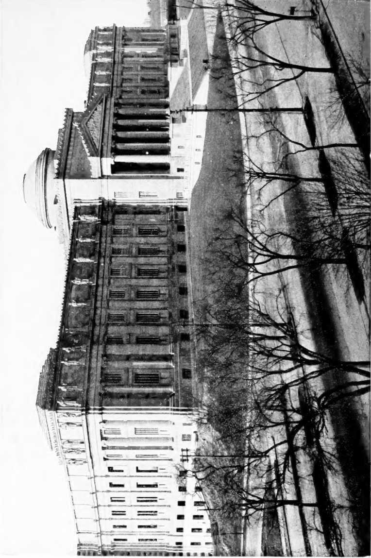
CENTRAL MUSEUM OF THE BROOKLYN INSTITUTE OF ARTS AND SCIENCES