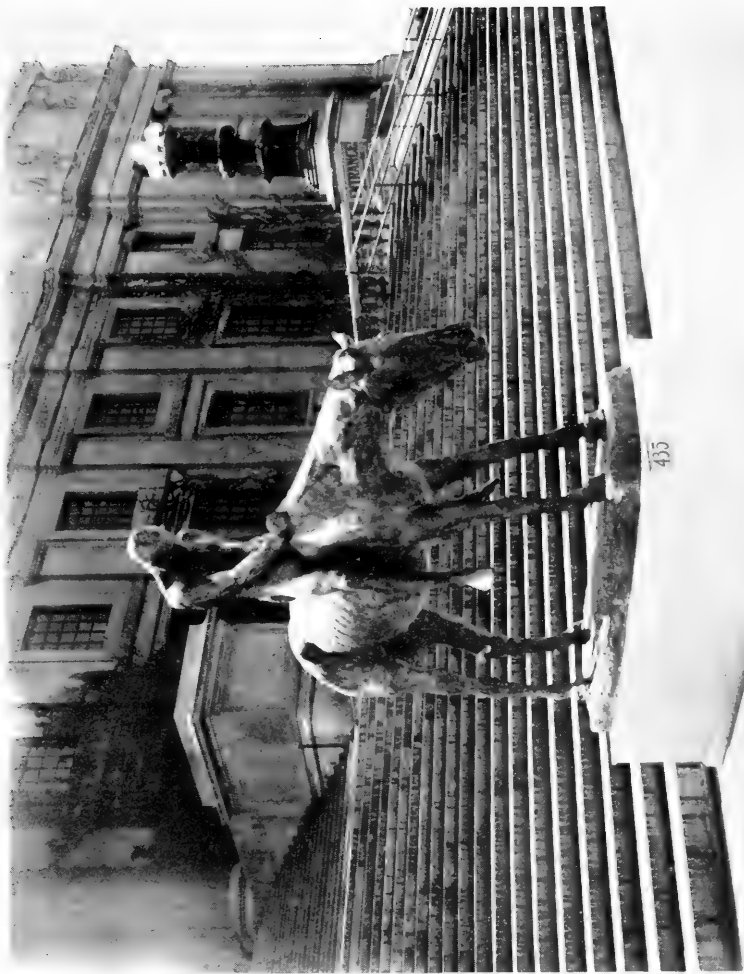
"THE DYING INDIAN"