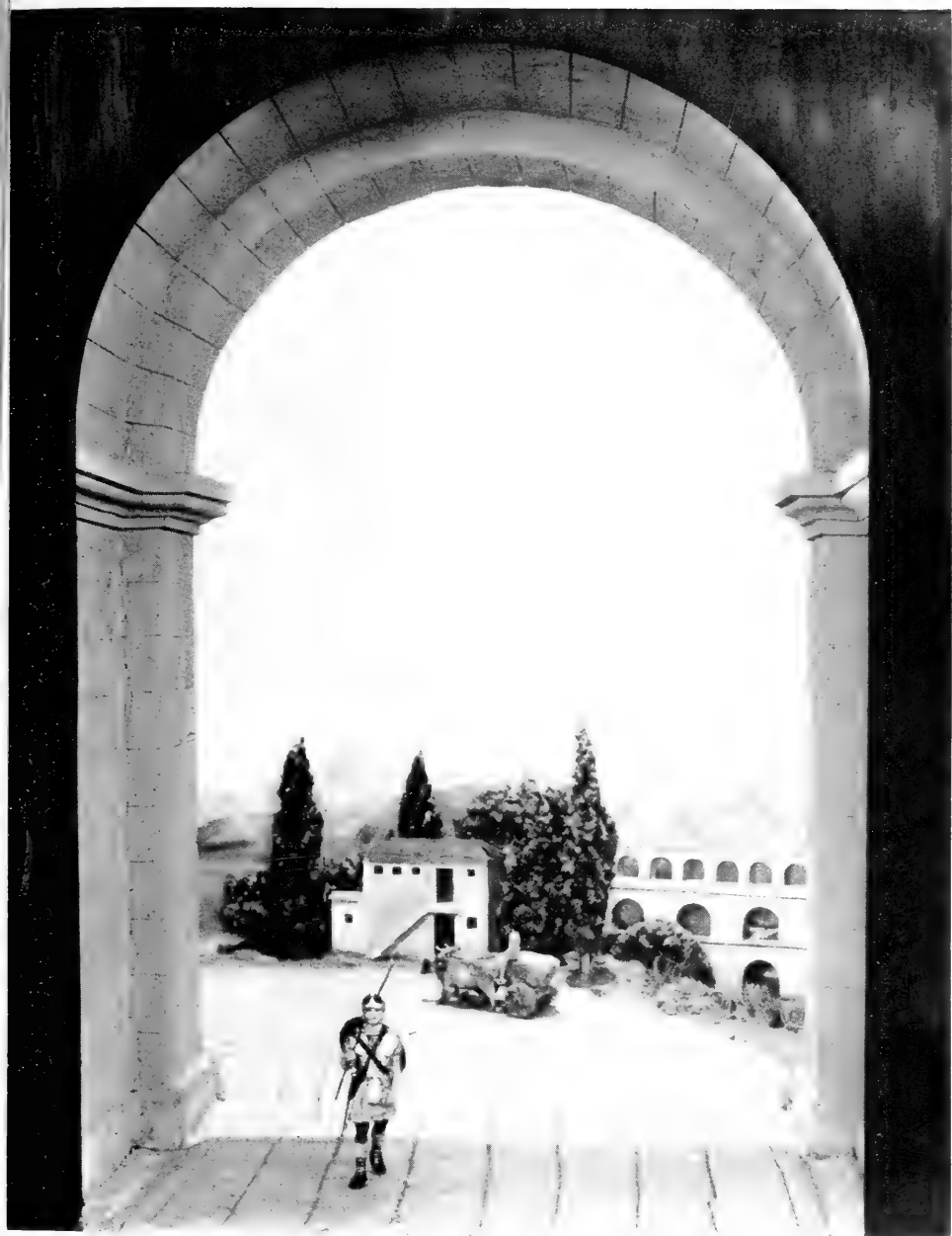
A ROMAN ROAD