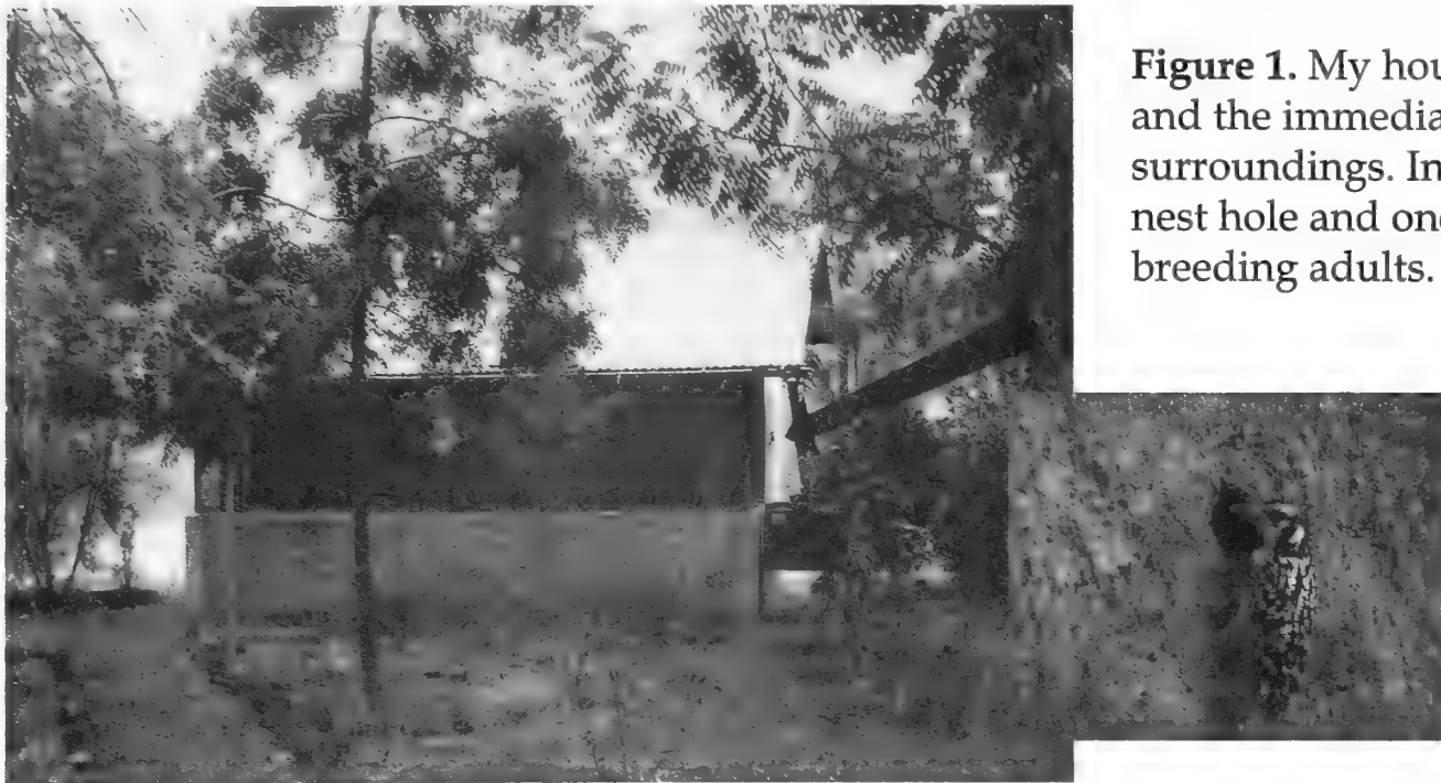
Figure 1. My house and the immediate surroundings. Inset: the nest hole and one of the breeding adults.