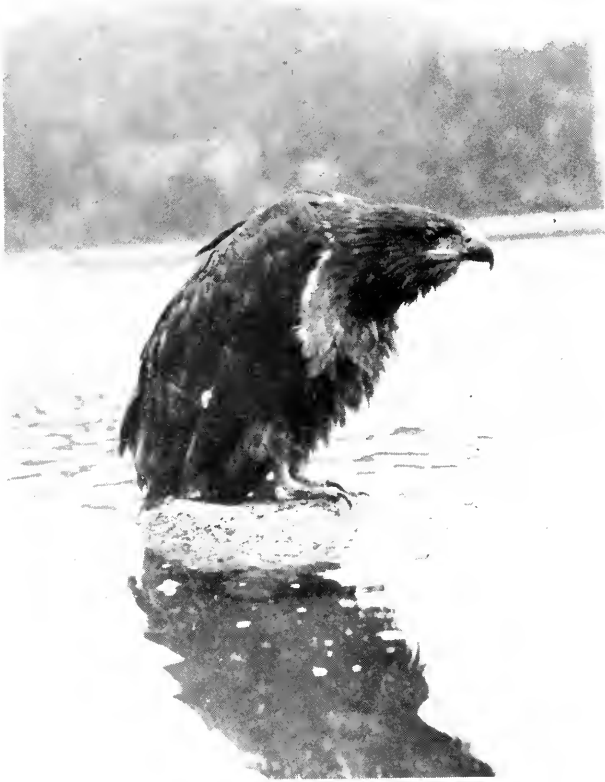
Young Bald-headed Eagle at "The Bowl," on Newport Mountain