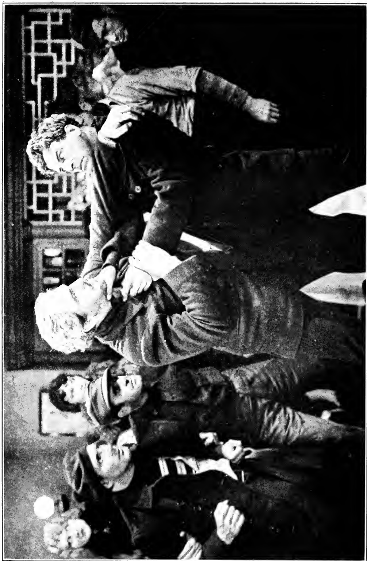
A Fox Movietone Production.

"ONE OF US WILL BE CARRIED OUT . . . AND IT WON'T BE ME!"