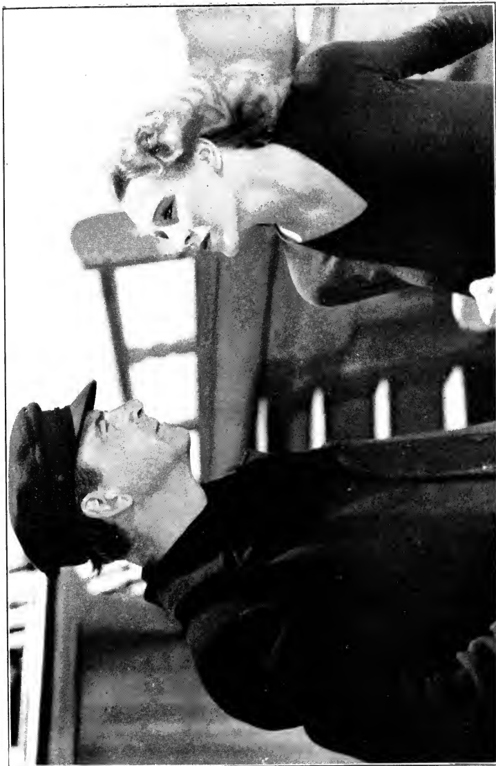
A Fox Movietone Production.

"I'M MASTER OF THIS SHIP." . . . "YES, AND I'M MISTRESS OF MY OWN SOUL."