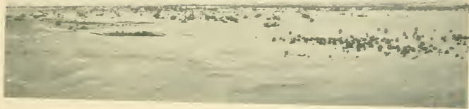
KUFARA WADI, FROM TAJ