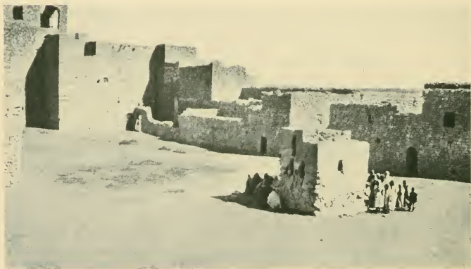
WELL IN ZAWIA AT JAGHABUB