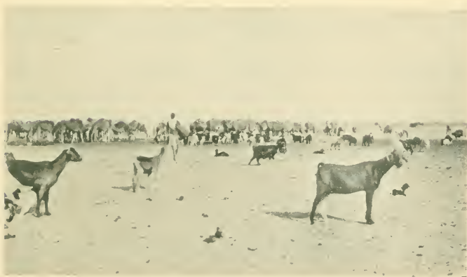
FLOCKS WATERING AT BIR RASSAM