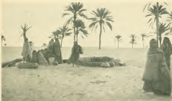
DESERT WELL AT JALO