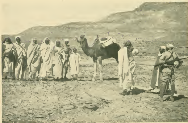
THE FIRST MEETING BETWEEN THE FAQRUN FAMILY AND OUR PARTY AT BUSEIMA