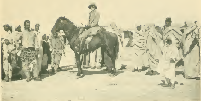
THE AUTHOR AT JEDABIA