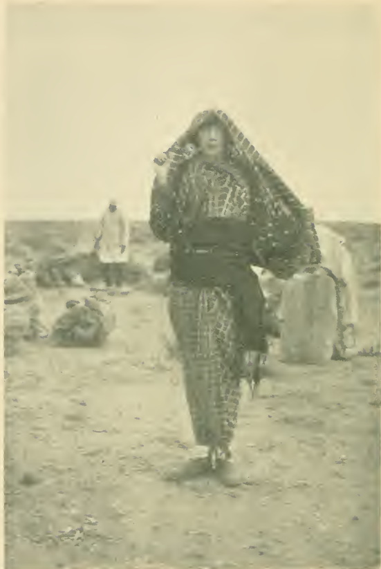
THE AUTHOR IN BEDUIN DRESS