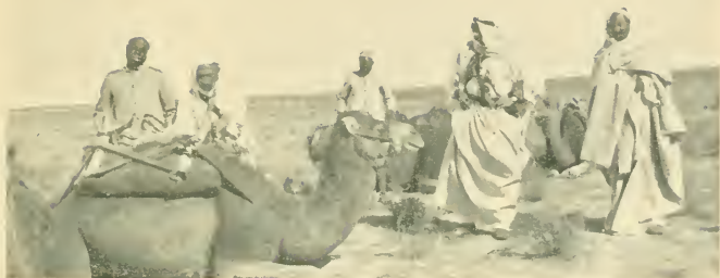
UNLOADING ON THE SECOND DAY FROM JEDABIA