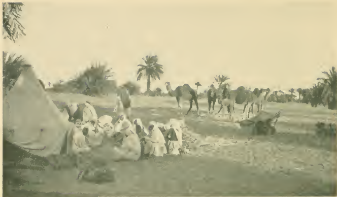
OUR CAMP AT AWARDEL.