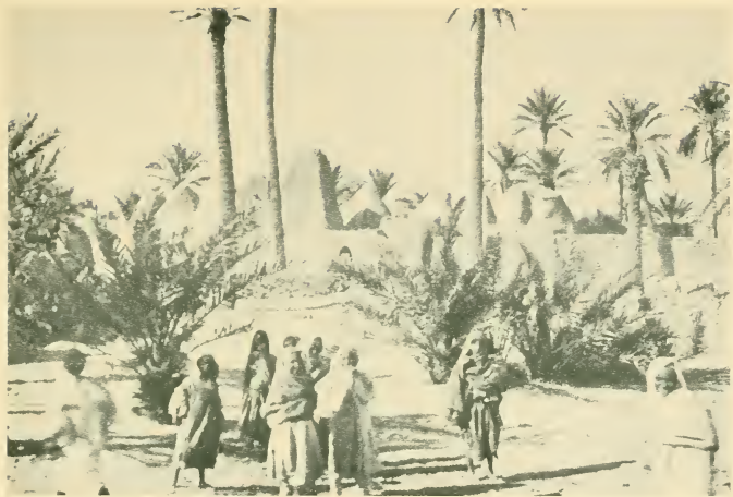
THE MOSQUE AT AUJELA, WHERE IS BURIED THE CLERK OF THE PROPHET MOHAMMED