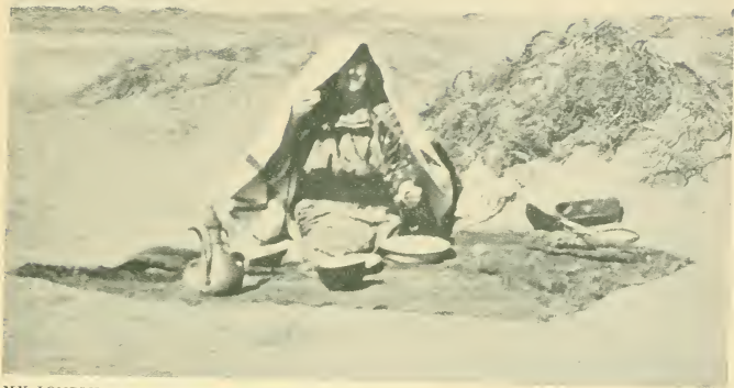
MY LONELY PICNIC IN KUFARA WADI