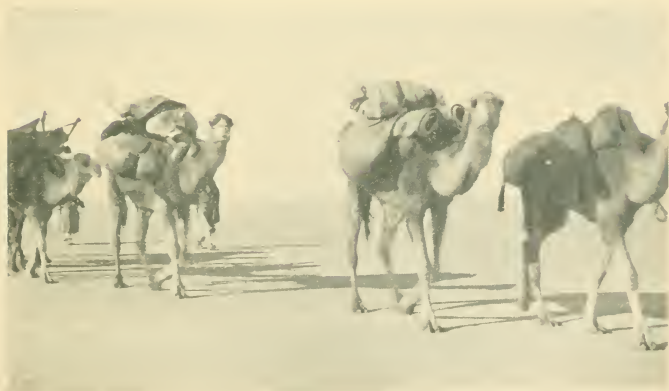
THE AUTHOR ASLEEP ON A CAMEL