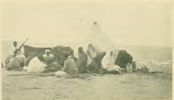
OUR CAMP AT BUTTAFAL