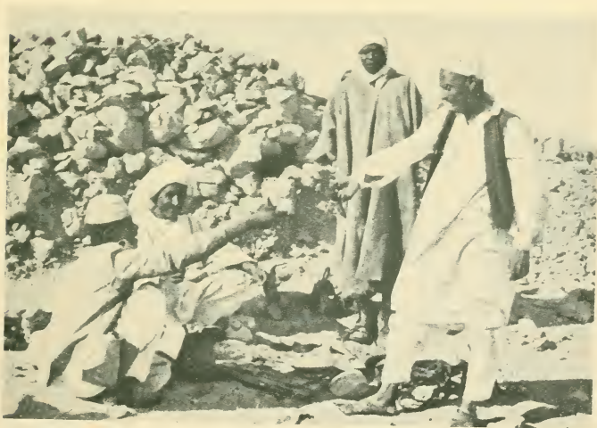
A GLASS OF MINT TEA ON THE WAY TO SIWA