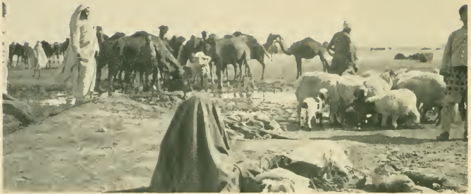
WELL AT JEDABIA