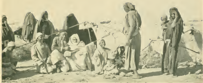
NOMAD TENTS NEAR JEDABIA