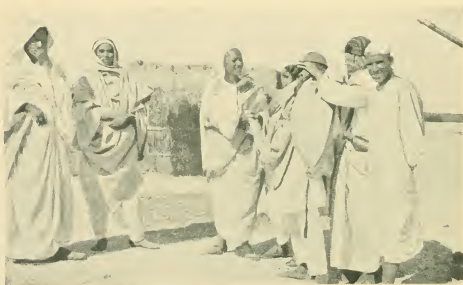
AT BUSEIMA: TEACHING THE FAQRUN FAMILY TO USE FIELD GLASSES