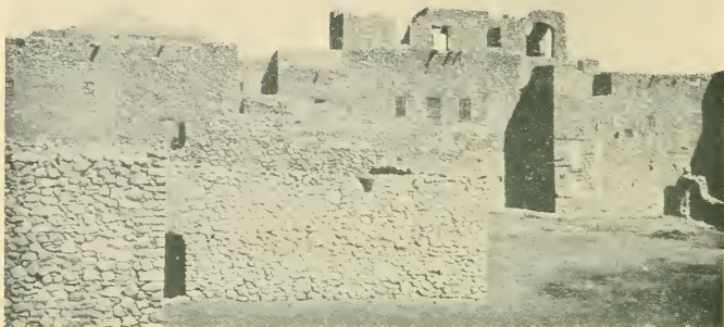
SIDI IDRIS'S HOUSE AT JAGHABUB