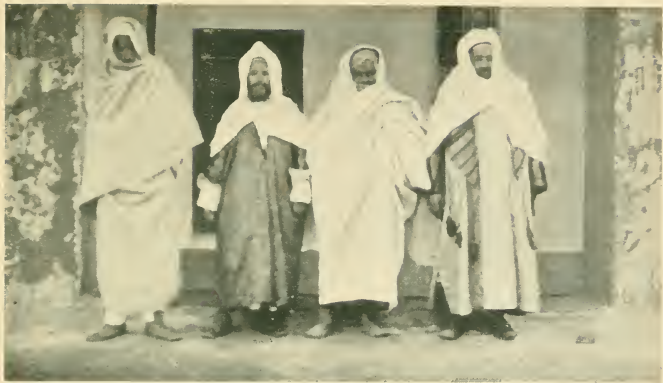
THE FOUR EKHWAN WHO RECEIVED US AT TAJ