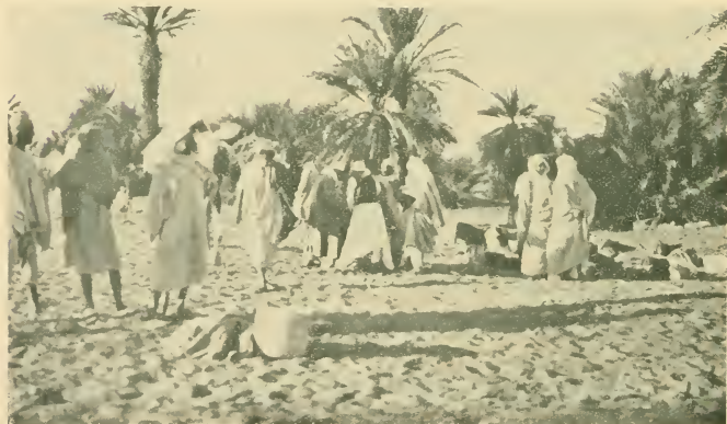
LOADING AT AWARDEL.