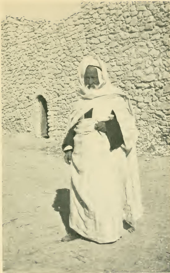
OUR HOST AT JAGHABUB