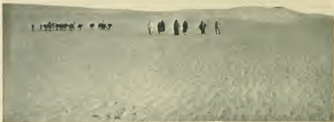
CARAVAN IN DUNE COUNTRY NEAR BUSEIMA