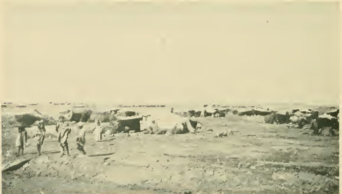
NOMAD ENCAMPMENTS ROUND JEDABIA