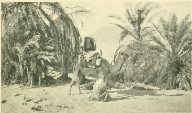
THE AUTHOR ON A CAMEL AT BUSEIMA