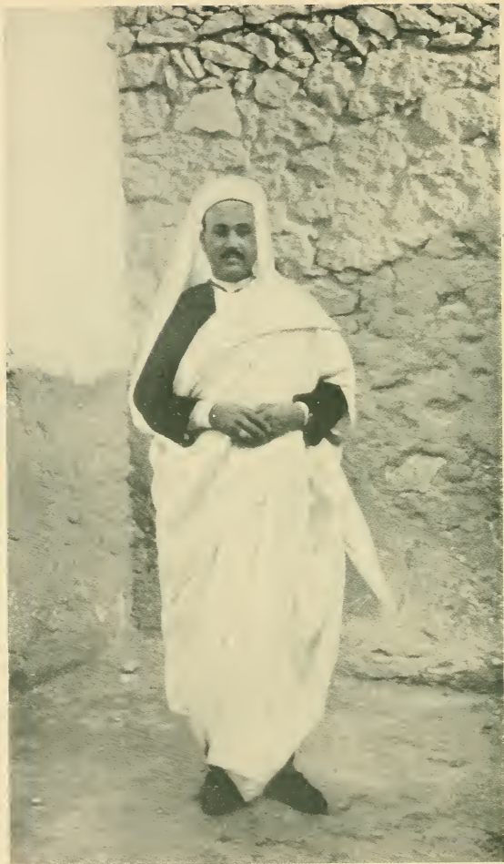
SAYED RIDA ES SENUSSI