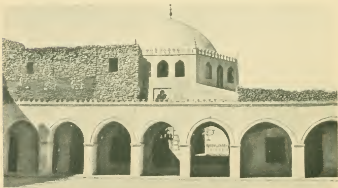
MOSQUE AND QU'ERA OF SIDI LEN ALI AT JAGHABUB