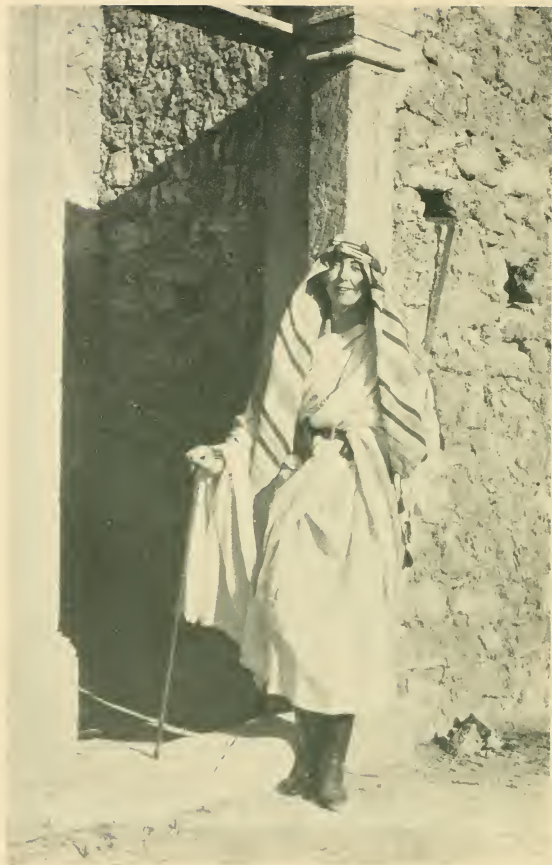
THE AUTHOR AS A BEDUIN SHEIK