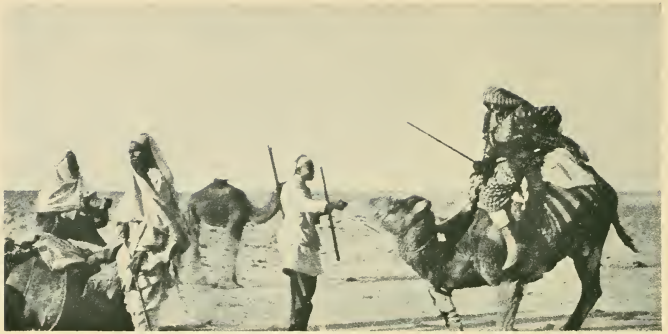
BARRAKING: A TOO SUDDEN DESCENT