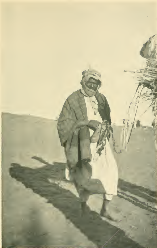
A TEBU AT AWARDEL IN KUFARA