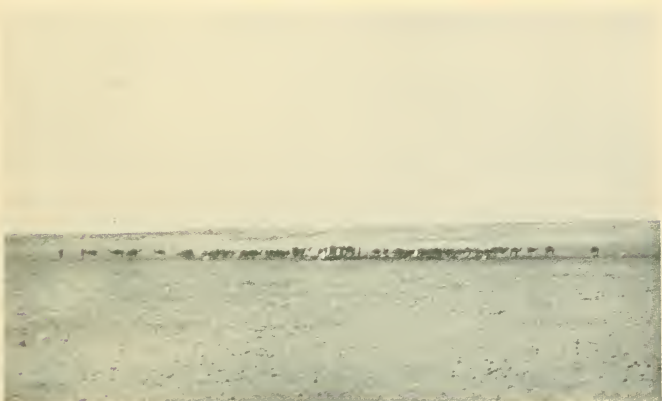
WADI FARIG; CAMELS AT THE WELL