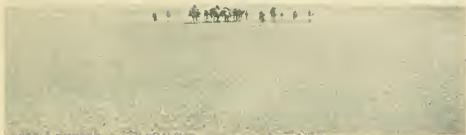
CARAVAN ON THE MARCH BETWEEN BUTTAFAL AND TAISERBO