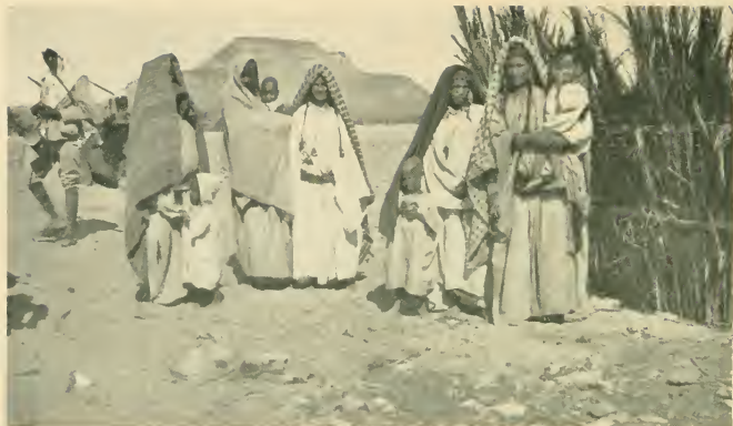
ZOUIA WOMEN AT BUSEIMA