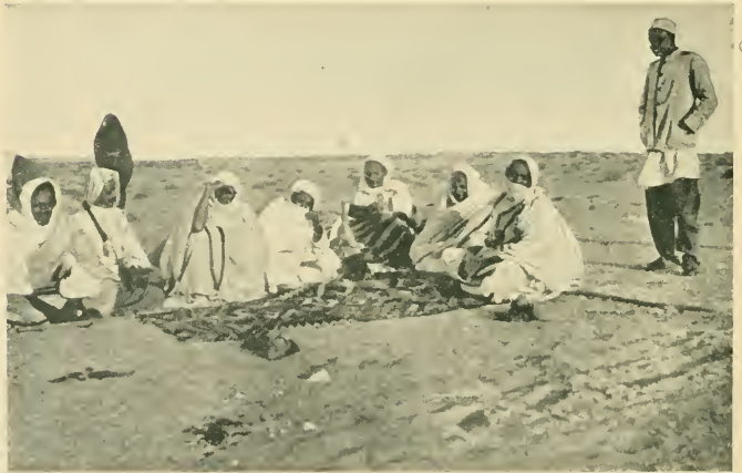
A LUNCH IN KUFARA VALLEY