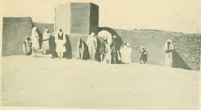
ZAWIA TOWER AT TAJ