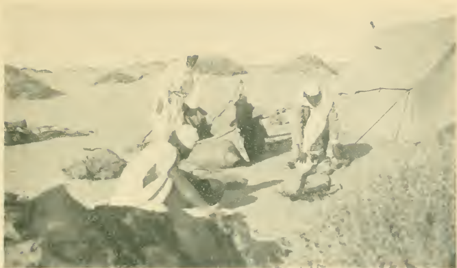
CAMP AT MEHEMSA: YU'SUF, MOHAMMED AND AMAR