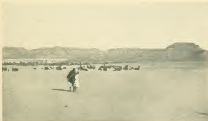
THE MOUNTAINS OF BUSEIMA