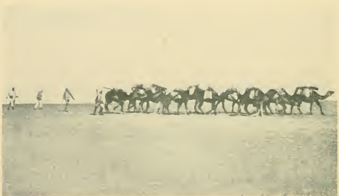
OUR CARAVAN APPROACHING AUJELA