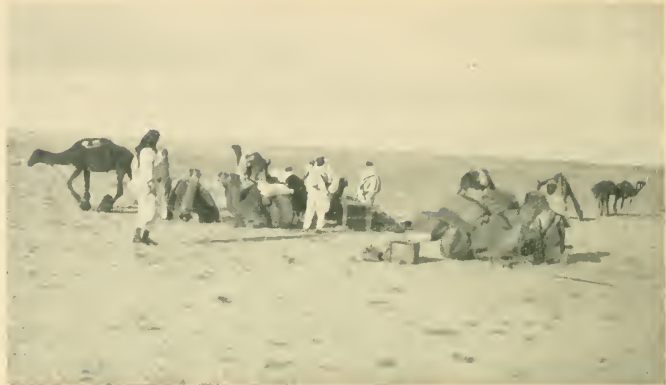
A HALT FOR THE NIGHT