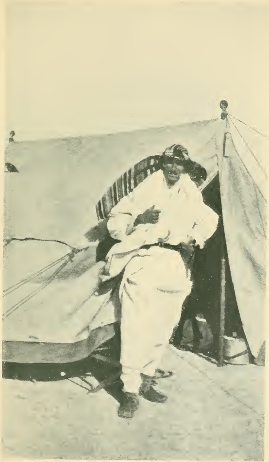
AHMED MOHAMMED BEY HASSANEIN. MY FELLOW EXPLORER