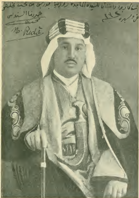
SAYED RIDA ES SENUSSI