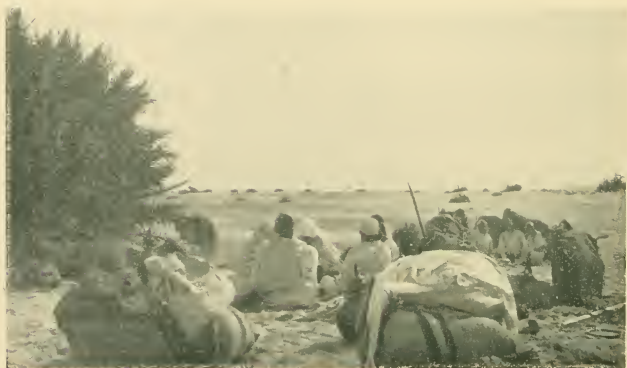
CAMP OF MOJABRA MERCHANTS AT BIR RASSAM