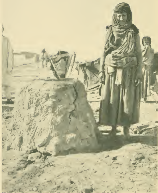
BEDUIN WOMAN AT JEDABIA