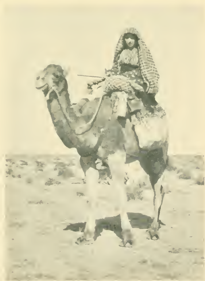
THE AUTHOR ON CAMEL-BACK