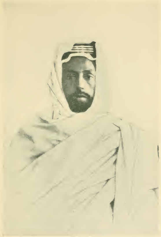
THE EMIR IDRIS ES SENUSSI