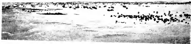
KUTARA WADI, FROM TAJI