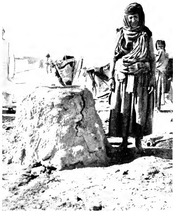
BEDUIN WOMAN AT JEDABIA