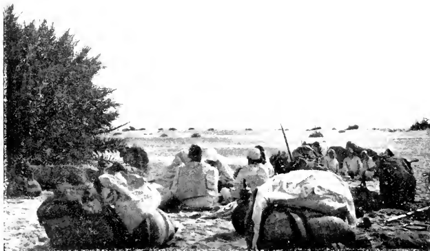
CAMP OF MOJABRA MERCHANTS AT BIR RASSAM