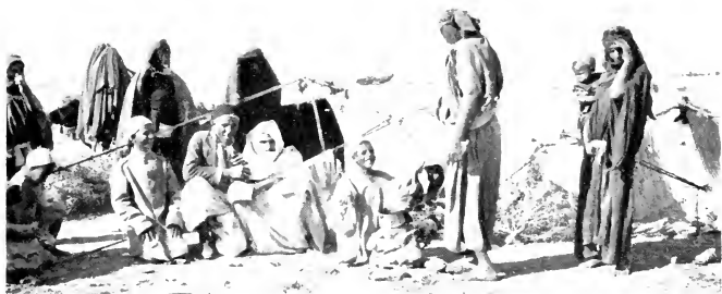
NOMAD TENTS NEAR JEDABIA