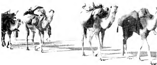
THE AUTHOR ASLEEP ON A CAMEL