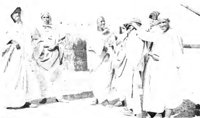
AT BUSEIMA: TEACHING THE FAQRUN FAMILY TO USE FIELD GLASSES