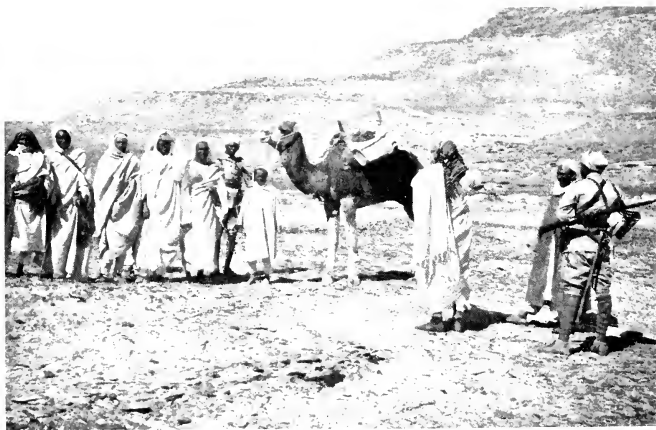
THE FIRST MEETING BETWEEN THE FAQRUN FAMILY AND OUR PARTY AT BUSEIMA