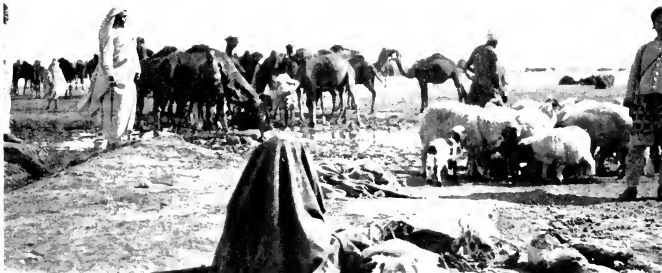
WELL AT JEDABIA