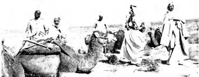
UNLOADING ON THE SECOND DAY FROM JEDABIA