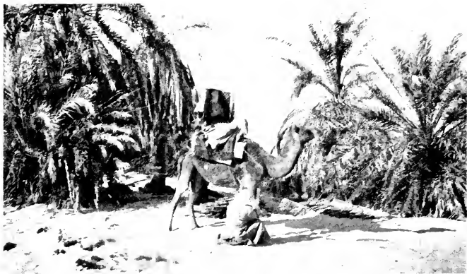
THE AUTHOR ON A CAMEL AT BUSEIMA