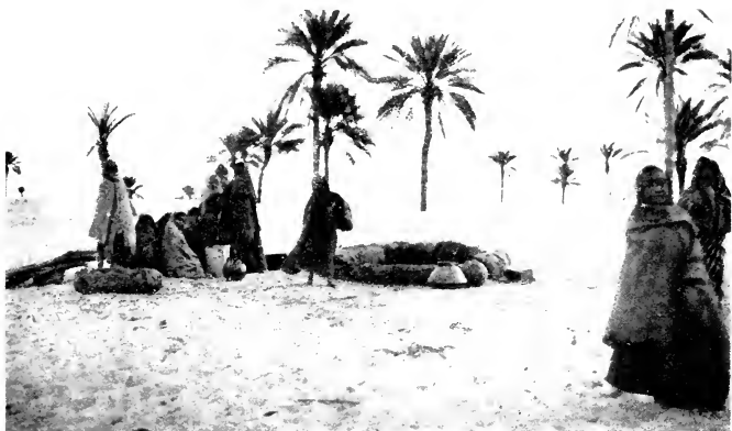
DESERT WELL AT JALO