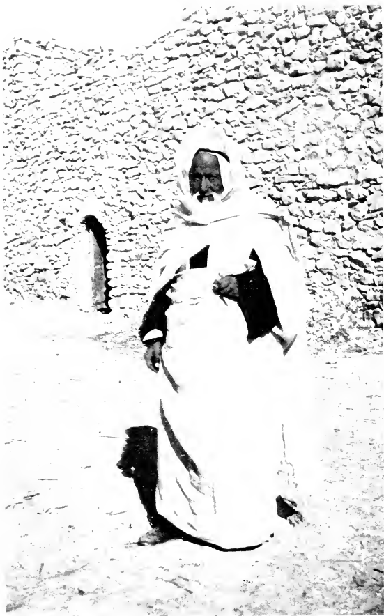
OUR HOST AT JAGHABUR