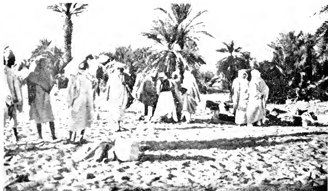
LOADING AT AWARDEI