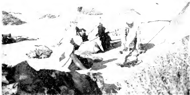
CAMP AT MEHEMSA: YUSUF, MOHAMMED AND AMAR