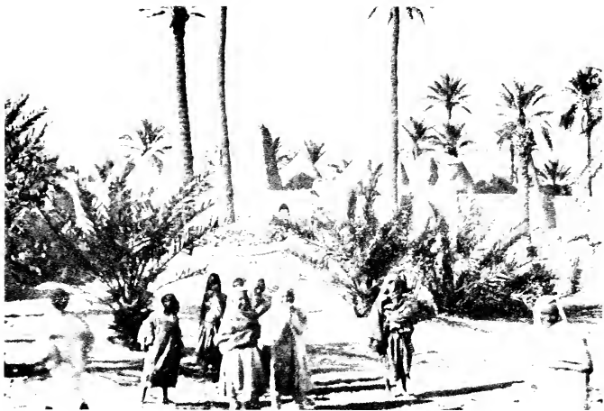
THE MOSQUE AT AUJELA, WHERE IS BURIED THE CLERK OF THE PROPHET MOHAMMAD