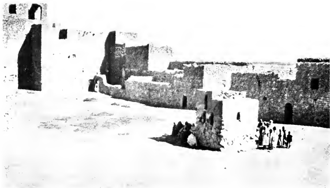
WELL IN ZAWIA AT JAGHABUB