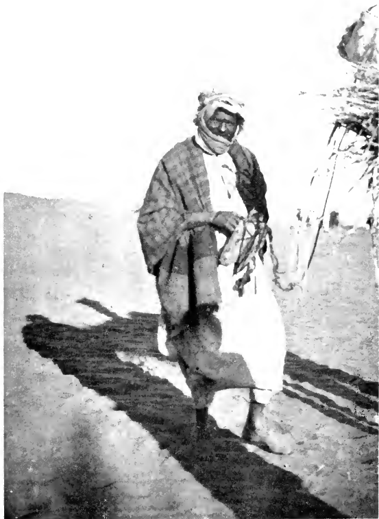
A TEBU AT AWARDEL IN KUFARA