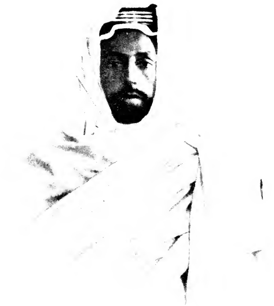
THE EMIR IDRIS ES SENUSSI