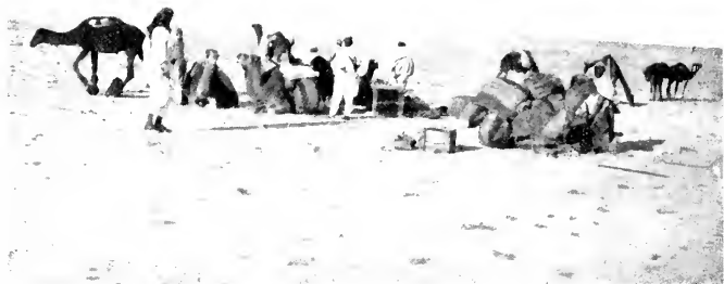
A HALT FOR THE NIGHT