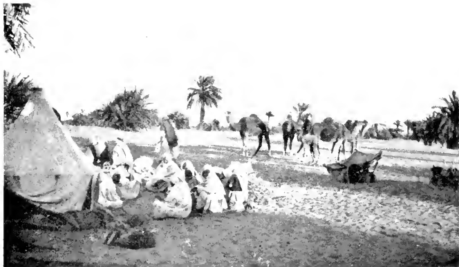
OUR CAMP AT AWARDEI