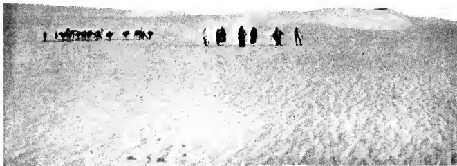
CARAVAN IN BU'NE COUNTRY NEAR BUSEIMA