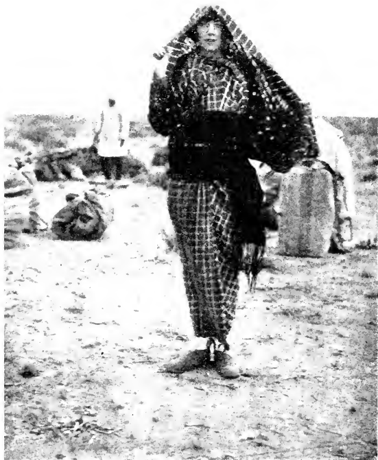
THE AUTHOR IN BEDUIN DRESS