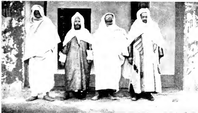
THE FOUR EKIHWAN WHO RECEIVED US AT TAJ