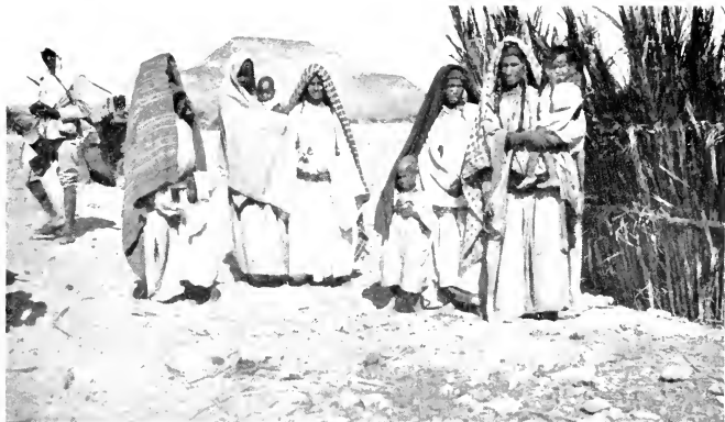
ZOUIA WOMEN AT BUSEIMA