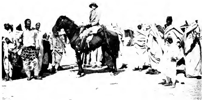
THE AUTHOR AT JEDABIA