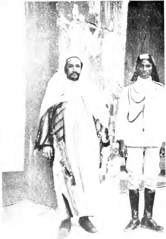
THE KAIMAKAAN AT TAJ