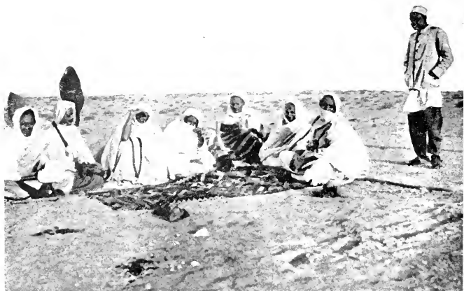
A LUNCH IN KUFARA VALLEY