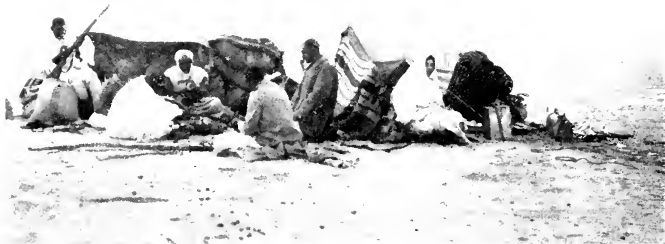
OUR CAMP AT BUTTAFAL