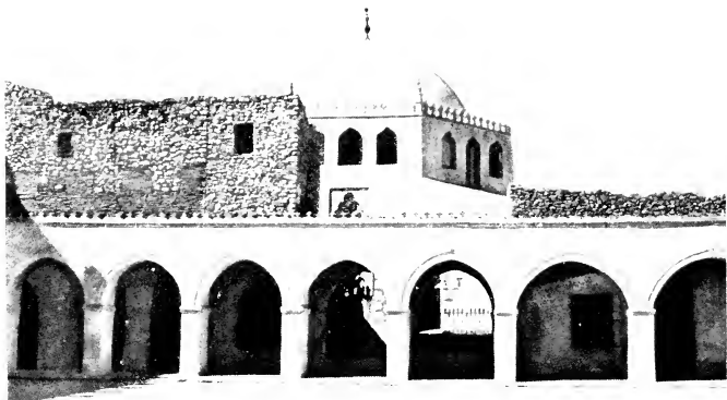
MOSQUE AND QUBA OF SIDI LEN ALI AT JAGHABUB