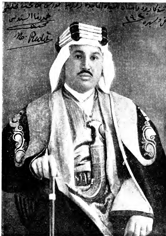
SAYED RIDA ES SEN'USSI