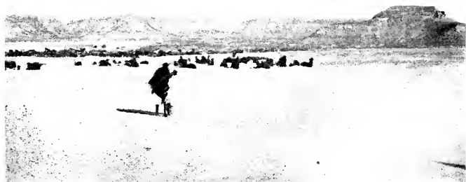
THE MOUNTAINS OF BUSEIMA