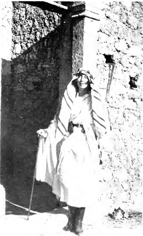
THE AUTHOR AS A BEDUIN SHEIK