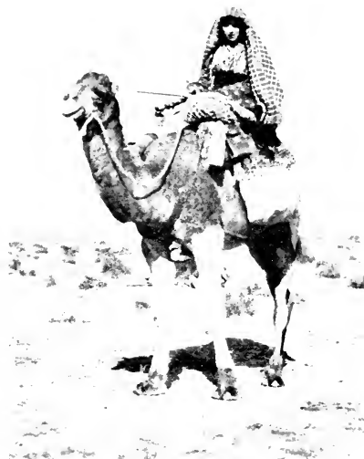
THE AUTHOR ON CAMEL-BACK