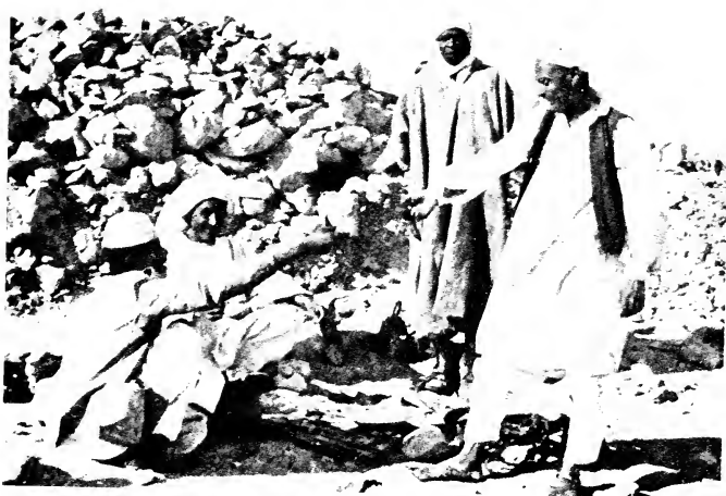
A GLASS OF MINT TEA ON THE WAY TO SIWA