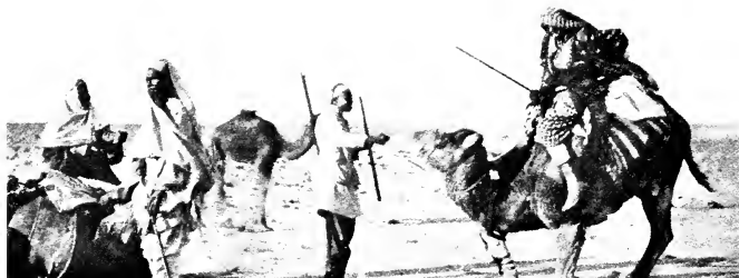
BARRAKING: A TOO SUDDEN DESCENT