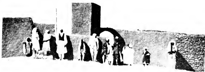
ZAWIA TOWER AT TAJI