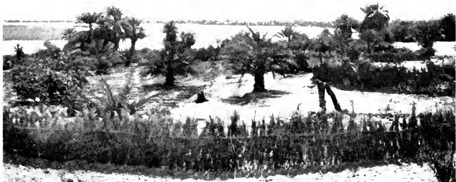
GARDENS AND LAKE AT BUSEIMA