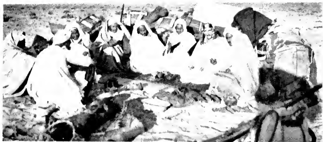
HASSANEIN BEY AND MOJABRAS DRINKING TEA