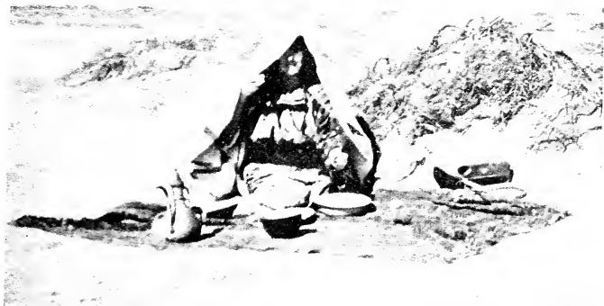
MY LONELY PICNIC IN KUFARA WADI