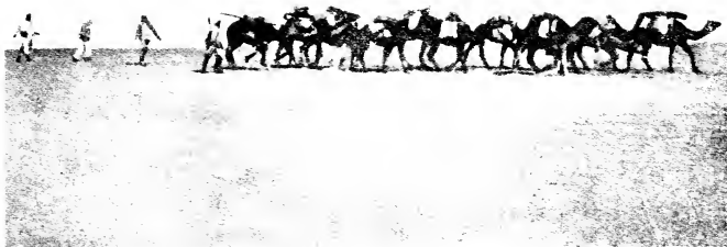
OUR CARAVAN APPROACHING AUJELA