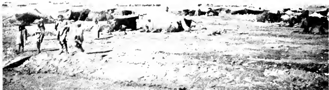
NOMAD ENCAMPMENTS ROUND JEDABIA