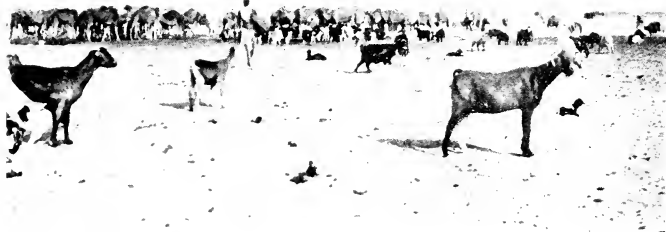
FLOCKS WATERING AT BIR RASSAM