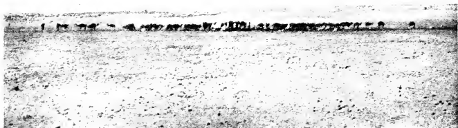
WADI FARIG: CAMELS AT THE WELL