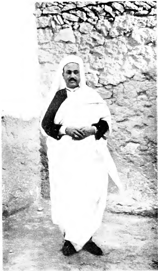
SAYED RIDA ES SENCUSI