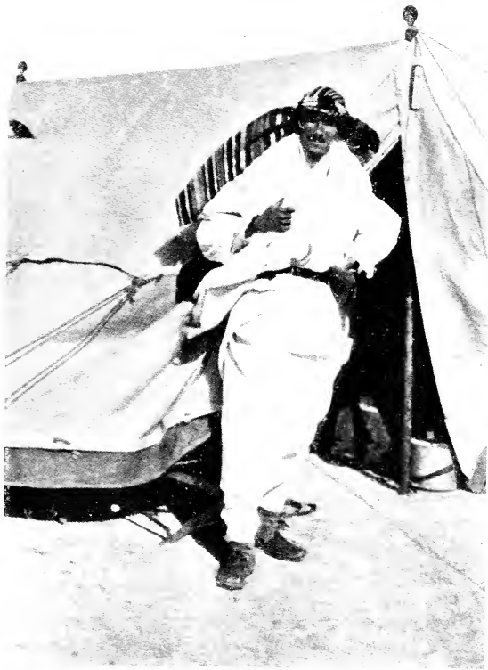
AHMED MOHAMMED BEY HASSANEIN. MY FELLOW EXPLORER