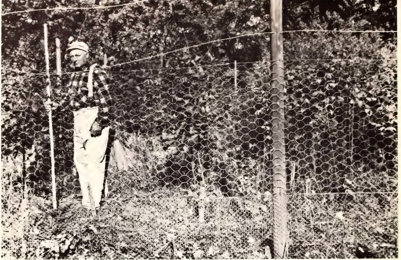
FIGURE 3. — The combination of fencing materials shown here protected a direct seeding of northern red oak from rabbits. It also kept out deer.