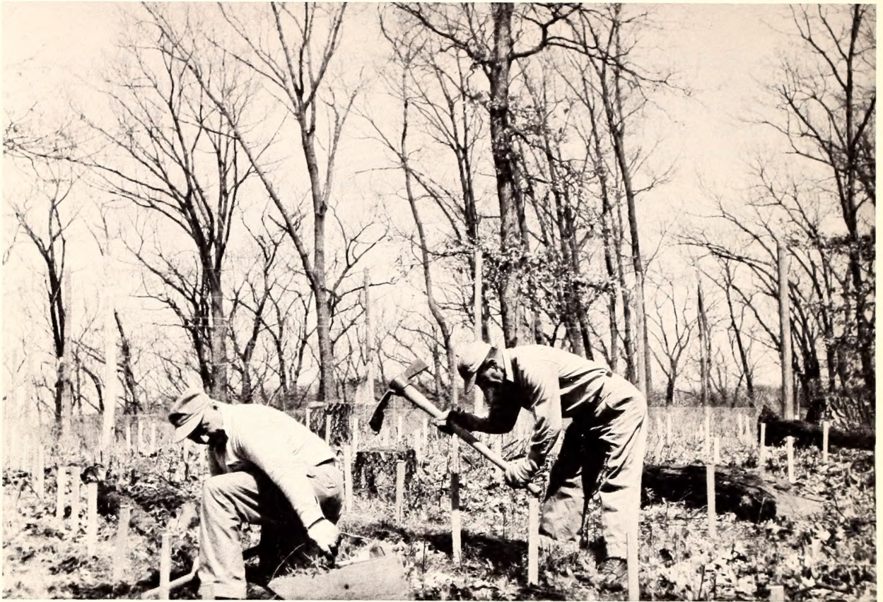
FIGURE 1. — Planting northern red oak seedlings with the mattock-and-hole method.