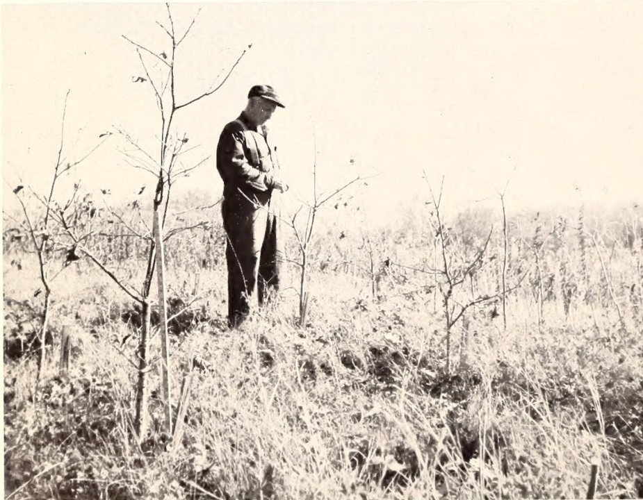
FIGURE 2. — The 10-year-old northern red oak trees on this open, soddy, old-field site are characteristically limby and multiple-stemmed.

Data from the 10-year regeneration tests suggest that animal damage to small oak seedlings is cyclic. Most of it occurred during two winters, those of 1954-55 and 1955-56. Complete records of all injured and uninjured trees were kept during the latter year. A summary of these data shows that 67 percent of 1,379 trees under observation was damaged to some degree by rodents, deer, or mechanical factors (table 2).