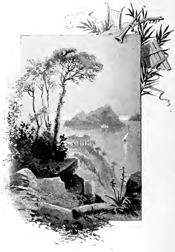
The Isles of Greece.