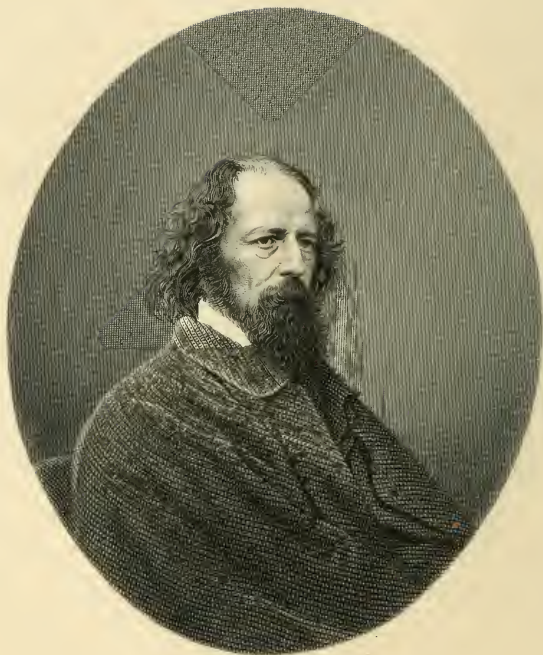
Engraved by Vincent Brooks from a Photograph taken by the London Stereoscopic Company Nov r 28 th 1864.