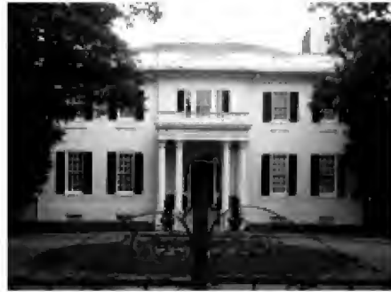
The Governor's Mansion, Richmond, is the longest occupied governor's mansion in the United States.