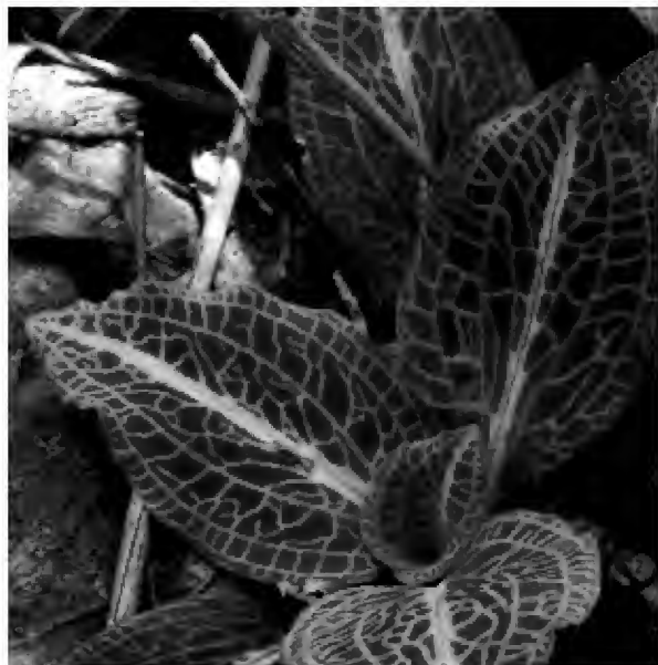
Goodyera pubescens , Downy Rattlesnake Plantain, is the Society's 2016 Wildflower of the Year.

the more likely that heartleaf would be found. In their study, no heartleaf was found in any forest younger than 34 years, but it was always found in plots with trees 60 years old or older. In contrast, Downy Rattlesnake Plantain was found in young and old forests alike—abundance was not tightly linked to the age of the forest stand.