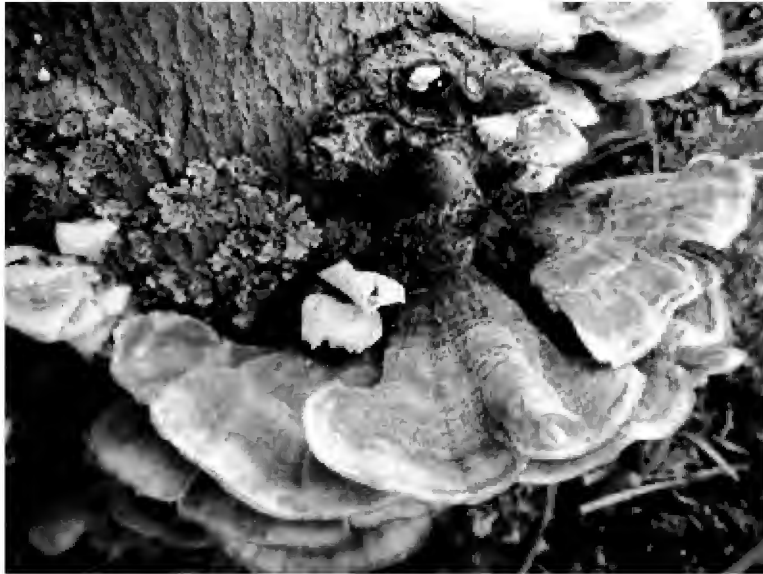
Rainbow fungus juts from a tree trunk near Hidden Rocks in the proposed Shenandoah Mountain National Scenic Area.

The pressure for energy development on our public lands is not going away and constitutes the main threat to Shenandoah Mountain. The entire area is underlain by the Marcellus shale, in which are trapped large quantities of natural gas, which puts the mountain at risk for natural gas drilling and associated infrastructure.