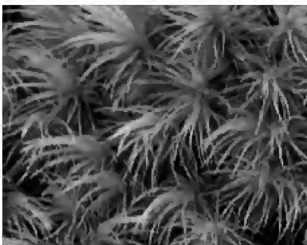
Common Broom Moss, Dicranum scoparium, is among the easiest mosses to identify, its leaves seemingly swept in one direction.