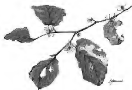
Witch Hazel in flower. (Illustration by Betty Gatewood)

The park and the Appalachian Trail is where she observed and painted the fall-blooming Witch Hazel. According to Bill McLaughlin, curator of plants with the U.S. Botanic Garden, it was her depiction of the