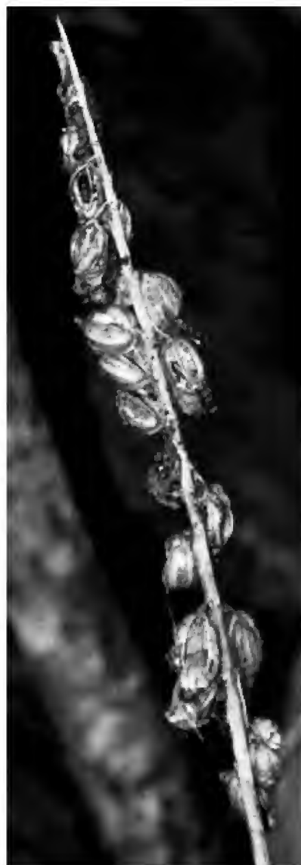
Goodyera pubescens seedpods.