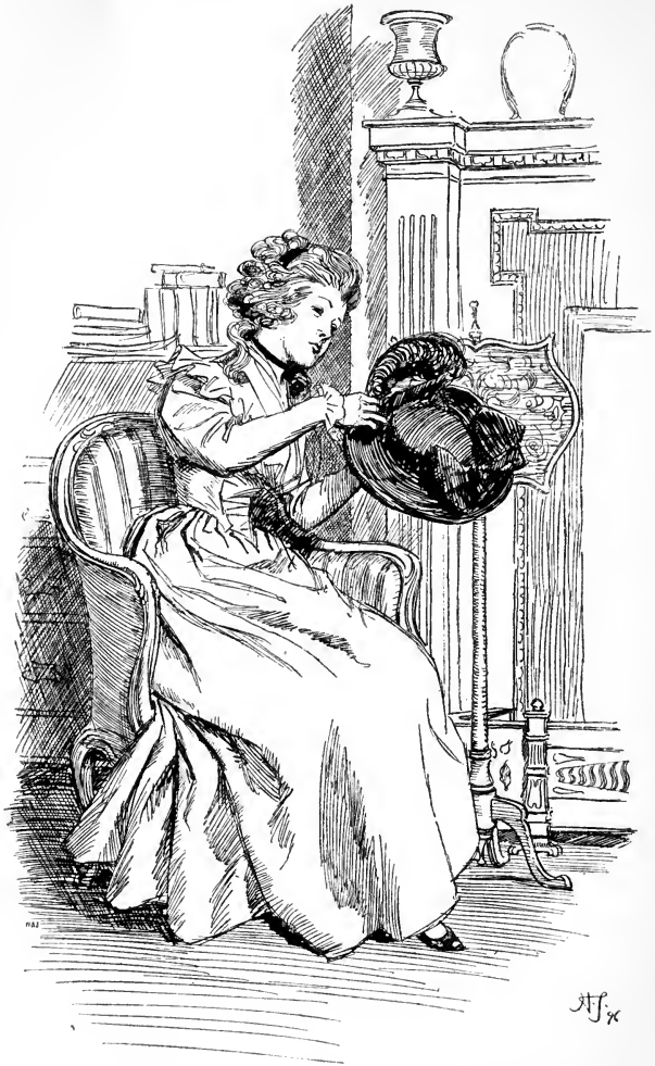
'She put in the feather last night.'