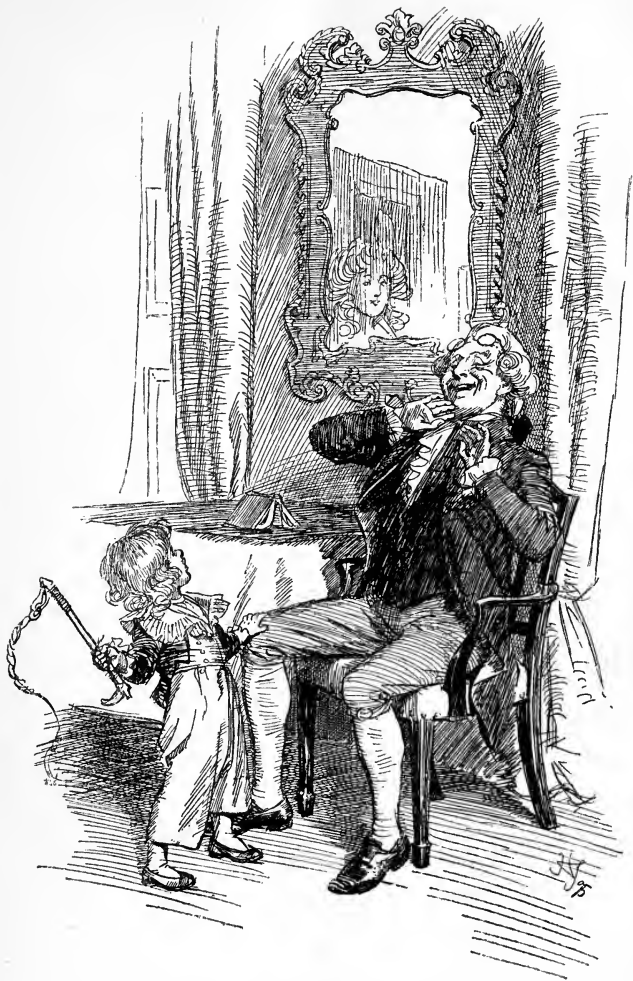
His son's son, a child of four years old.