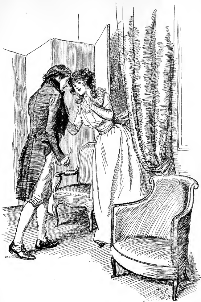
Drawing him a little aside.