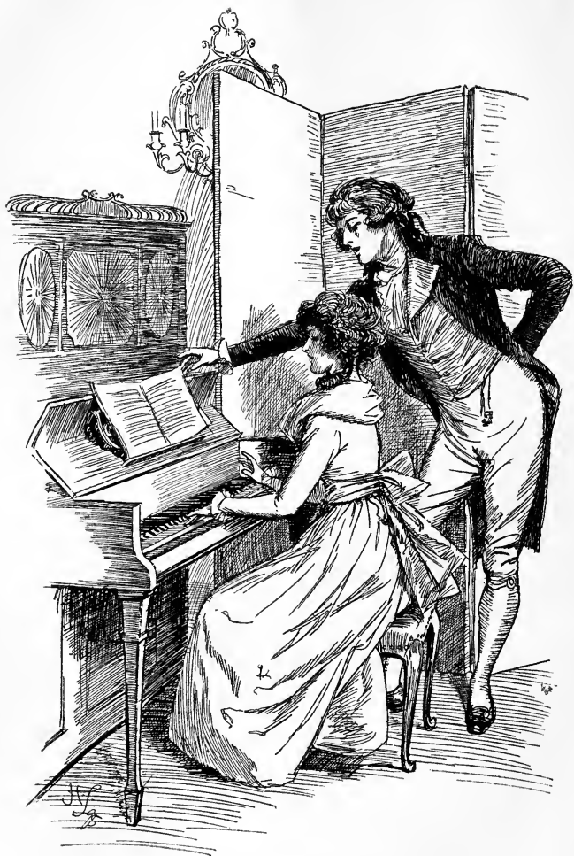
They sang together.