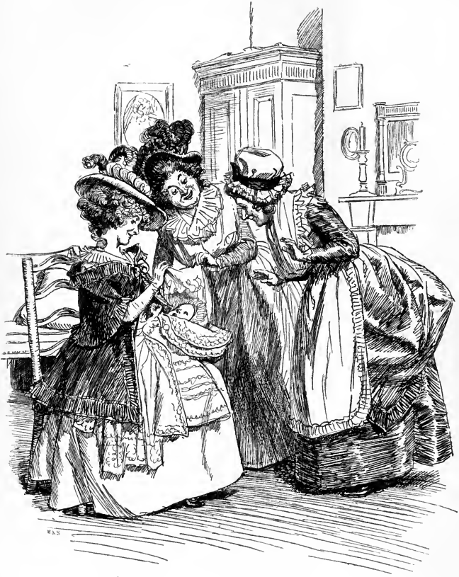
Showing her child to the housekeeper.