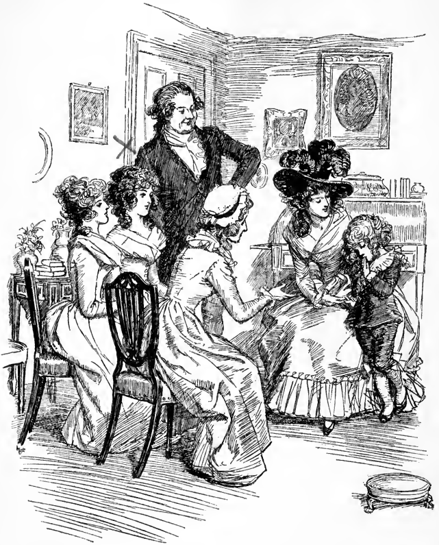
So shy before company.