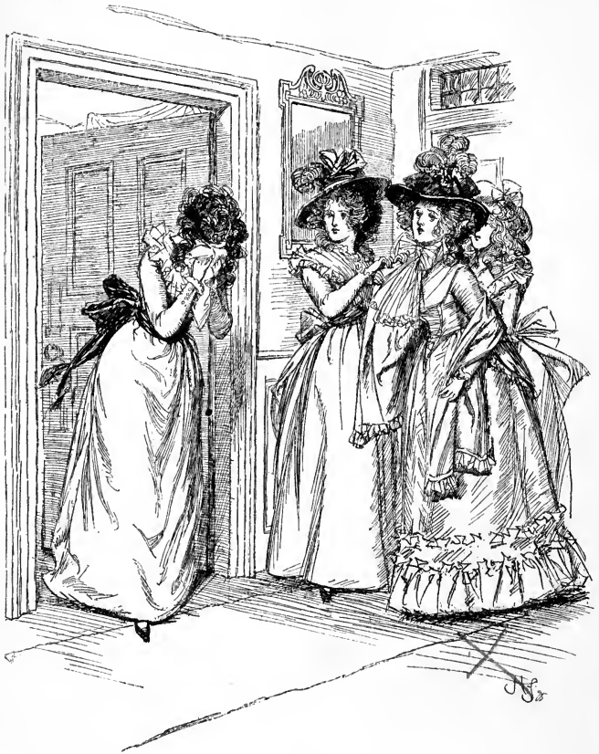
Apparently in violent affliction.