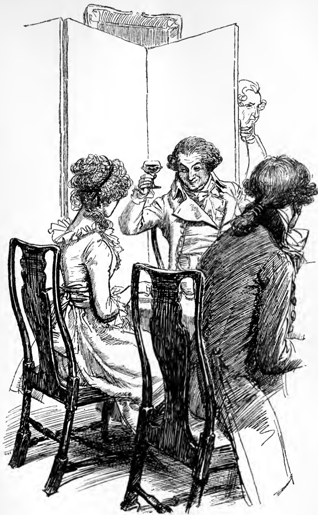
Drinking to her best affections.