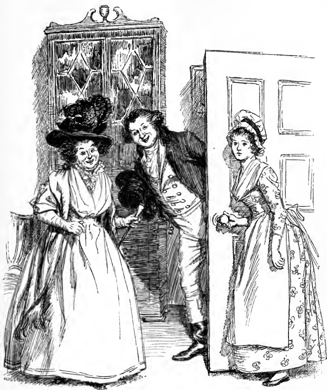
Came to take a survey of the guest.