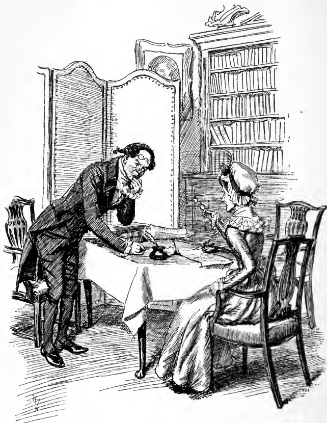
Talking over the business.