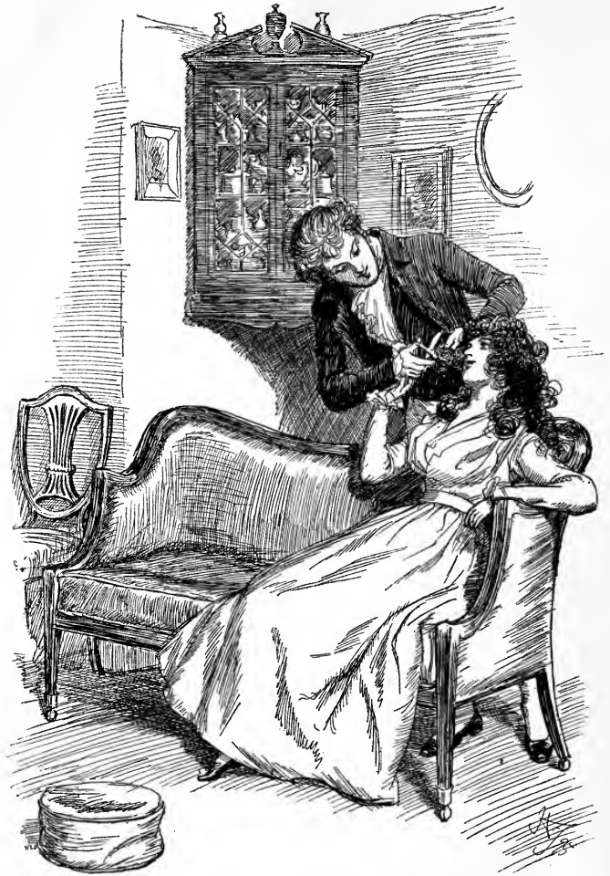
He cut off a long lock of her hair.