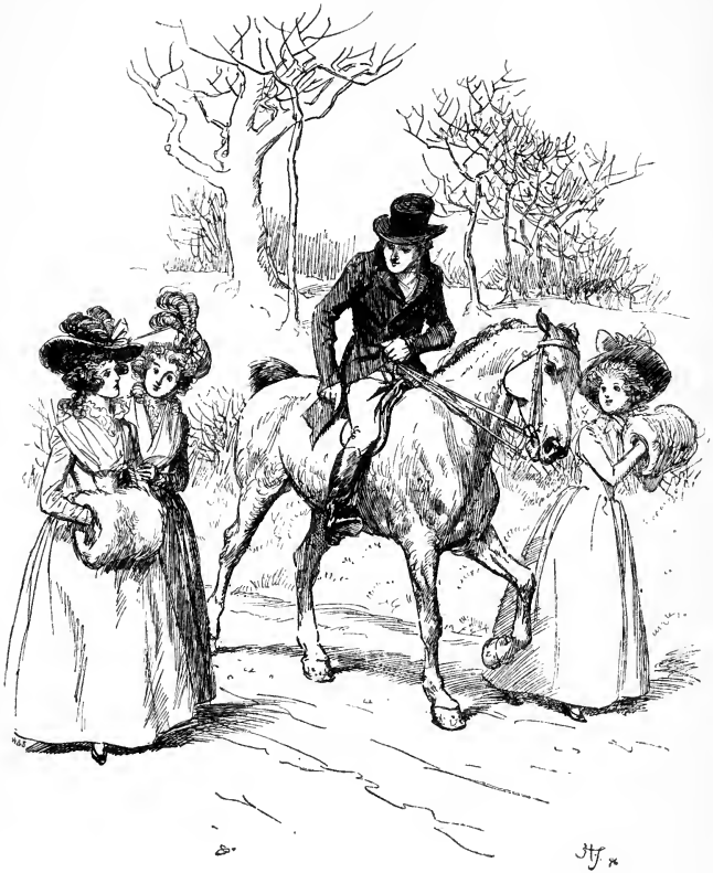
Begging her to stop.