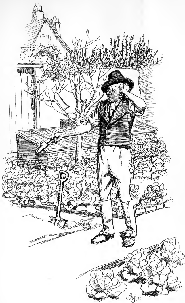
The gardener's lamentations.