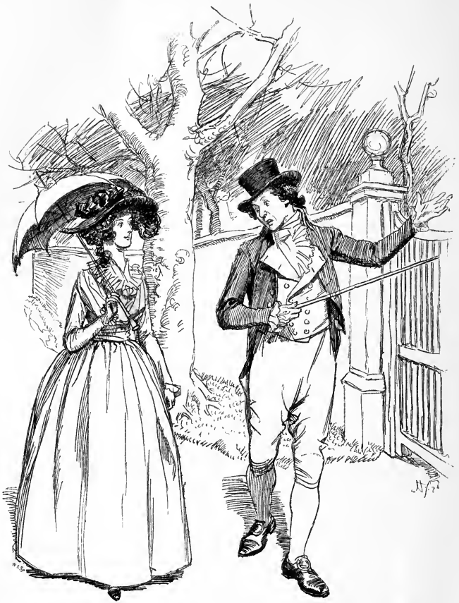
'Everything in such respectable condition.'