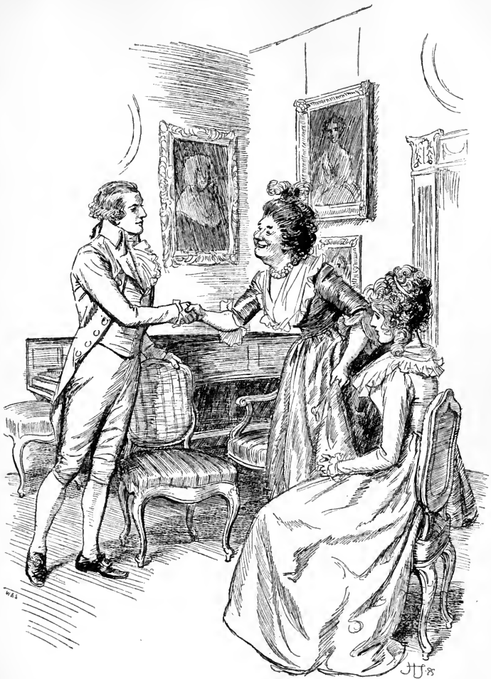
Mrs. Jennings assured him directly that she should not stand upon ceremony.