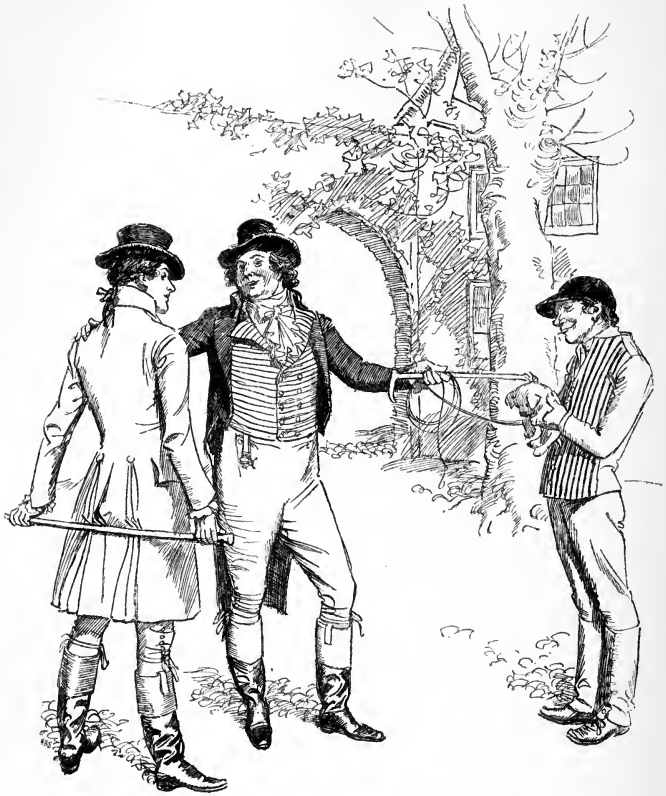
Offered him one of Folly's puppies.