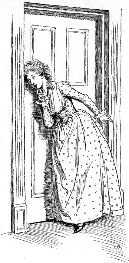
Listening at the door.