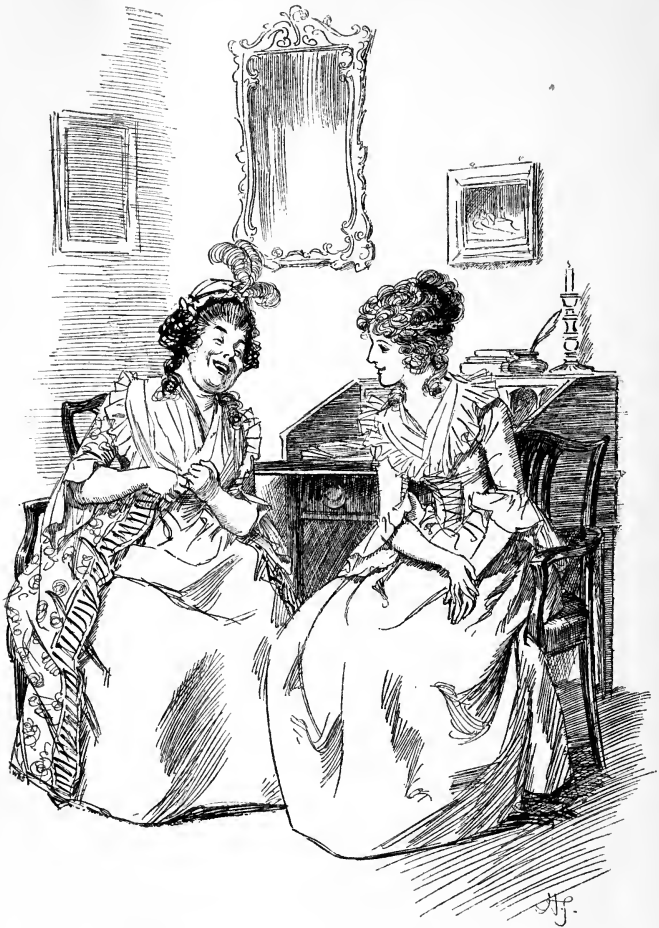
Both gained considerable amusement.