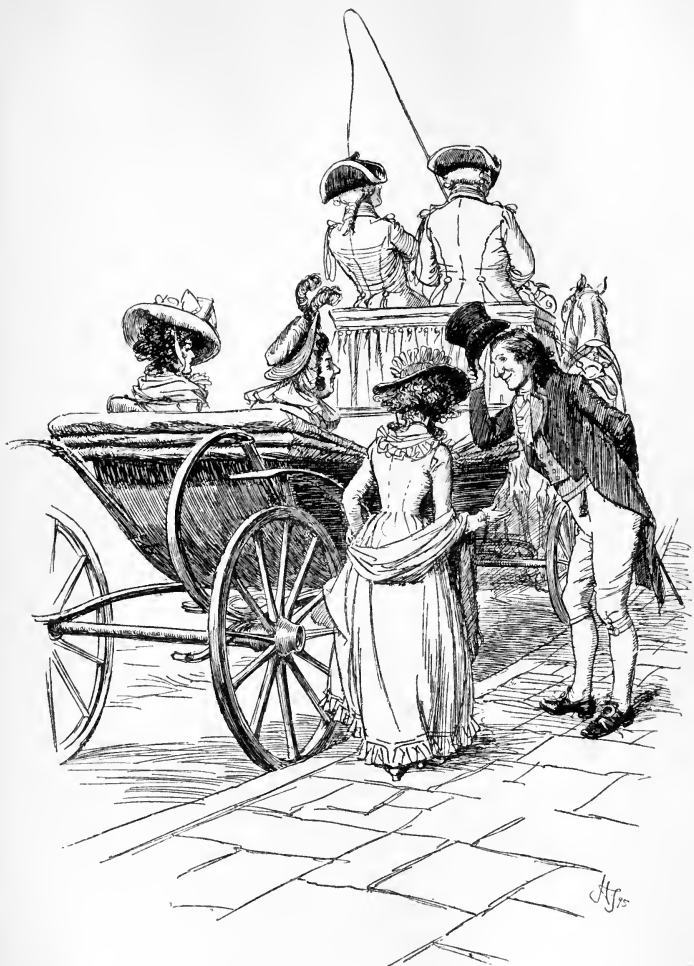
Introduced to Mrs. Jennings.