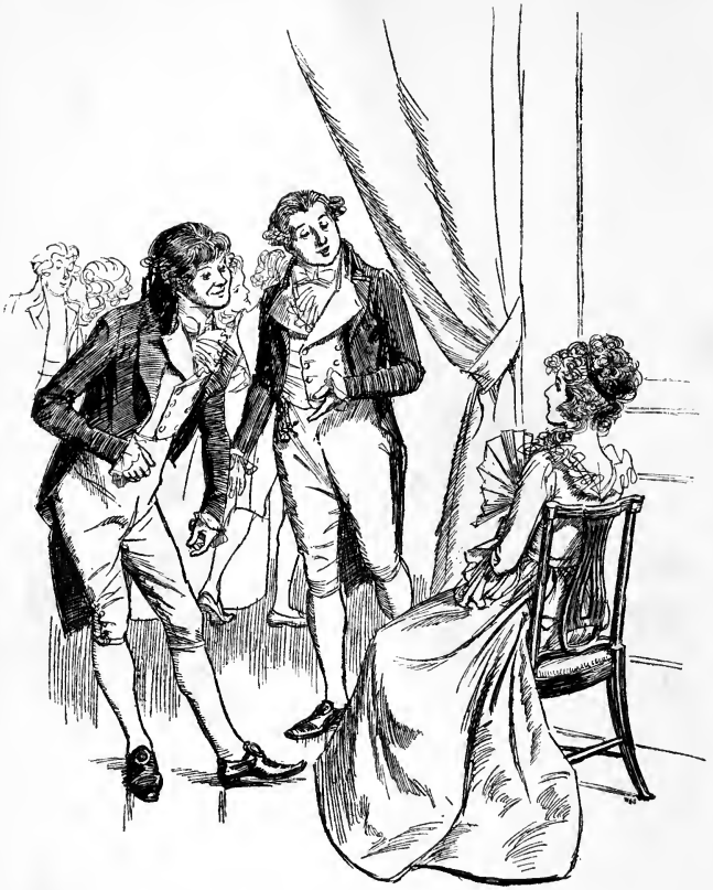
Mr. Daskwood introduced him.—P. 219.