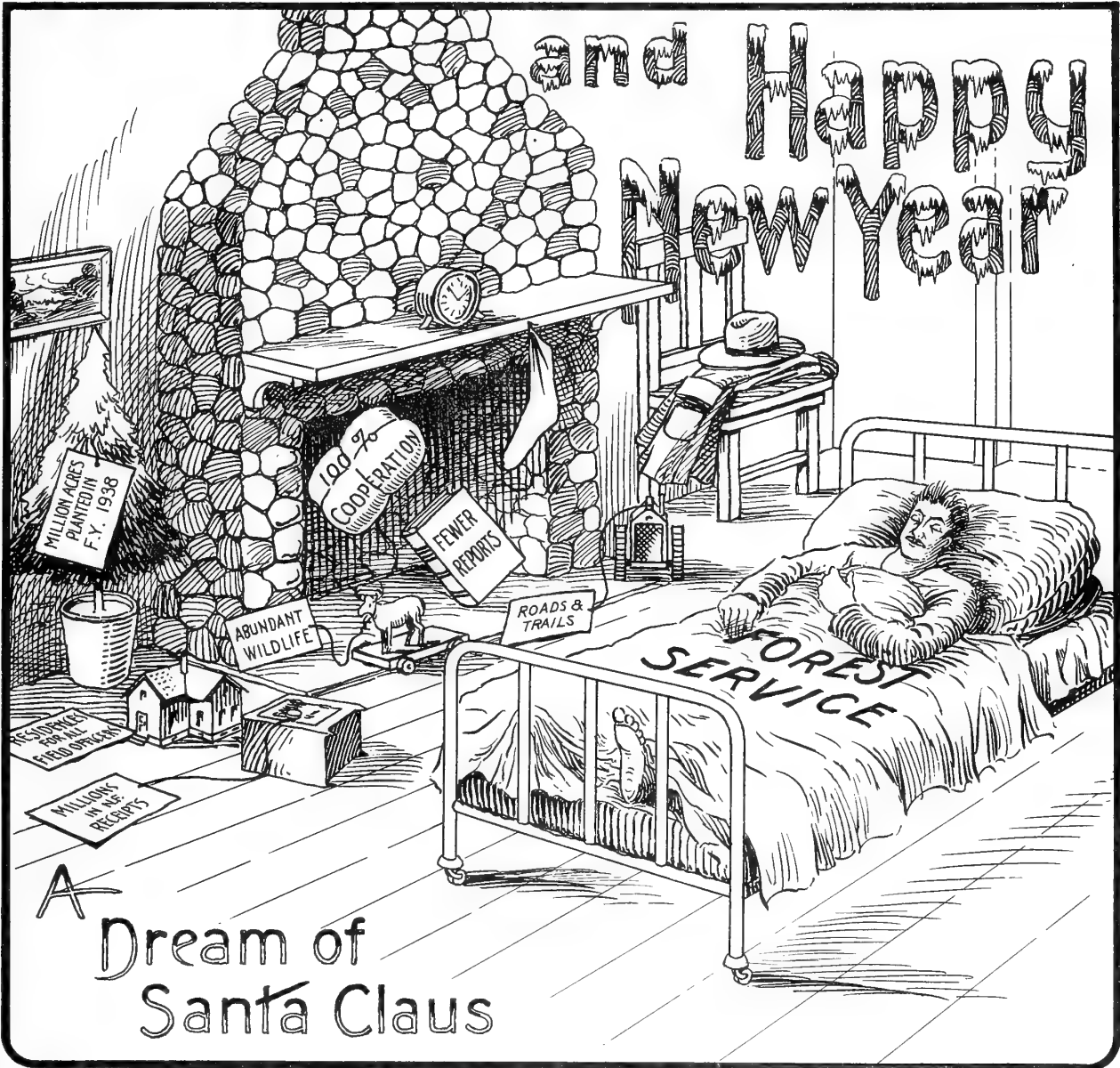
A Dream of Santa Claus