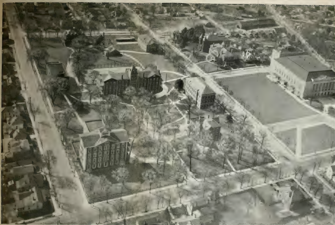
AIRPLANE VIEW OF SHAW UNIVERSITY

LEFT OF MAIN CAMPUS: Athletic field and faculty homes. MAIN CAMPUS: Front left —Estey Hall, women's dormitory; Rear left —Greenleaf Hall, University Chapel and University Dining Hall; Center —Shaw Hall, men's dormitory; Rear of Shaw Hall —Tennis courts and central heating plant; Front right —Meserve Hall; Center right —Science Hall; Extreme rear center —Convention Hall, theological dormitory; Rear right —Tupper Memorial Gymnasium. RIGHT OF MAIN CAMPUS: Front —Raleigh Memorial Auditorium; Rear left of auditorium —Library Hall and Leonard Building; Extreme rear —Mary Talbert Community House.