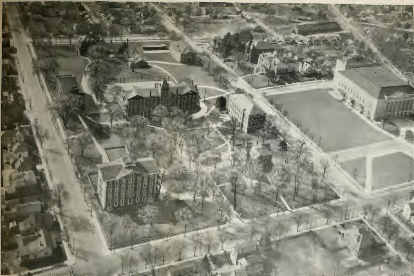
AIRPLANE VIEW OF SHAW UNIVERSITY

LEFT OF MAIN CAMPUS: Athletic field and faculty homes. MAIN CAMPUS: Front left —Estey Hall, women's dormitory; Rear left —Greenleaf Hall, University Chapel and University Dining Hall; Center —Shaw Hall, men's dormitory; Rear of Shaw Hall —Tennis courts and central heating plant; Front right —Meserve Hall; Center right —Science Hall; Extreme rear center —Convention Hall, theological dormitory; Rear right —Tupper Memorial Gymnasium. RIGHT OF MAIN CAMPUS: Front —Raleigh Memorial Auditorium; Rear left of auditorium —Library Hall and Leonard Building; Extreme rear —Mary Talbert Community House.