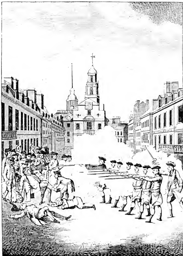
BOSTON MASSACRE, MARCH 5, 1770.