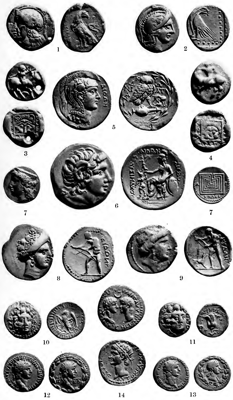
SILVER COINS OF CRETE