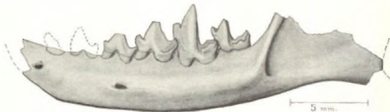
FIG. 1. Simpsonictis tenuis , left dentary, labial side. Reconstructed from A.M.N.H. Nos. 35348 and 35350. Dashed outlines are restored from related forms. \times 4 .

DISCUSSION: Simpsonictis can be generally characterized as including the smallest known miacids and as having a dentition apparently adapted to