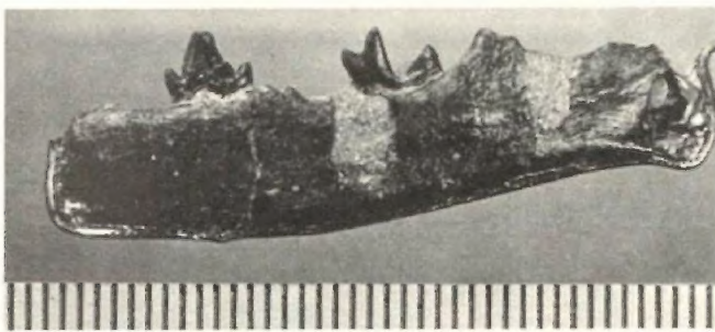
FIG. 3. Simpsonictis tenuis , A.M.N.H. No. 35350, posterior part of right dentary with P_4 and M_2 ; Gidley Quarry, middle Paleocene of North America. Unretouched photograph of lingual side. Scale with 0.5-mm. divisions at plane of focus. \times 4 .

DIAGNOSIS (REVISED): Characters of the genus, with P_4 having the