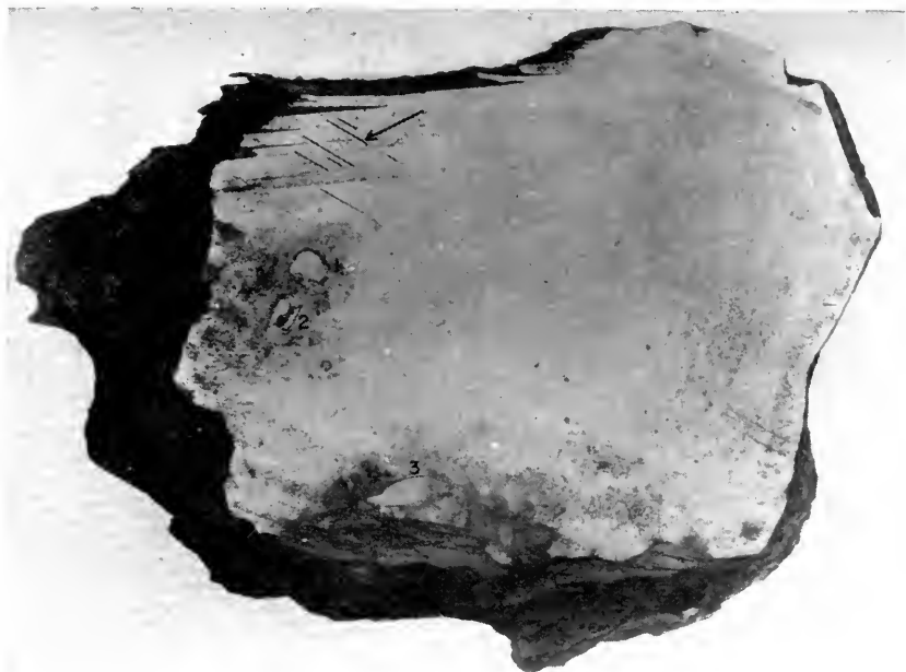
FIG. 56. A polished slice of Smithonia, showing layered structure (upper left). Rhombic pattern (arrow), where two sets of layered plates have intersected, may also be observed. The three (numbered) irregularly rounded bodies are troilite nodules. About \times 7/10 .

find the land belonged to Mr. Benton. I secured the meteorite from Mr. Benton. It was found at the foot of a hill on the north side, stuck in the ground a little bit. It was reported that one fell over here about six years ago. This one was found in the spring of 1940, about April. The first piece [sample for examination] I sent