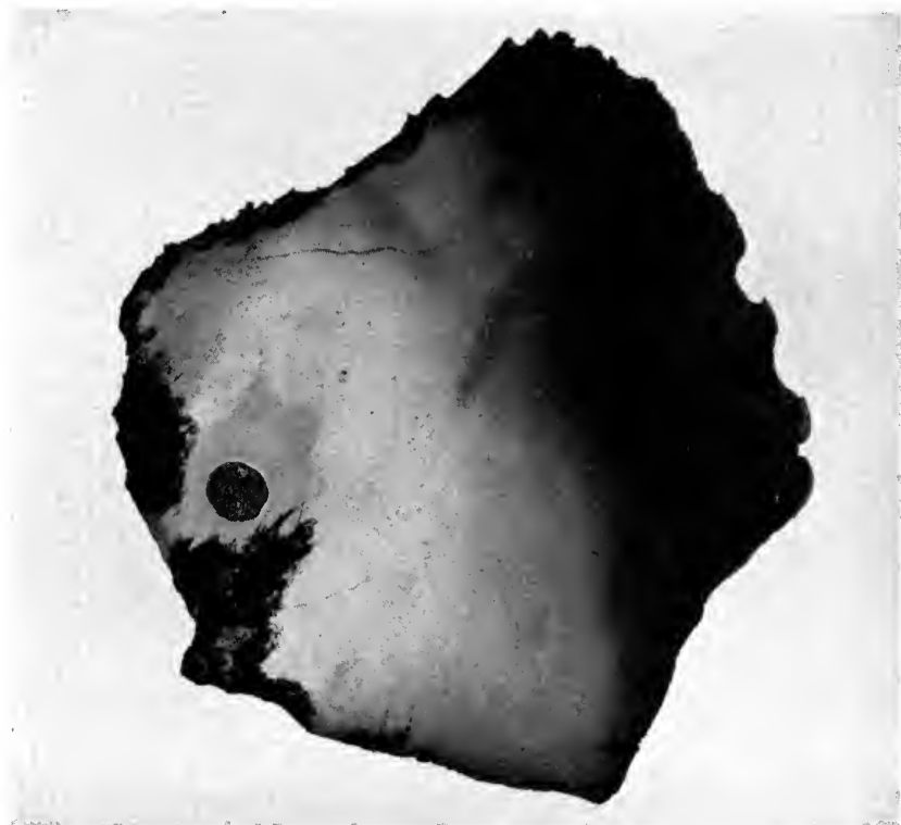
FIG. 57. Etched section with a rounded nodule of troilite, which is partially surrounded by schreibersite. No rhabdites have been observed in this section. About \times 8/10 .

The shape of the meteorite, as it appears now, is roughly that of a flattened elongated cone (fig. 55). The original shape cannot be reconstructed, chiefly because weathering has progressed unevenly. At one end, however, where it has progressed the least, outlines of