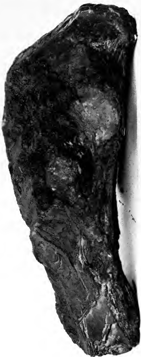
FIG. 55. The Smithsonian meteorite. The surface is covered with shale or platy oxides. \times \frac{1}{3} .