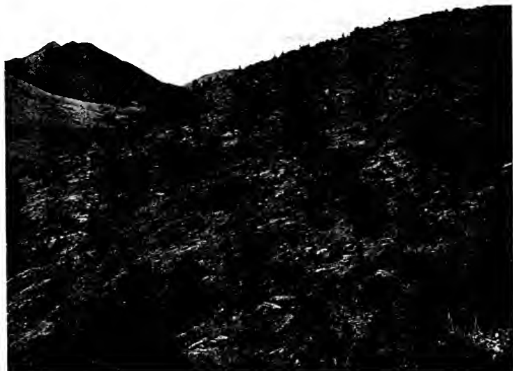
F. Satellite Townsendia spathulata subpopulation habitat on midslope of east ridge; original Lesica collection area