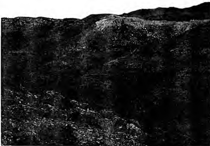
G. Limestone quarry outside of BLM boundaries in prime Townsendia spathulata habitat, photographed from the north end of the east ridge on BLM land among Townsendia spathulata subpopulation, looking west.