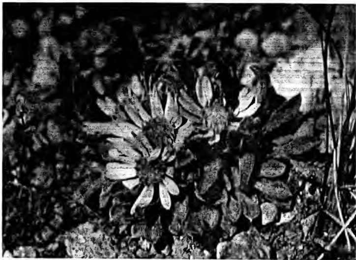
A. Townsendia spathulata close-up