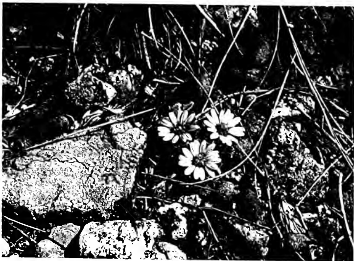
B. Townsendia spathulata habitat