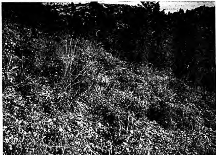
E. Satellite Townsendia spathulata subpopulation habitat, on toeslope of east ridge