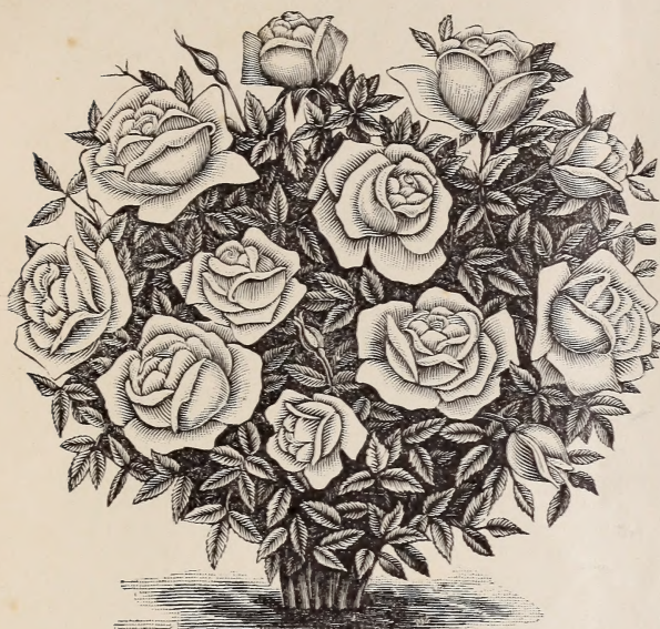
R.V.K.Sa ETOILE DE LYON.