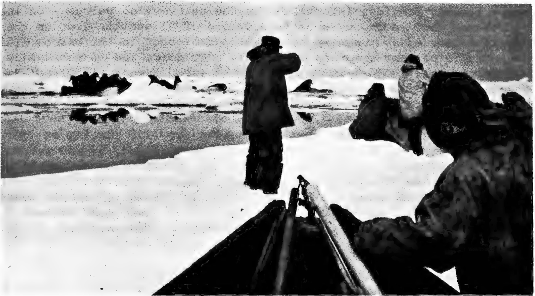
Figure 11.--The shooting has started and the walrus are alarmed.