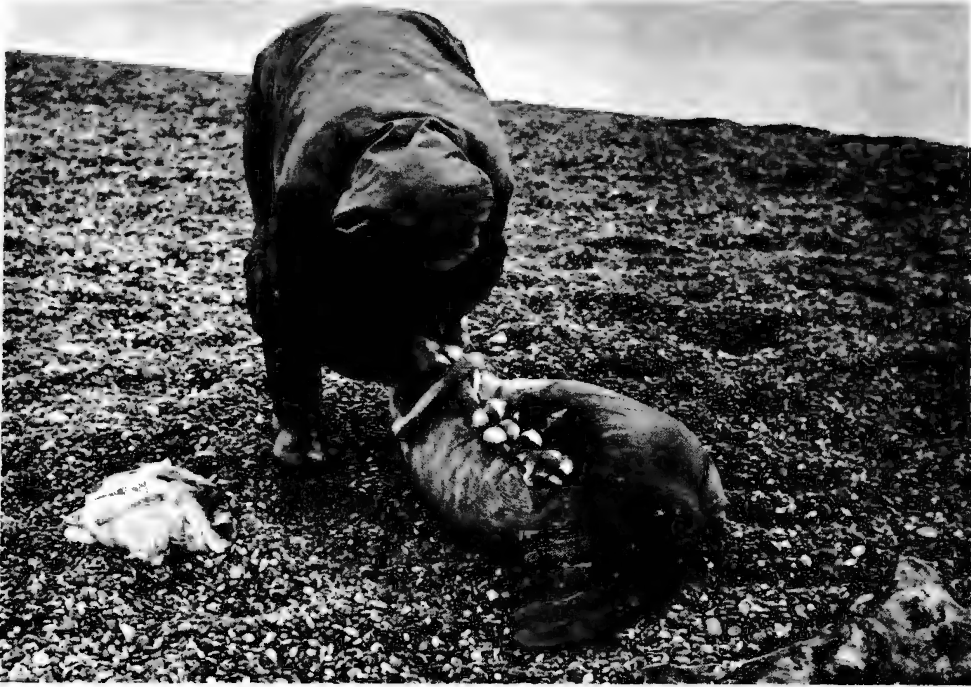
Figure 7.--A completed mungona, or meatball, ready for storage in underground meat hole.

animals estimated by Fay must be added the annual kill in Siberia. Krypton (1956) states that the annual harvest in Siberia is 4,000 to 6,000. Assuming 5,000 to be the average, and applying the 60 percent figure derived for Gambell (assuming complete utilization of calves), the total loss in Siberian waters is approximately 3,300 and the total annual kill then becomes 8,300. Thus, the total annual kill of Pacific walrus in both Alaskan and Siberian waters is estimated at 10,500 plus or minus about 2,000.