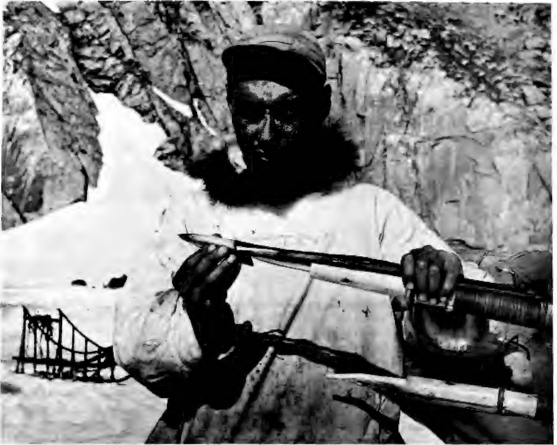
Figure 9.--Bone harpoon head with iron tip, used at Little Diomede. The harpoon head is lashed to an ivory foreshaft, which is set in a whale-bone base.

Dunbar's (1956) discussion of walrus hunting by Canadian Eskimos applies equally well to hunting at Little Diomede.