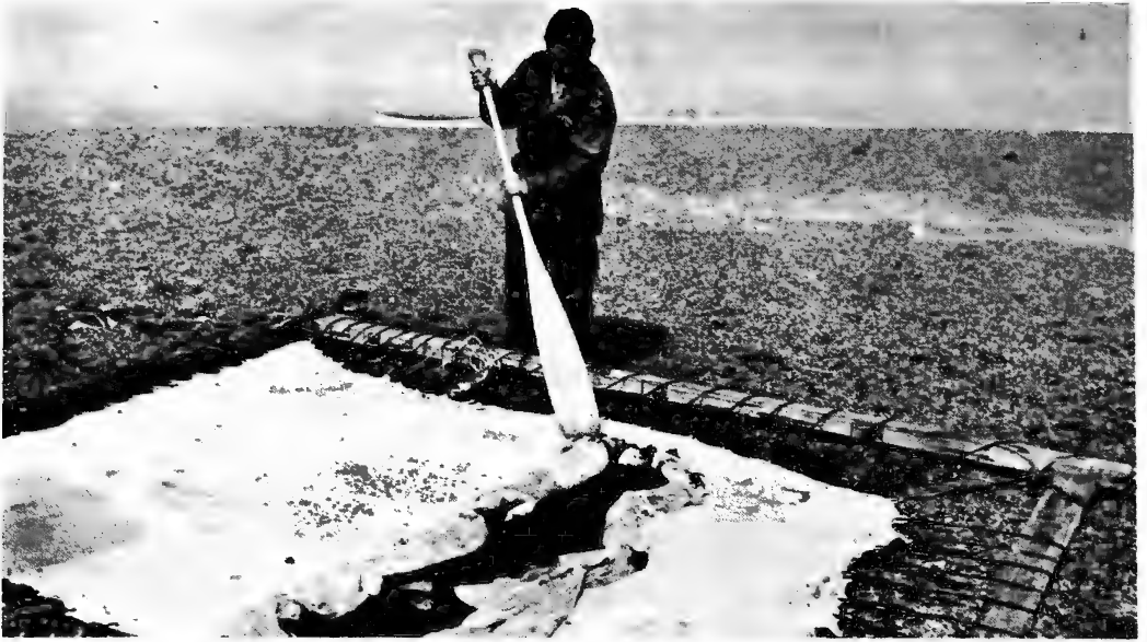
Figure 3.--Scraping hair and epidermis from walrus hide in preparation for splitting the hide. The hide has been stored in a warm place until the epidermis would "slip."