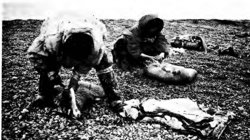
Figure 6.--Eskimo hunter (dressed in walrus-intestine parka) preparing walrus for storage. Pieces of hide measuring about 2 by 3 feet, with blubber and a thin layer of meat attached, are folded and sewed together with walrus hide rope.