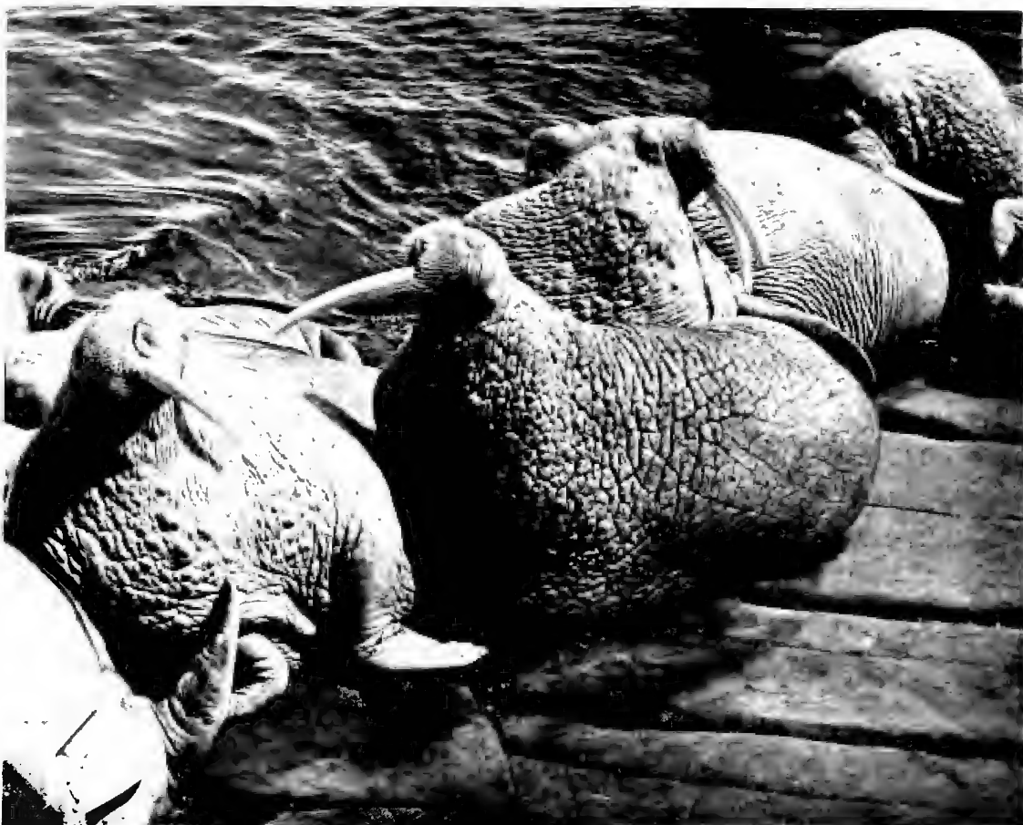
Figure 2.--Male walrus on the Walrus Islands.

In April the northern movement becomes more purposeful. According to Fay (1955), the advance guard is wholly males, usually in groups of 2 to 10 individuals. He further states, on the basis of information provided to him by Ryder ( in litt. ), that the southernmost extremes of range have also been recorded at this time, presumably as a result of southward drift of isolated floes of ice.