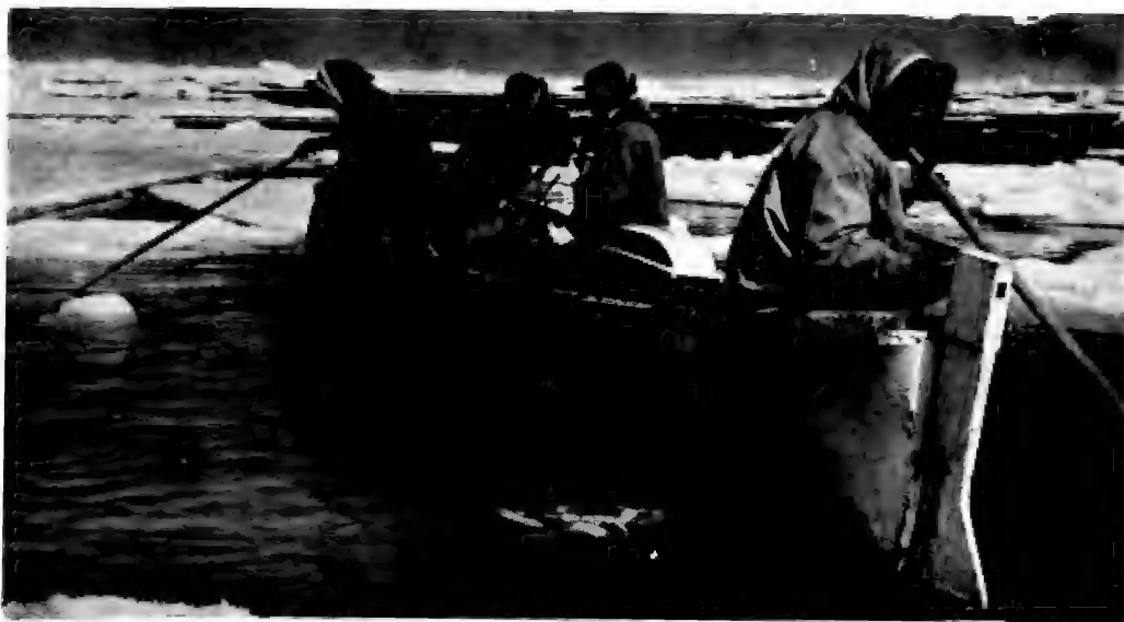
Figure 8.--Skin boat or umiak threading its way through ice floes during a walrus hunt near Gambell.

often be hauled over fields of floating ice. Meat is unloaded and hauled back to the village on sleds while some of the hunters sleep, either on the rocks or in the boats. After the shore ice goes out the boats land on the rocks in front of the village.