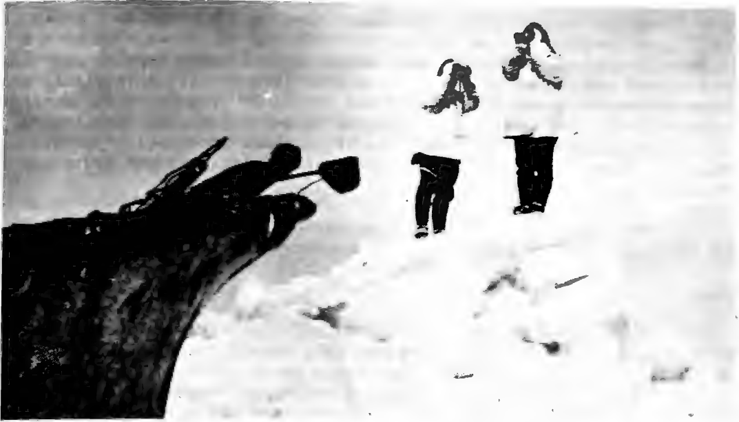
Figure 10.--Lookouts on a pressure ridge of a large ice floe searching the horizon for walrus or other game.