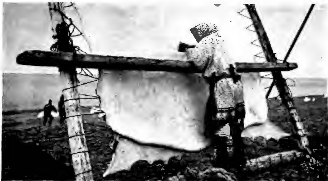
Figure 5.--Eskimo woman at Gambell splitting walrus hide for use as a boat covering.