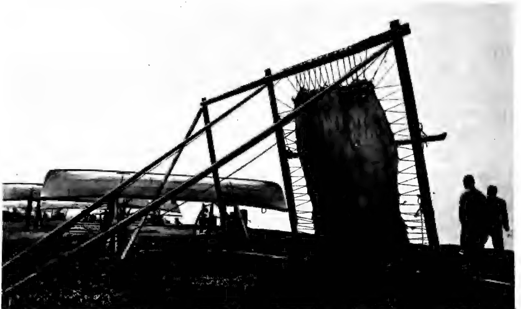
Figure 4.--Walrus hide stretched and ready for splitting.