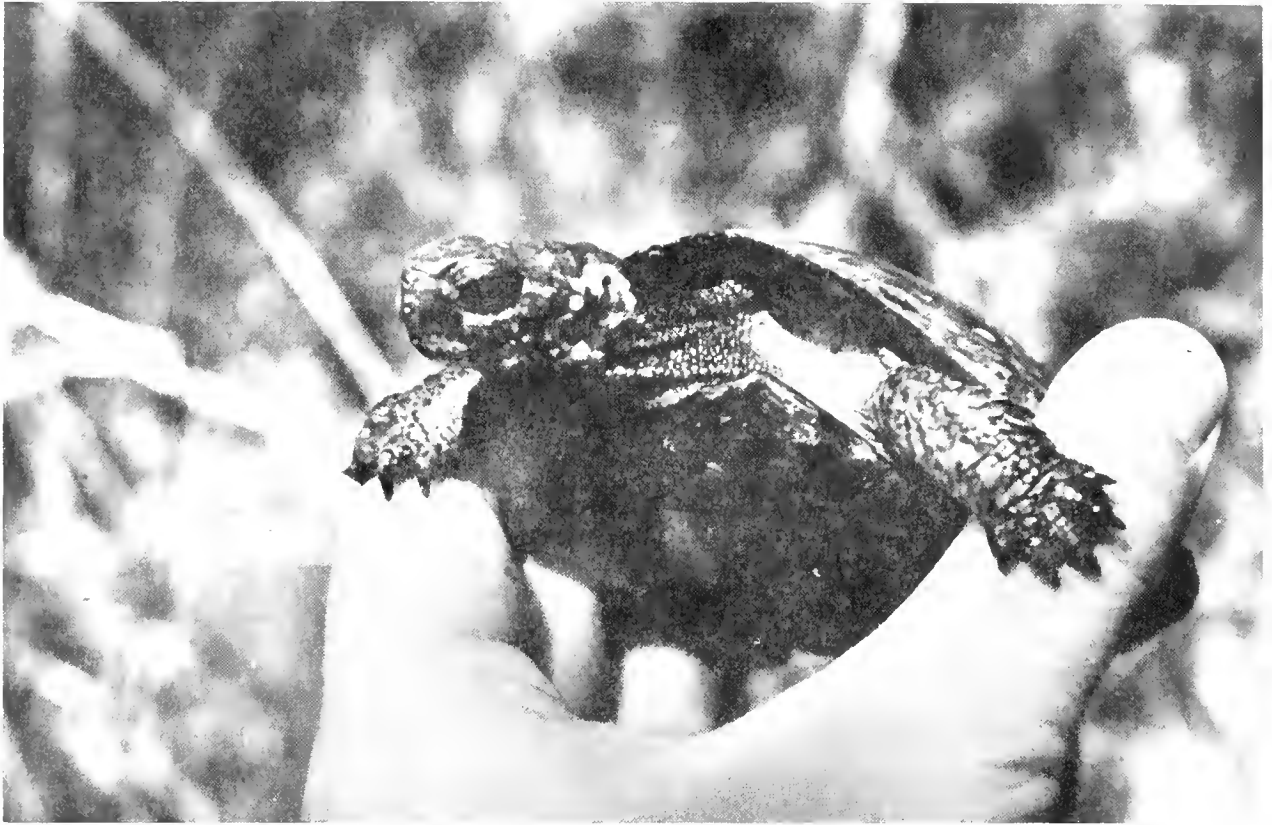
Fig. 1. Adult bog turtle.