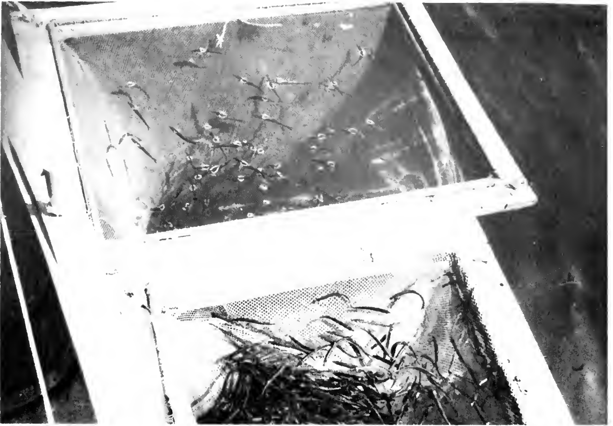
Figure 2.--Holding pockets used in testing the Maine sardine tag. The lower pocket contains untagged fish; the upper, tagged fish.

Herring selected for tagging were in the 5- to 6-inch total length group. Fish of that size group are especially sought by the sardine fishery and, when tagged in the late summer and autumn, offer an opportunity for overwintering and recovery the following year. The dorsal musculature of a 5- to 6-inch herring is well-formed and holds the tag well, whereas smaller fish of about 4 inches show distress and inability to sound when the tag is attached.