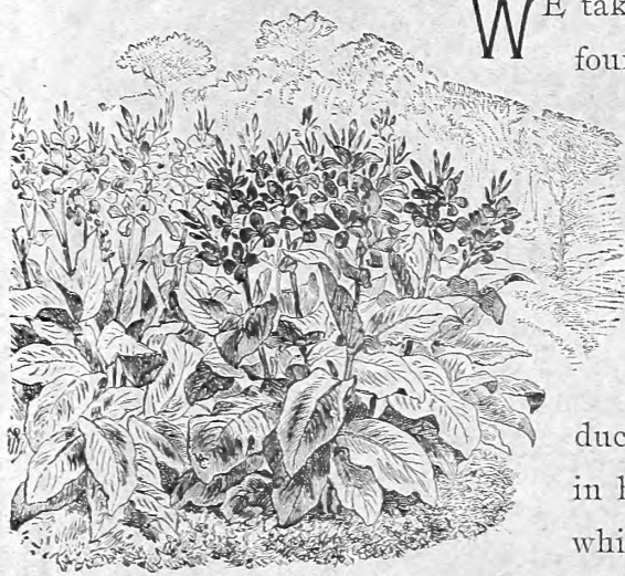
A GROUP OF DWARF FRENCH CANNAS.

WE take pleasure in sending you the accompanying colored plate of four of our newest varieties of Dwarf French Cannas, which you may find acceptable for framing and hanging in your office.