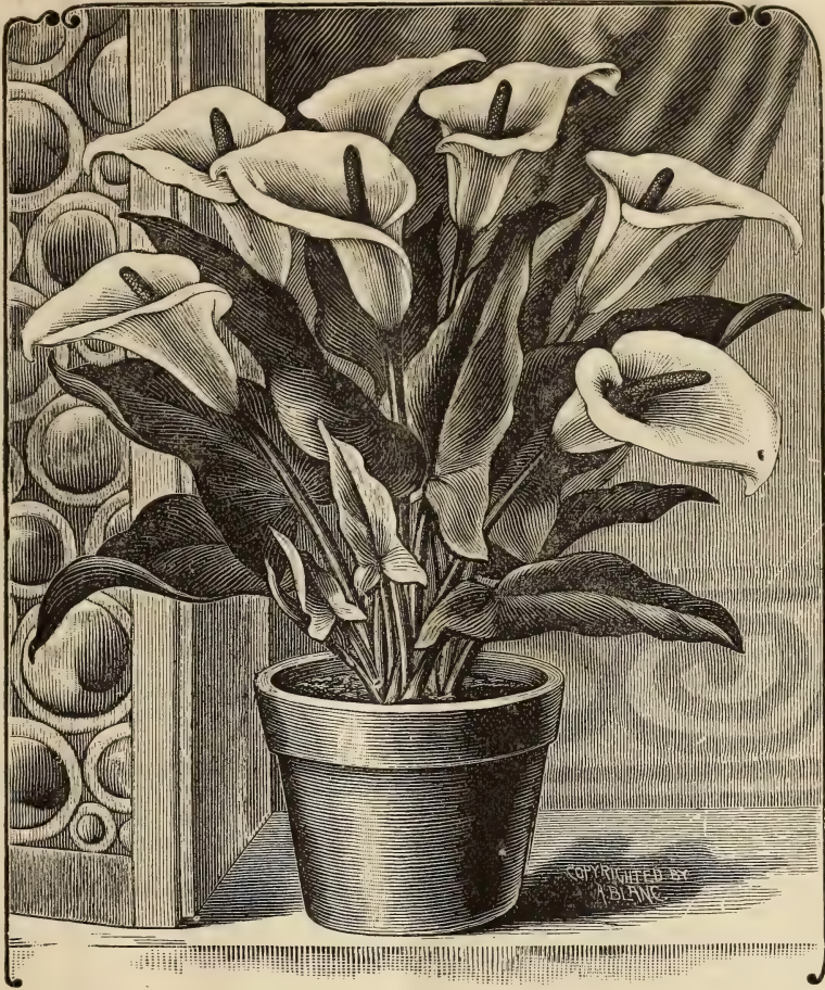
DWARF CALLA LILY LITTLE GEM.