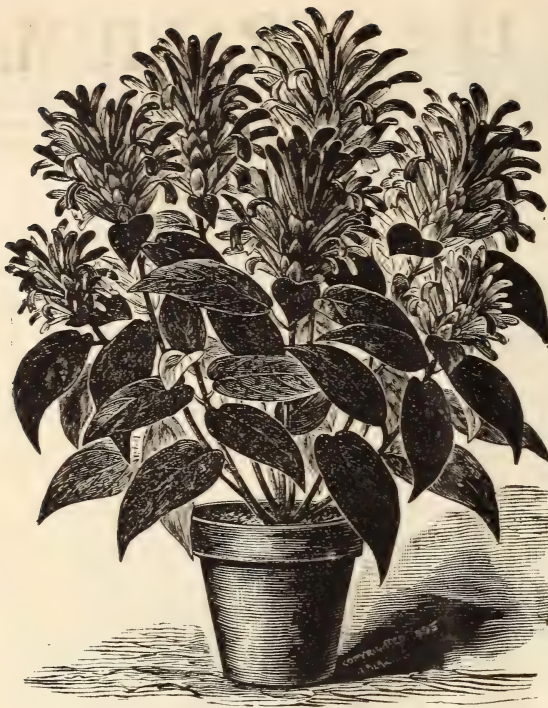
NEW DWARF JUSTICIA VELUNTINA.

Cuphea Eminens —Giant cigar plant; pretty spikes of scarlet flowers, tipped with gold and green. 2½ in., 40 cts. per doz.; $3 per hundred.