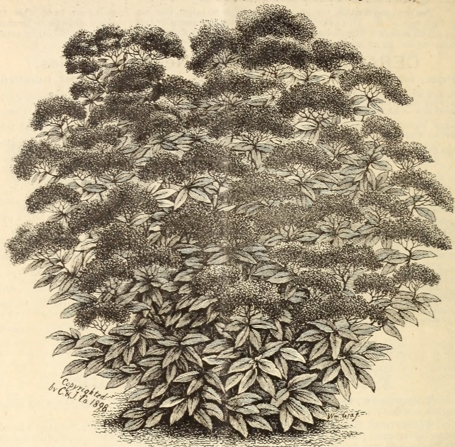
NEW CRIMSON SPIREA, "ANTHONY WATERER."

T HIS is undoubtedly the most valuable, hardy, ornamental shrub recently introduced. Grows 14 to 18 inches high, in erect, compact, bushy form. It is a true perpetual bloomer, bearing large clusters of bright crimson flowers all through the season, or as long as kept in growing condition. Valuable for bedding and borders, also as a market plant; fine for florists and for forcing. Price for fine one year plants, 8 to 10 inches high, from open ground, $6 per 100; $50 per 1000. Two year, 12 to 15 in., $8 per 100; $70 per 1000.