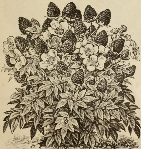
NEW STRAWBERRY RASPBERRY.

New Mammoth Canna ITALIA —NOVELTY, '97. Belongs to same class as Austria and imported from Europe at same time. Equally large as Austria, and similar in every way except color, which is rich golden yellow with a broad blotch of dark crimson maroon in the centre of each petal and throat. $1.50 per doz.; $10 per 100.