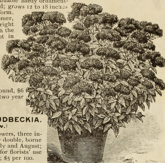
NEW CRIMSON SPIREA, A. WATERER.

Undoubtedly the most valuable hardy ornamental Shrub recently introduced; grows 12 to 18 inches high; bushy, compact form. It is a true perpetual bloomer, bearing large clusters of bright crimson flowers all through the season or as long as kept in growing condition; highly recommended for bedding and borders, also as market plant for florists and for forcing; its constant bloom and bright color make it particularly valuable. Price—Fine one year plants from open ground, $6 per 100, $50 per 1000; two year plants, $10 per 100.