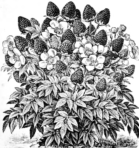
NEW STRAWBERRY RASPBERRY.

Tested here for three years, and constantly growing in favor; one of the most beautiful fruits ever seen. Berries the size and shape of the largest strawberries; bright, rich, glowing scarlet; fine for jams, jellies, and cooking. Bush grows 18 inches to two feet high, bears the first season and continues fruiting for three months; dies down in winter, but is entirely hardy, and does well everywhere regardless of drought or heat. $1 per doz.; $5 per 100.