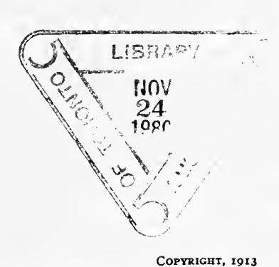
BY SCHURZ MEMORIAL COMMITTEE