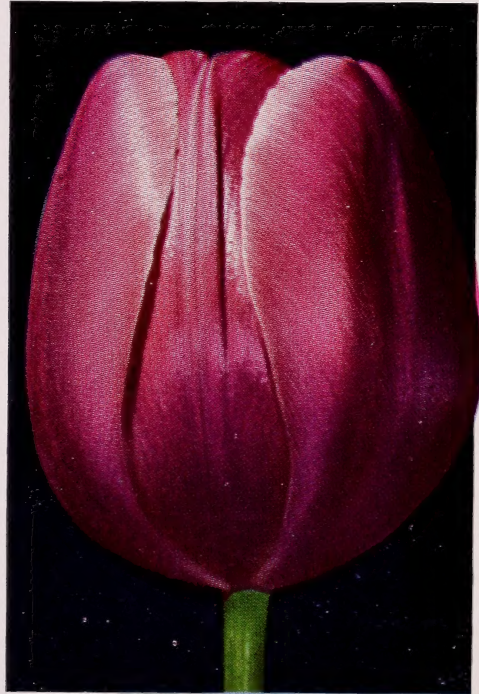
Indian Chief (Breeder)

ROSABELLA. Luminous rose with broad pink edge. Inside shell-pink on creamy white base. Large flower on tall, strong stem. 3 bulbs, 35c; 6 for 65c; 12 for $1.15; 25 for $1.95; 100 for $7.00.