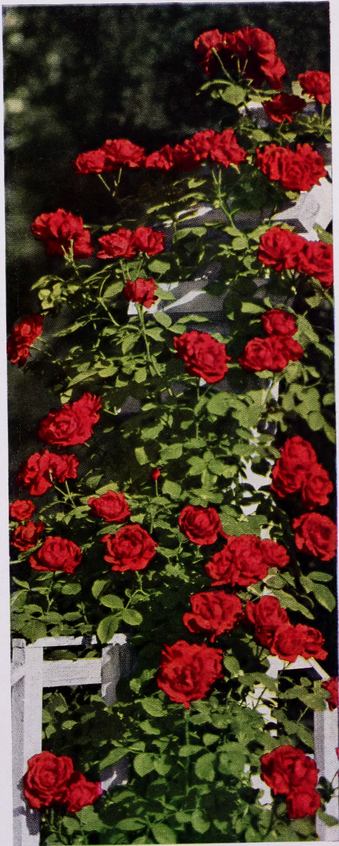
Paul's Scarlet Climber

All Prices on Roses include delivery charges.