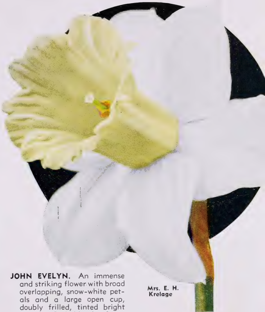
Mrs. E. H. Krelage

BERNARDINO. Few can surpass Bernardino in color, form or grace. Its wide expanded frilled cup is heavily stained deep orange and apricot, and supported on a creamy white perianth. 3 bulbs, 45c; 6 for 80c; 12 for $1.45; 25 for $2.65; 100 for $9.60.