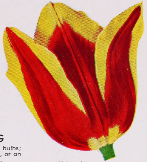
Keizerskroon (Single Early)

THERESE. White center; anthers black. Petals inside vermilion-red, outside carmine-purple to vermilion-red, very much frilled, bright green marks. 3 bulbs, 75c; 6 for $1.35; 12 for $2.45; 25 for $4.45; 100 for $15.90.