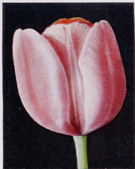
Clara Butt (Darwin)

MIXED DARWIN TULIPS. Every hue and shade from white through the deepest purples is represented. Where no special color scheme is being followed, this mixture will be pleasing and furnish the widest possible range of colors as well as a succession of bloom over a long period. Plant in groups of 12 or more or in large beds for best effects. 3 bulbs, 35c; 6 for 60c; 12 for $1.05; 25 for $1.85; 100 for $6.75.