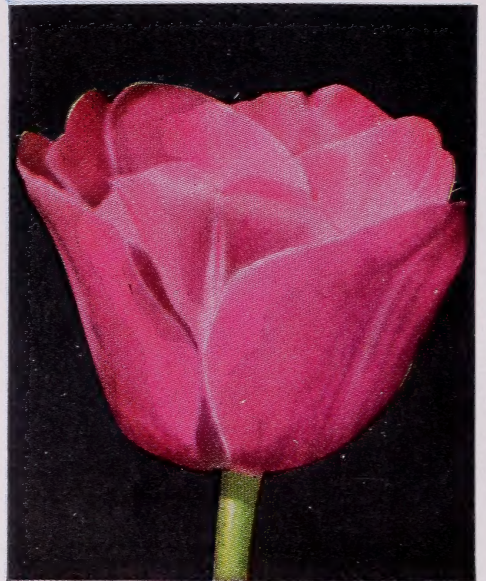
King George V (Darwin)

CLARA BUTT. This is the world's most popular Tulip, and has been for many years. The color, a beautiful soft salmon-rose, supported by an unflinching plant of vigorous habit has made Clara Butt sought after the world over. Flowers are uniformly large; texture superb; stems tall. 3 bulbs, 35c; 6 for 60c; 12 for $1.05; 25 for $1.90; 100 for $6.75.