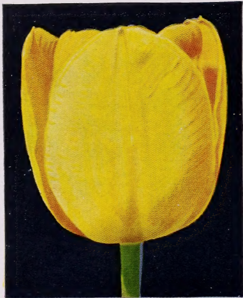
Golden Harvest (Darwin)