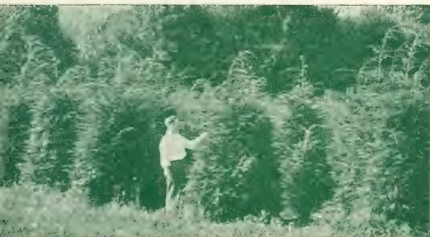
A few of our larger Canadian Hemlocks.