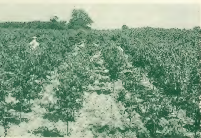
Pink Flowering Dogwoods. We have over 5000 See Next Page for Prices.