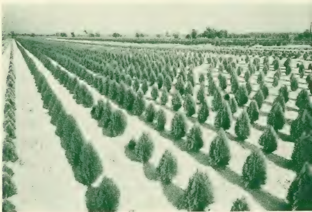
Biota or. Aurea Nana —as we grow them

CEDRUS atlantica glauca (Blue Atlas Cedar). 60 to 70 ft. Wide spreading silver-blue pyramids, slow growing. A very beautiful Evergreen.