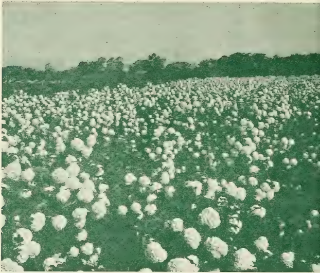
Viburnum Opulus Sterilis as we grow them