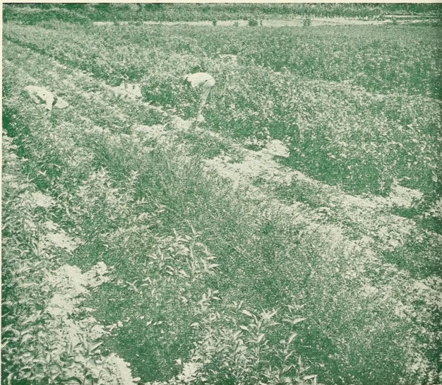
Some of our Hardy Shrubs