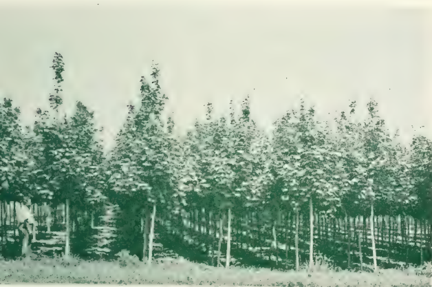
One of our many blocks of Norway Maples. Splendid trees. Offered on Next Page.