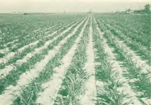
We grow acres of Berberis Thunbergi