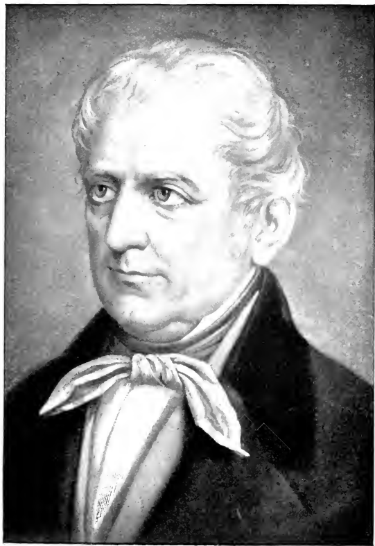
JAMES FENIMORE COOPER.