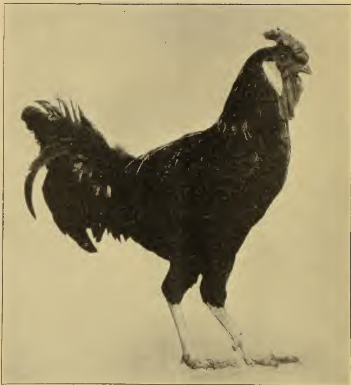
FIG. 13.—Rose Comb Black Minorca, male.

The comb of the single-comb varieties is unusually large. In the male it is erect and has six evenly and deeply serrated points. The blade of the comb has a tendency to follow the neck. In the female also the comb is large and six-pointed and is lopped. The front of the comb, instead of being straight as in the case of the comb of the Leghorn female, folds to one side and then the remainder of the comb droops to the other side of the head. The comb of the male