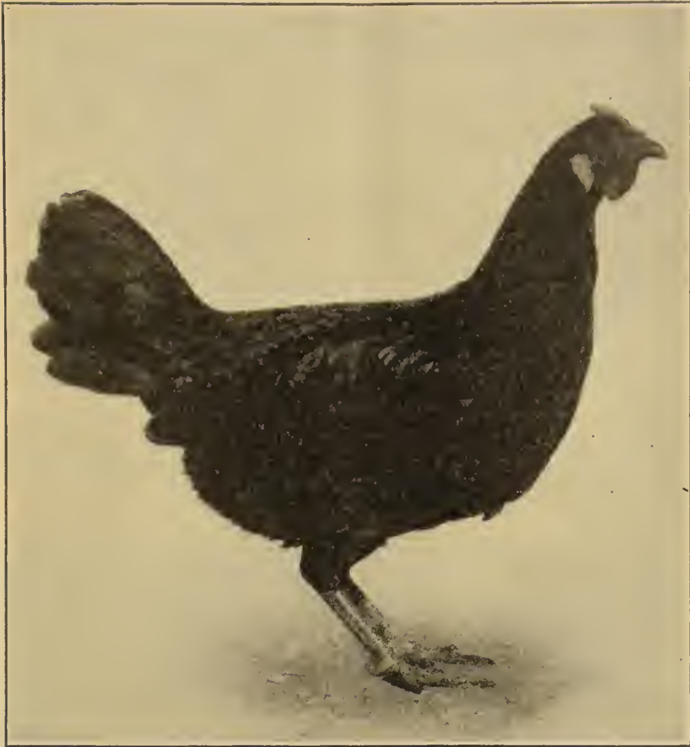
FIG. 14.—Rose Comb Black Minorca, female.

of the rose-comb varieties is fairly large, square in front, and terminating in a well-defined spike which has a tendency to follow the neck. The rose comb of the female is practically the same as that of the male in shape, but, of course, is smaller, although rather large for a female.