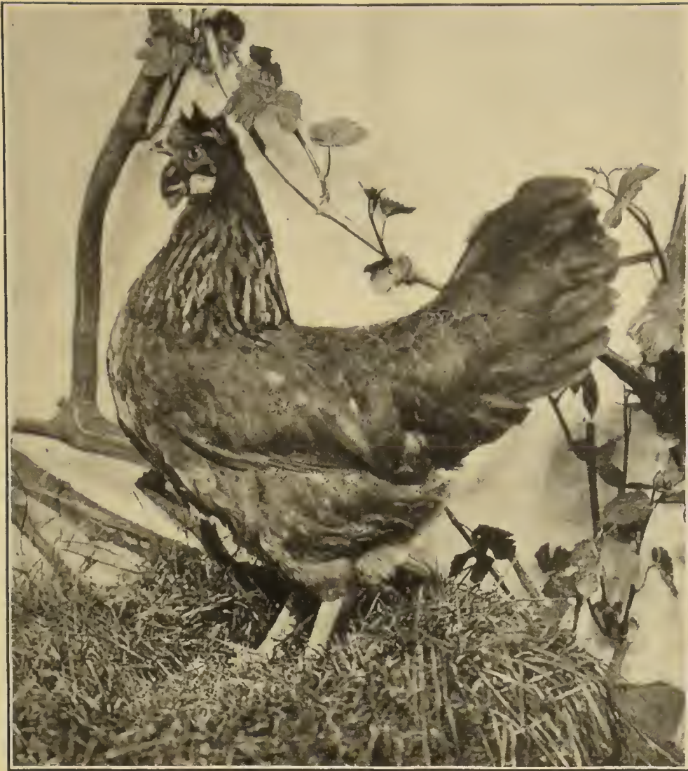
FIG. 3.—Single Comb Brown Leghorn, female.

large area and pick up a considerable amount of feed. Fowls of these breeds do not have the same tendency to become overfat as fowls of larger breeds, and though they respond to careful feeding they are not so quick to feel the bad effects of overfeeding. Because of their smaller size they do not eat as much as fowls of the larger breeds.