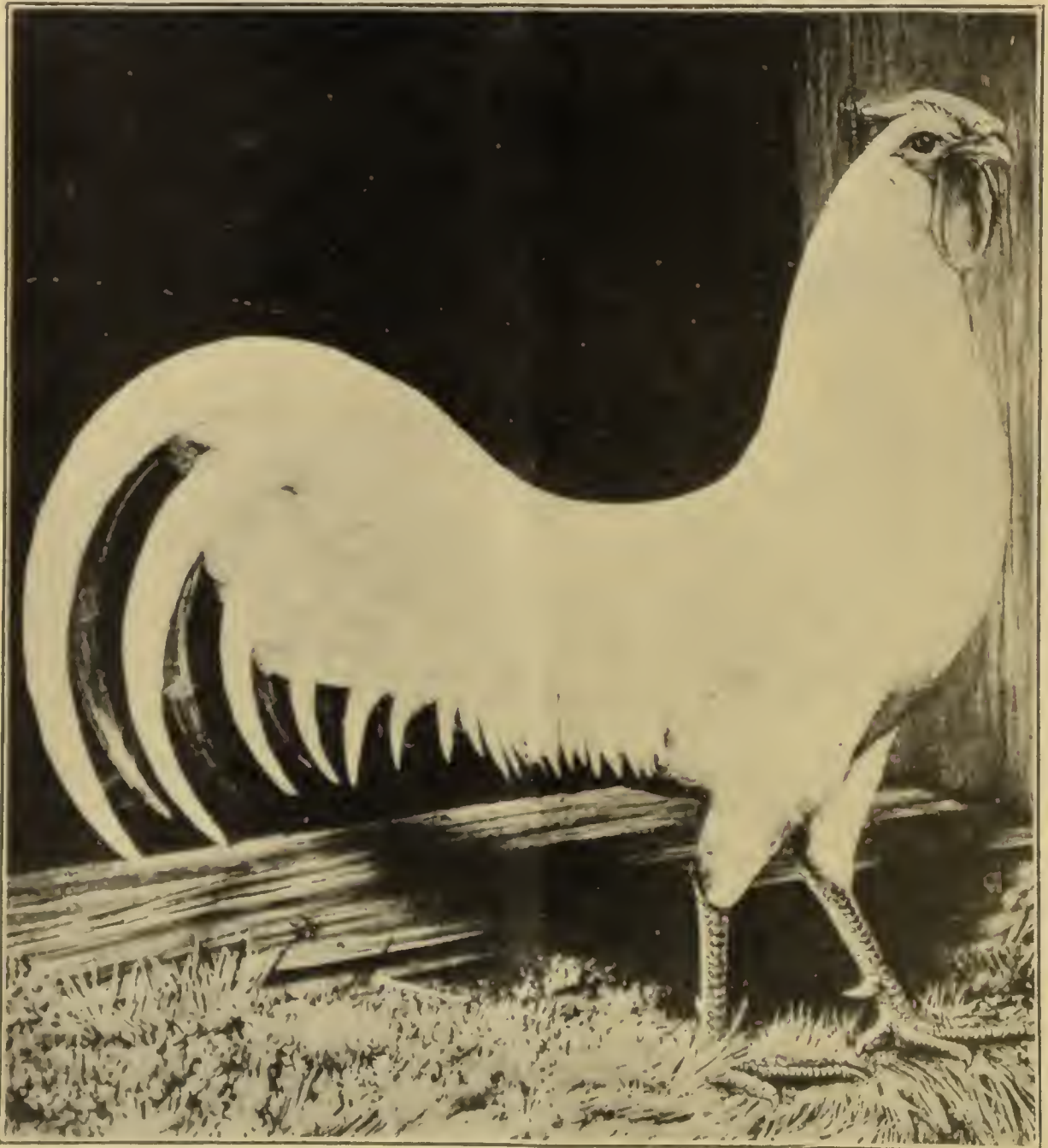
FIG. 5. Rose Comb White Leghorn, male.

In color the female has a golden yellow head which shows a tinge of dark brown. The hackle is golden yellow with a black stripe extending down the middle of each feather as in the male, except that the stripe is broader and terminates in a rounder point. It is difficult to obtain females showing good hackles and at the same time good stippling, as the best-stippled females are likely to be weak in striping. The back, body, tail coverts, wing bows, and coverts have a surface color of light brown, which is finely stippled with darker brown. The shade of color over the back, wing bows and coverts should be even and the feather free from shafting. The wing primaries are a slaty brown, with the outer webs showing a narrow