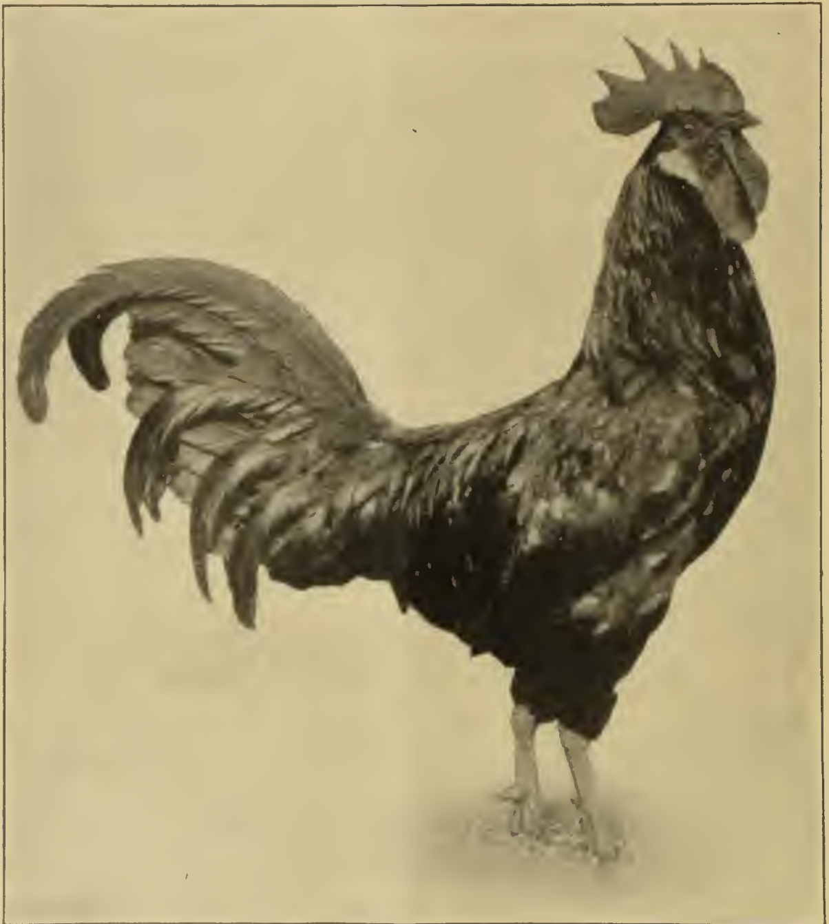
FIG. 2.—Single Comb Brown Leghorn, male.

Chickens of the egg breeds, because of their greater activity, are fine foragers, and when they have free range they will cover a very