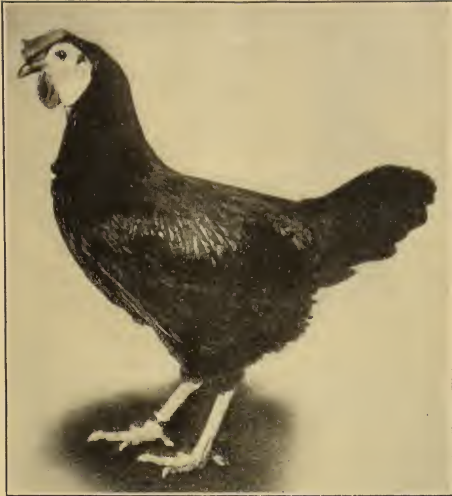
FIG. 16.—White-faced Black Spanish, female.

The Single Comb Buff Minorca is identical with the Single Comb White Minorca in type and size, being distinguished only by its color. This should be an even, rich, golden buff throughout, being identical with that of the Buff Leghorn. The legs and toes are white or pinkish white.