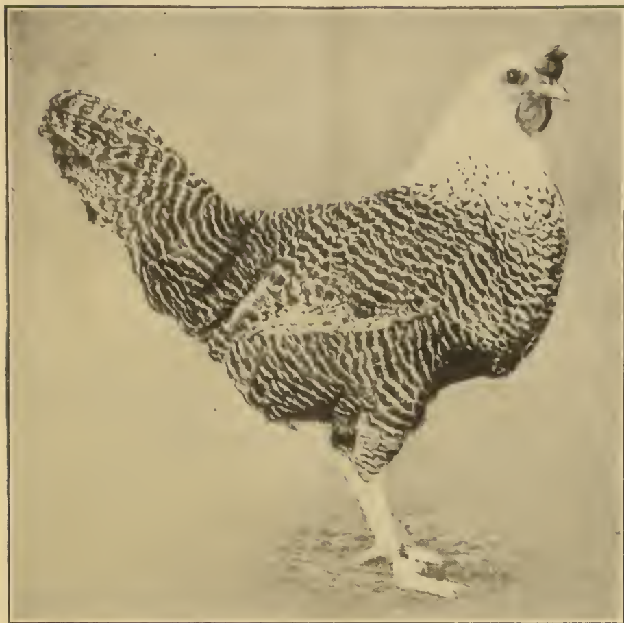
FIG. 22.—Silver Campine, female.

In the Silver Campine (figs. 21 and 22) both the male and the female have white heads and hackles. The rest of the plumage is a greenish black, each feather barred with distinct white bars, the black bars being wider than the white by about four times. The white bars do not extend straight across the feather, but have a slight tendency to be V-shaped at the quill. The undercolor is slate throughout. The legs and toes are leaden blue and the skin white in color.