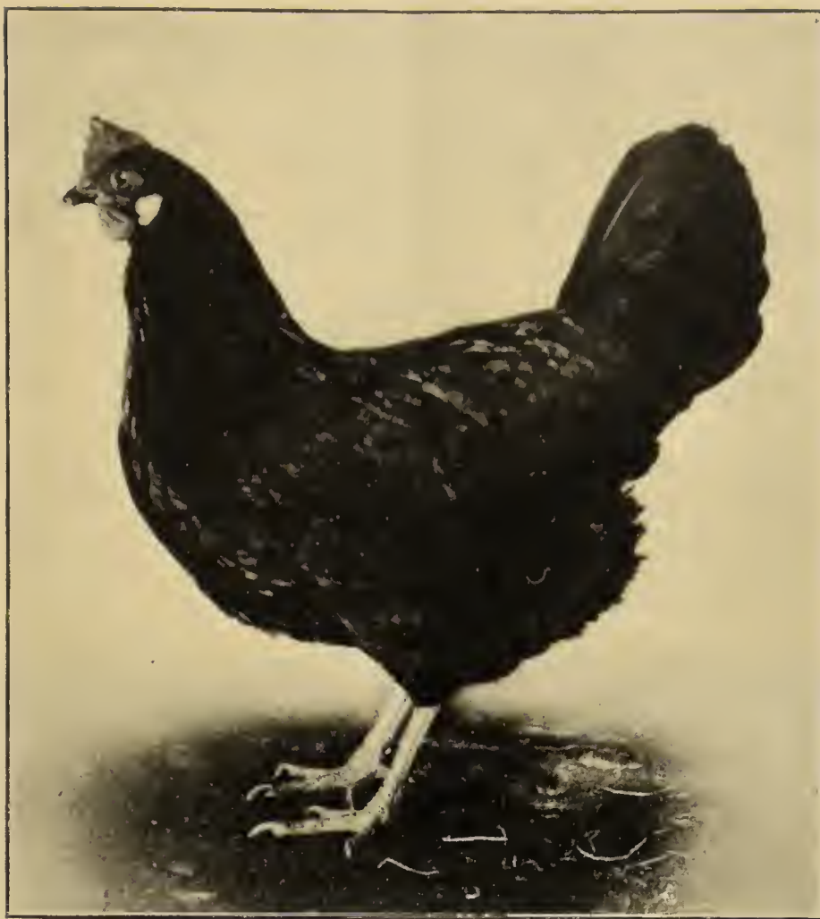
FIG. 8.—Black Leghorn, female.

dle should approach light orange in shade; the saddle should show no striping, and the undercolor throughout should be light slate instead of dark slate. A thin comb, even if a little large, is not bad, as it tends to produce good combs on the females. This mating is known as the pullet mating, because it produces a larger percentage of females of exhibition color, while the males produced are too light for exhibition, but may be used to continue this line of breeding.