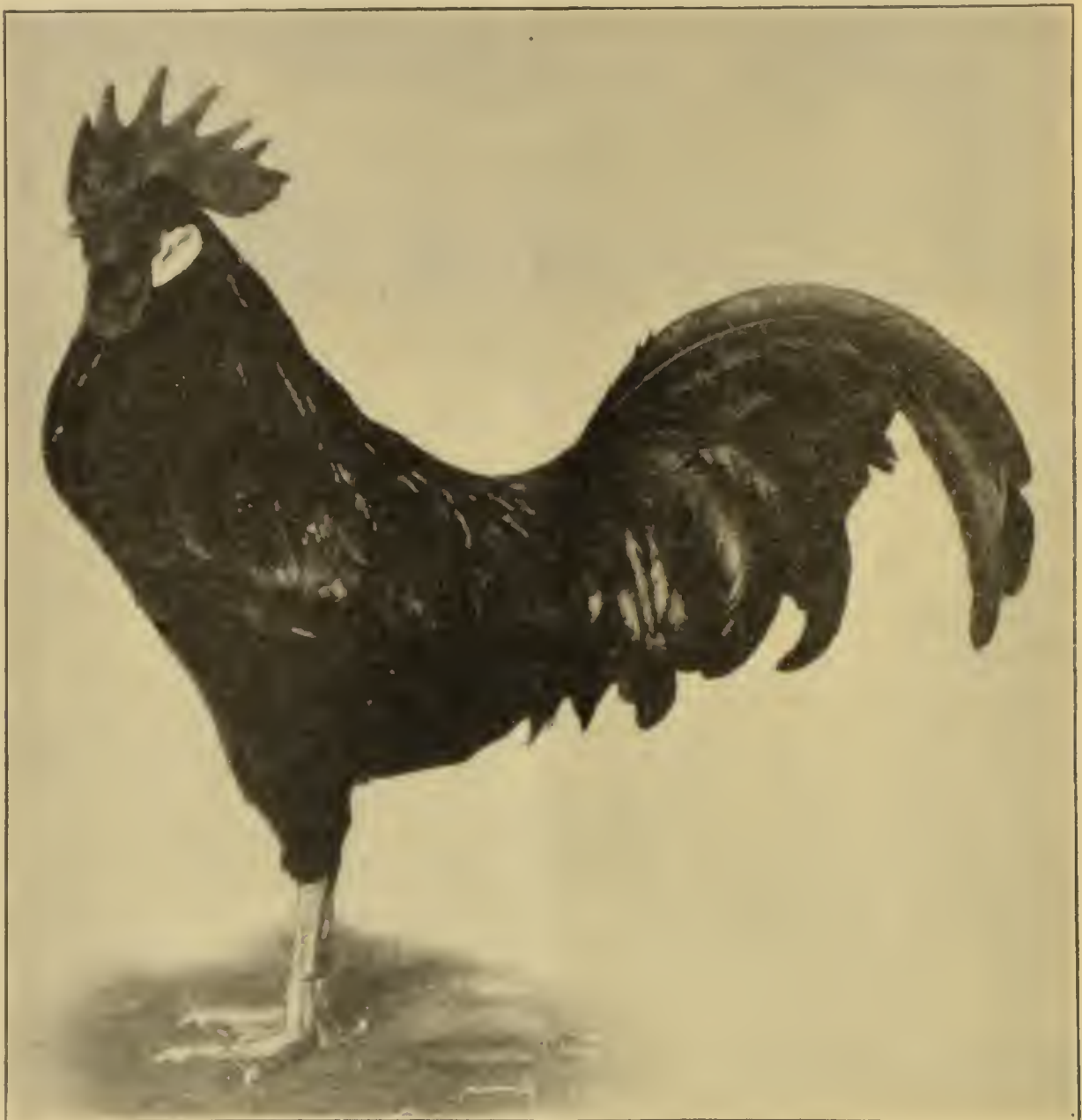
FIG. 7.—Black Leghorn, male.

In mating for females of exhibition color, females should be selected which are as near the standard description as possible. Mate with these a male which should be out of a female of fine quality. These males are invariably considerably lighter colored in all red sections than the exhibition male. The base of the neck and the sad-