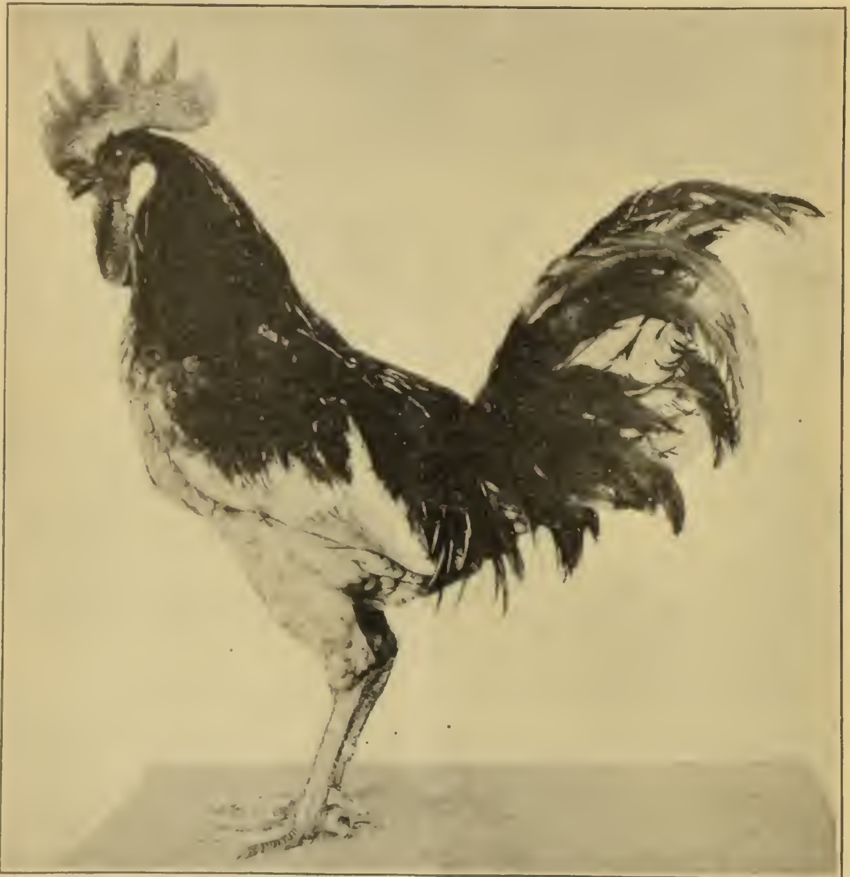
FIG. 17.—Blue Andalusian, male.

This is a single-comb breed, and in the male the comb is somewhat larger than in the Leghorn and the blade has a slight tendency to