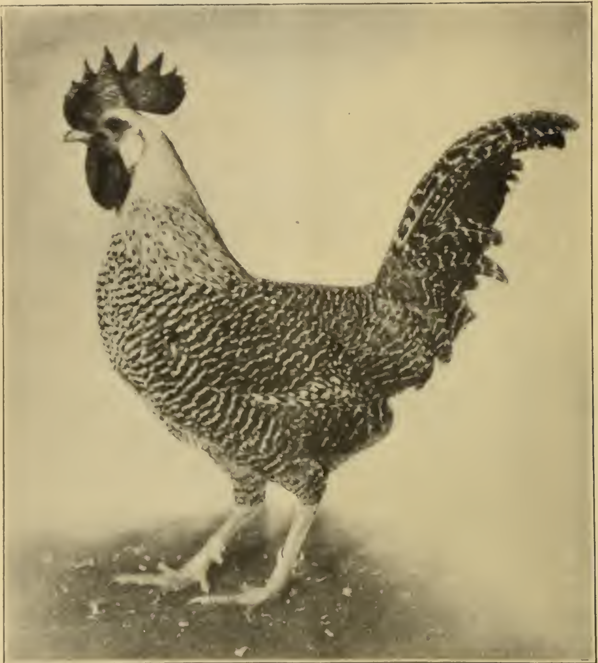
FIG. 21.—Silver Campine, male.

In its general characteristics the Campine is very much like the Leghorn. It is a comparatively small breed, very alert and active, and of a nervous temperament. These fowls should be rather deep and long bodied and should be well rounded. The Campine female has, if anything, a longer back than the Leghorn female. Both varieties of Campines are single combed, the shape of the comb being the same as that of the Leghorn in both sexes. The standard weights are: Cocker, 6 pounds; hen, 4 pounds; cockerel, 5 pounds; pullet, 3½ pounds.