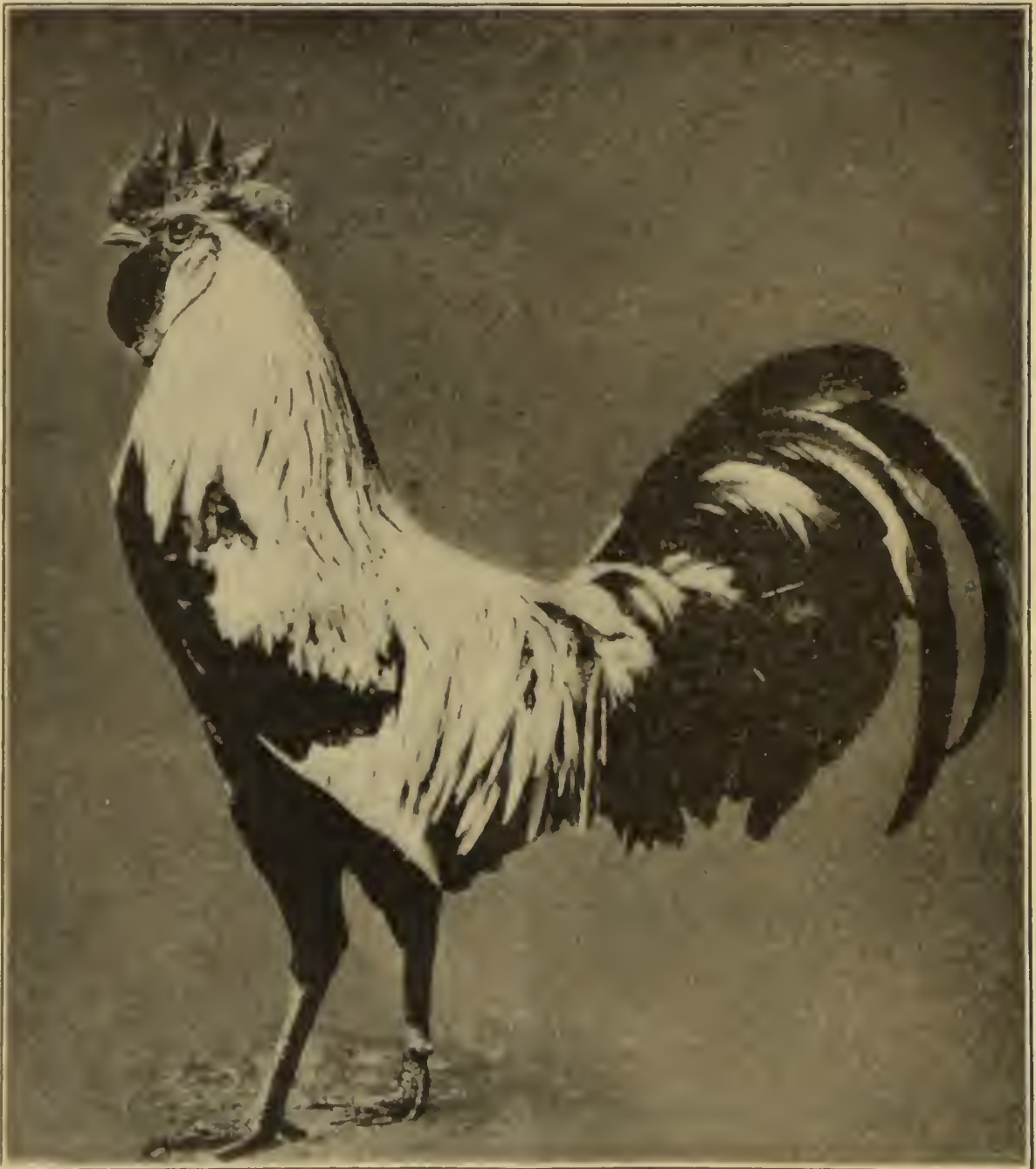
FIG. 9.—Silver Leghorn, male.

The Single Comb Buff Leghorn is a handsome and attractive variety, but is not so widely kept as either the Single Comb White or the Single Comb Brown Leghorn. The Single Comb Buff Leghorn is distinguished from the other Leghorns by the color alone. This should be an even shade of golden buff throughout. Shafting, or the presence of feathers having a shaft of different color from the rest of the feathers, and mealiness, or the presence of feathers sprinkled with lighter color as though powdered with meal, are undesirable. As deep an undercolor of buff as it is possible to obtain is desired. A very important point with regard to the surface color