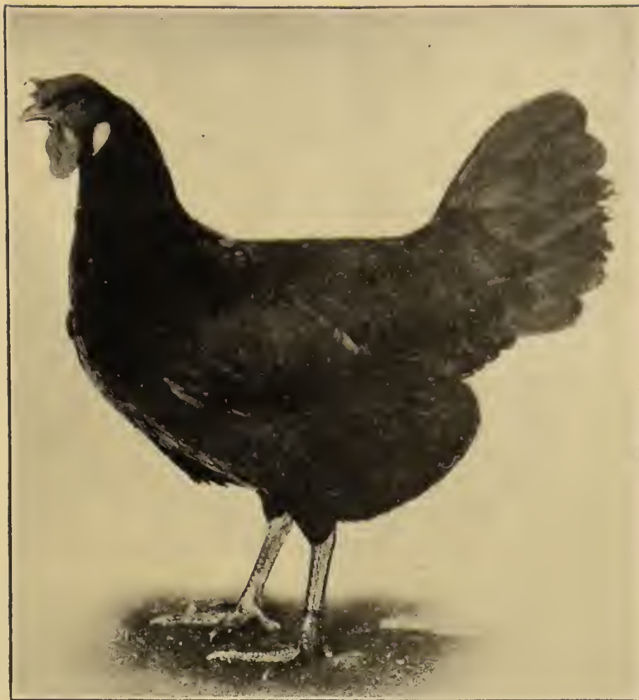
FIG. 12.—Single Comb Black Minorca, female.

The Red Pyle Leghorn also is a single-comb variety and is not very commonly found. In type this variety is identical with the other Single Comb Leghorns. The male is white with a red and orange top color. The head should show a bright orange, the hackle a light orange which may show some tinge of brighter yellow, the wing bows red, part of the outer web of the secondaries red, back red, and saddle light orange. The outer webs of the lower feathers of the primaries are bay. All other sections are white, and the under-color is white throughout. In the female the color including under-color is white throughout except for the head, which is golden, the hackle or neck feathers, which are white edged with gold, the feathers in front of the neck, which are white with a salmon tinge, and the breast, which is salmon. The legs and toes of both sexes are yellow.