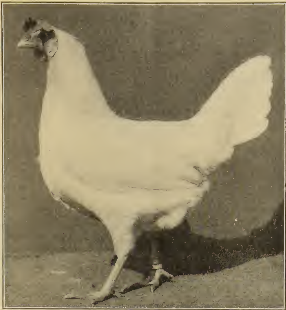
FIG. 4.—Single Comb White Leghorn, female.

the neck or incline upward. In the female the front and the first point should stand erect, but the remainder of the comb droops to one side. The comb in both sexes should be free from wrinkles, thumb marks, or folds. In the rose-comb varieties the comb of the male should be of medium size and square in front, well filled and free from hollows, the spike well developed and extending straight back off the head, showing no tendency to follow the curve of the neck or to turn upward. The rose comb of the female is small and neat, and in shape is like that of the male.