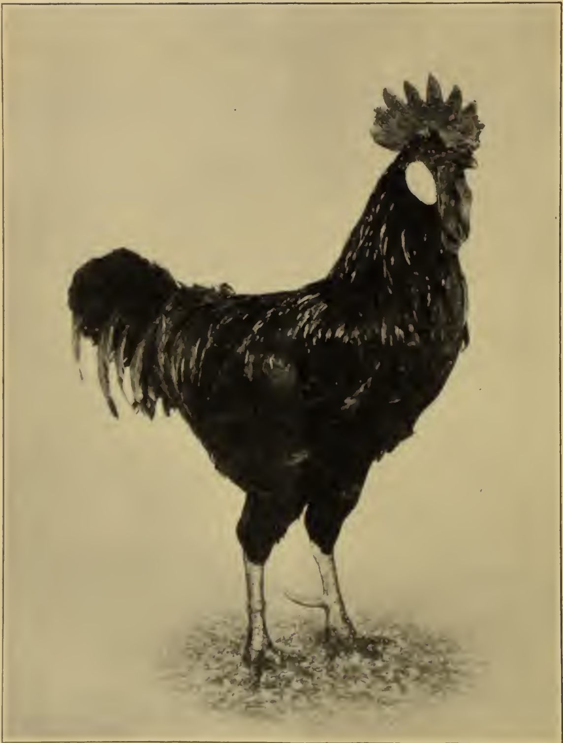
FIG. 11. — Single Comb Black Minorca, male.

and fluff are black. The undercolor is gray throughout. In the female the head is a silver gray. The neck is a silver gray, each feather showing a narrow black stripe. The wing bows and coverts are silver white, finely stippled with ashy gray, giving these sections a general gray cast. In the primary and secondary feathers the upper webs are gray and the lower webs a slaty gray. The front of the neck is a light salmon, and the breast is salmon, fading gradually to the color of the wings at the sides. The back, body, and thighs are the same color as the wing bows and coverts. The tail is black except that the upper two feathers are light gray and the tail coverts are gray. The fluff is a light ashy gray. The undercolor is gray throughout. The legs and toes of both sexes are yellow.