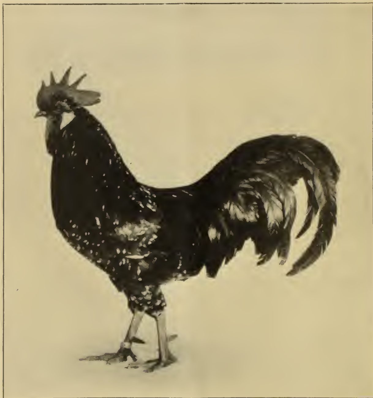
FIG. 19.—Single Comb Ancona, male.

In type this breed is very similar to the Leghorn. In general it seems to have about the same utility qualities as the Leghorn, but has never gained the popularity which the Leghorn enjoys. In size the Ancona and the Leghorn are the same, except that the standard weight for the Ancona hen is one-half pound greater. The standard weights are: Cock, 5\frac{1}{2} pounds; hen, 4\frac{1}{2} pounds; cockerel, 4\frac{1}{2} pounds. pullet, 3\frac{1}{2} pounds.