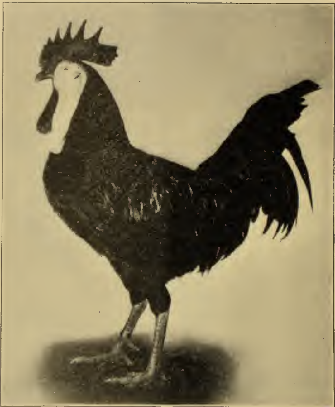
FIG. 15. — White-faced Black Spanish, male.

The Rose Comb White Minorca is distinguished from the Single Comb White Minorca by the comb alone. In all other respects it is identical.