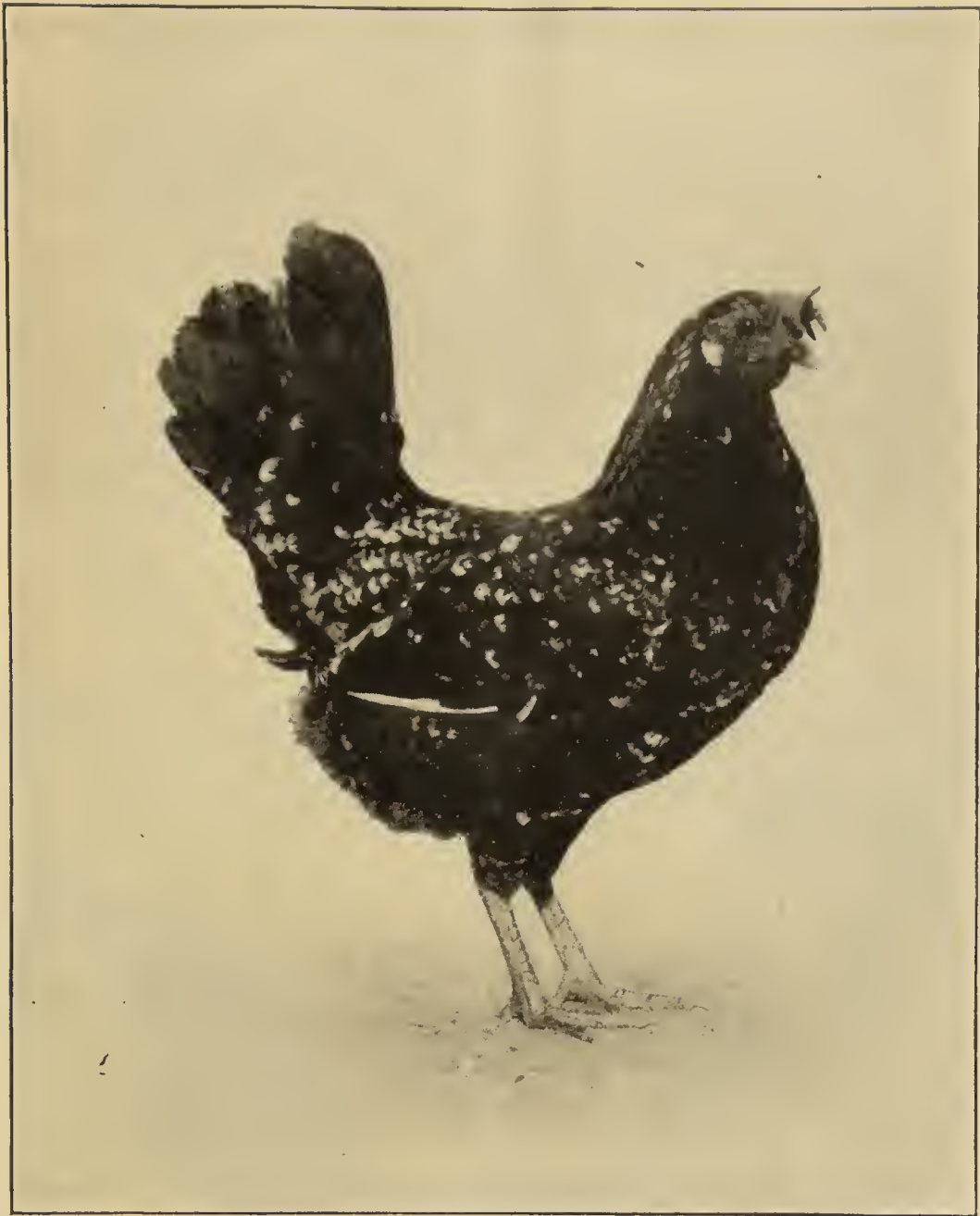
FIG. 20.—Single Comb Ancona, female.

The Ancona has a general body color of lustrous black with certain of the feathers throughout the plumage tipped with a V-shaped white tip. The proportion of feathers carrying such a white tip is one in five. The black top color of the male has a greenish sheen which is absent in the female. The main tail feathers and sickles of the male and the main tail feathers of the female are each tipped with white. The primary and secondary wing feathers also carry white tips. The undercolor is dark slate throughout. The legs and toes are yellow or yellow mottled with black, and the skin is yellow.