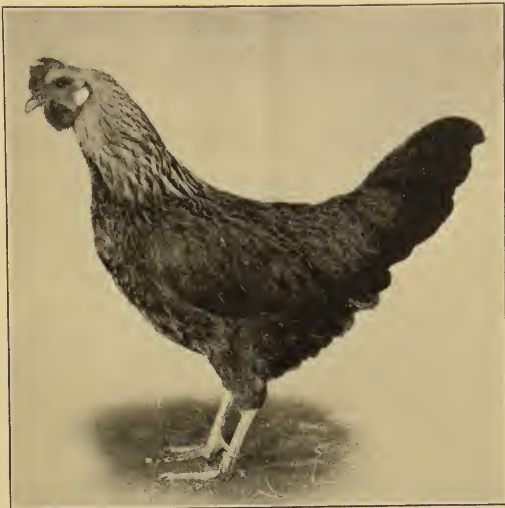
FIG. 10.—Silver Leghorn, female.

is to have the shade as even as possible throughout. The legs and toes are a rich yellow.