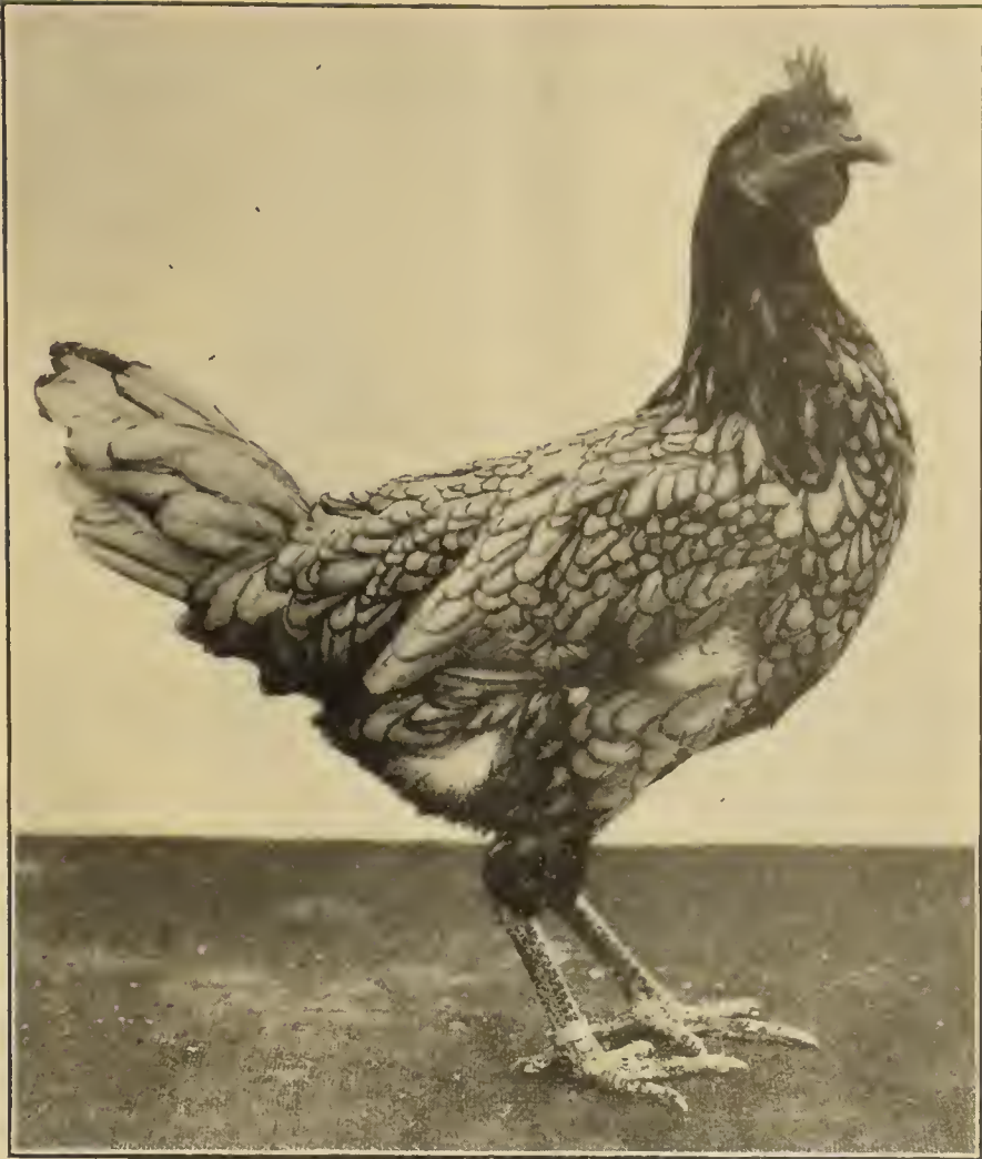
FIG. 18.—Blue Andalusian, female.

follow the neck. The comb of the female is practically identical with that of the Leghorn female. The male has a general top color of dark lustrous blue, approaching black, which extends over the hackle, back, saddle, shoulders, sickle feathers, and tail coverts. The rest of the plumage is a slaty blue which shows in most sections a well-defined lacing of darker blue. In the female the general plumage color is a slaty blue of even shade, each feather having a clear, well-defined, narrow lacing of darker blue. The neck has a decidedly darker cast of plumage than the rest of the body. The undercolor of both sexes is a slaty blue throughout. The legs and toes are leaden blue and the skin is white in color.