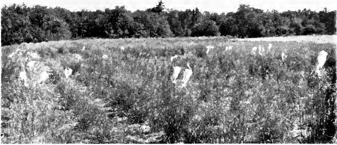
Figure 3. The bromegrass breeding nursery at Dover, July, 1956. Some of the plants have been covered with bags in order to obtain self-pollinated seed.