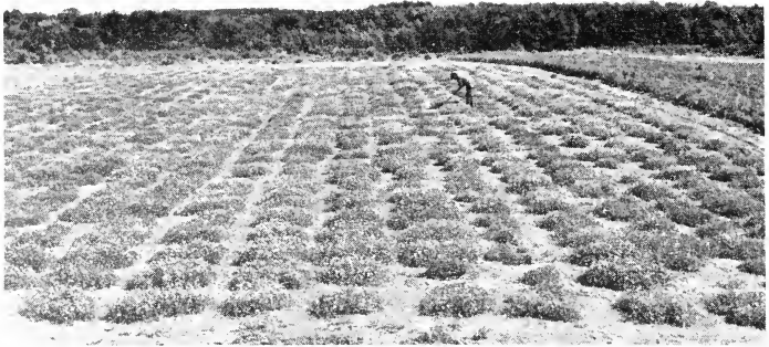
Figure 5. This is the Ladino clover breeding nursery at Dover, August, 1954.

in the West, largely due to the fact that farmer demand for the variety has been small. If the recommended variety is unavailable, certified seed is still strongly recommended over non-certified seed for all forage crops.