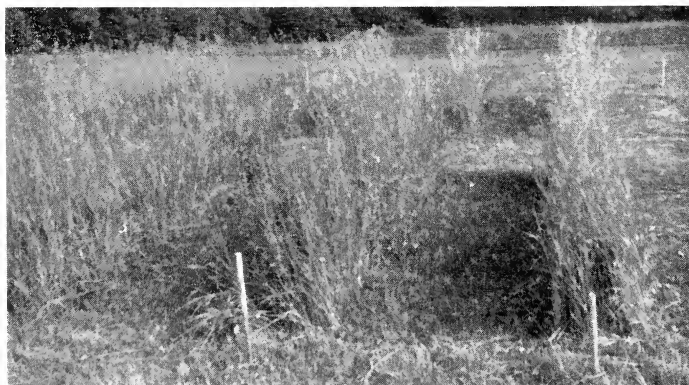
Figure 2. First harvest of the bromegrass trial at Colebrook in June, 1955.

Fischer was highest in yield for the 4-year period. The strain from Oklahoma and the two northern types was significantly lower in yield in 1953, but Canadian commercial and Parkland produced good yields after 1953.