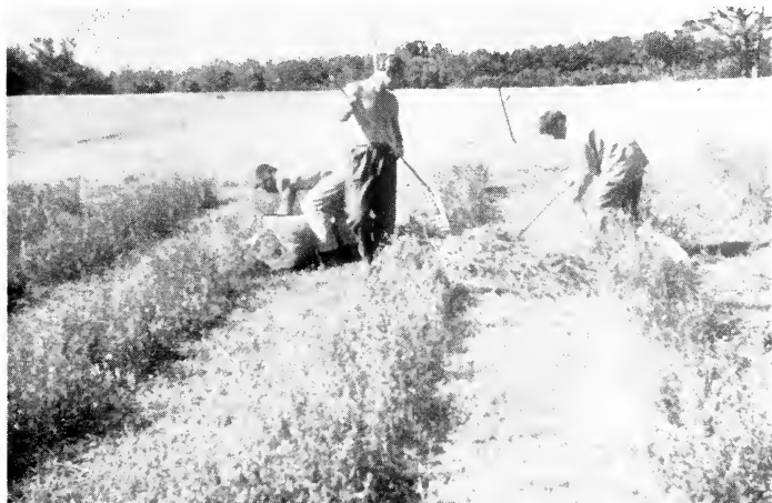
Figure 1. The second harvest of the alfalfa trial at Greenland, August, 1955.

As previously mentioned, five plots were seeded to bromegrass alone, and an additional set of five plots to a bromegrass-alfalfa mixture. Yields of these plots were not included in the analysis since the chief purpose of