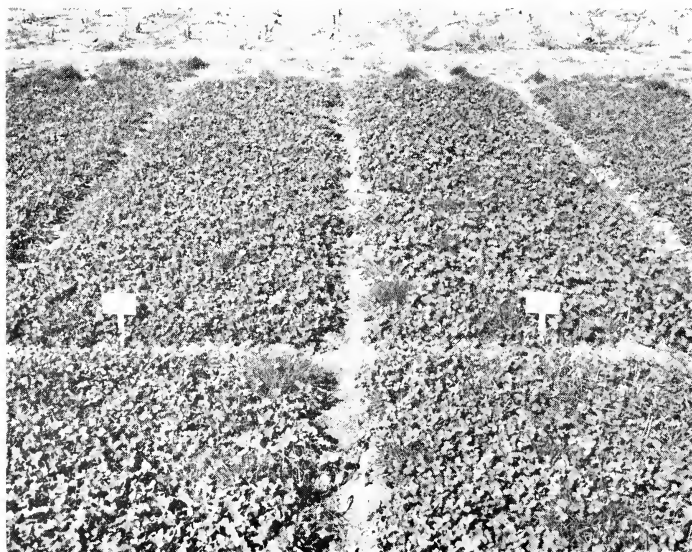
Figure 4. Ladino clover plots at Dover, October, 1955. The leaflets on the Vermont polyploid type at right are larger than those on the Pilgrim variety.

Results for the second Ladino test are given in Table 8. These data were not analyzed statistically because a poor stand was obtained on a few of the plots. Some of the seed lots were grown in southern and northern areas of the west. It was thought that seed grown in northern areas of the west might be higher yielding in the Northeast. Definite conclusions cannot be obtained from this test because of the variability in stand. Most of the lots were not widely different, and Pilgrim yielded about as well as any other seed source. The yield of the polyploid strain was lower than most of the Ladino types. This strain is a giant type of Ladino with very large stolons, petioles, and leaves. However, in both field and greenhouse tests, it produces a relatively small number of stolons, and consequently somewhat sparse growth in solid seedlings. Figure 4 shows a plot of Pilgrim in comparison with polyploid Ladino clover.