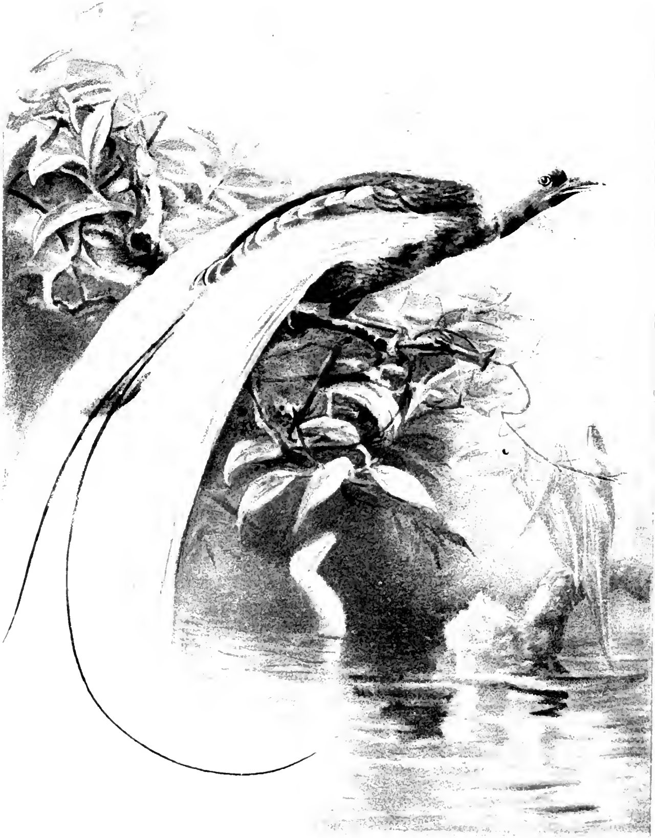
FROM ARCHÆOPTERYX TO BIRD OF PARADISE