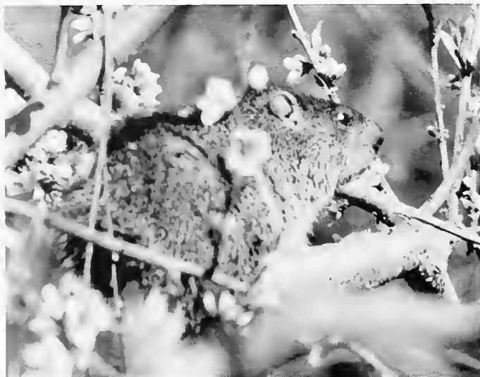
FIGURE 4—Although primarily found on or under the ground, woodchucks will climb trees, often using them as sunning posts. This woodchuck is eight feet above the ground in a peach tree.

Woodchucks as agricultural pests The woodchuck is a ground-dwelling member of the squirrel family which commonly inhabits orchards in Connecticut. Three of their activities may present problems for orchardists: burrows and associated mounds of excavated soil can be hazardous to machinery; burrows at the base of trees may cause excessive aeration of roots and upheaval of the tree; and gnawing and clawing of fruit trees can severely damage or even kill young trees. Gnawing damage usually occurs on the main stem of trees located close to burrows and can be distinguished from vole gnawing by the larger size of the incisor marks (1/8 to 3/8 inch wide). Woodchucks also climb trees