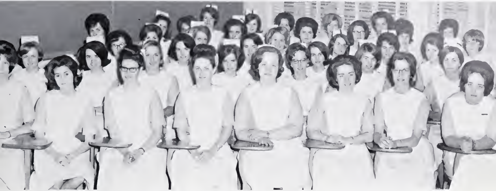
Student Government Glee Club