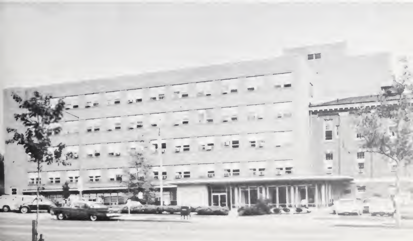
This is Children's Hospital in Washington, D.C., where we affiliated for pediatrics.