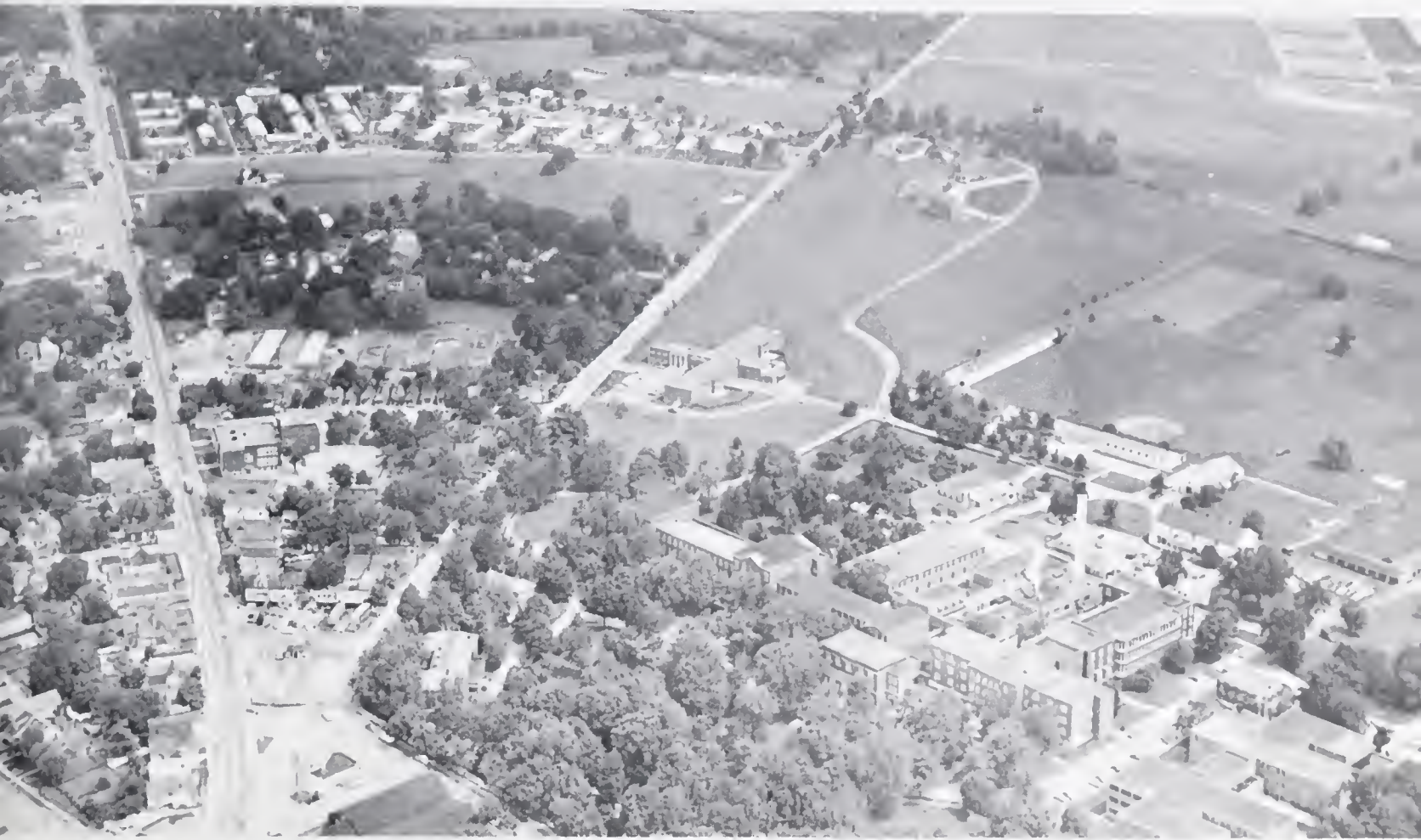
Everyone enjoyed affiliating in Lexington, Kentucky, at Eastern State Hospital for psychiatry.