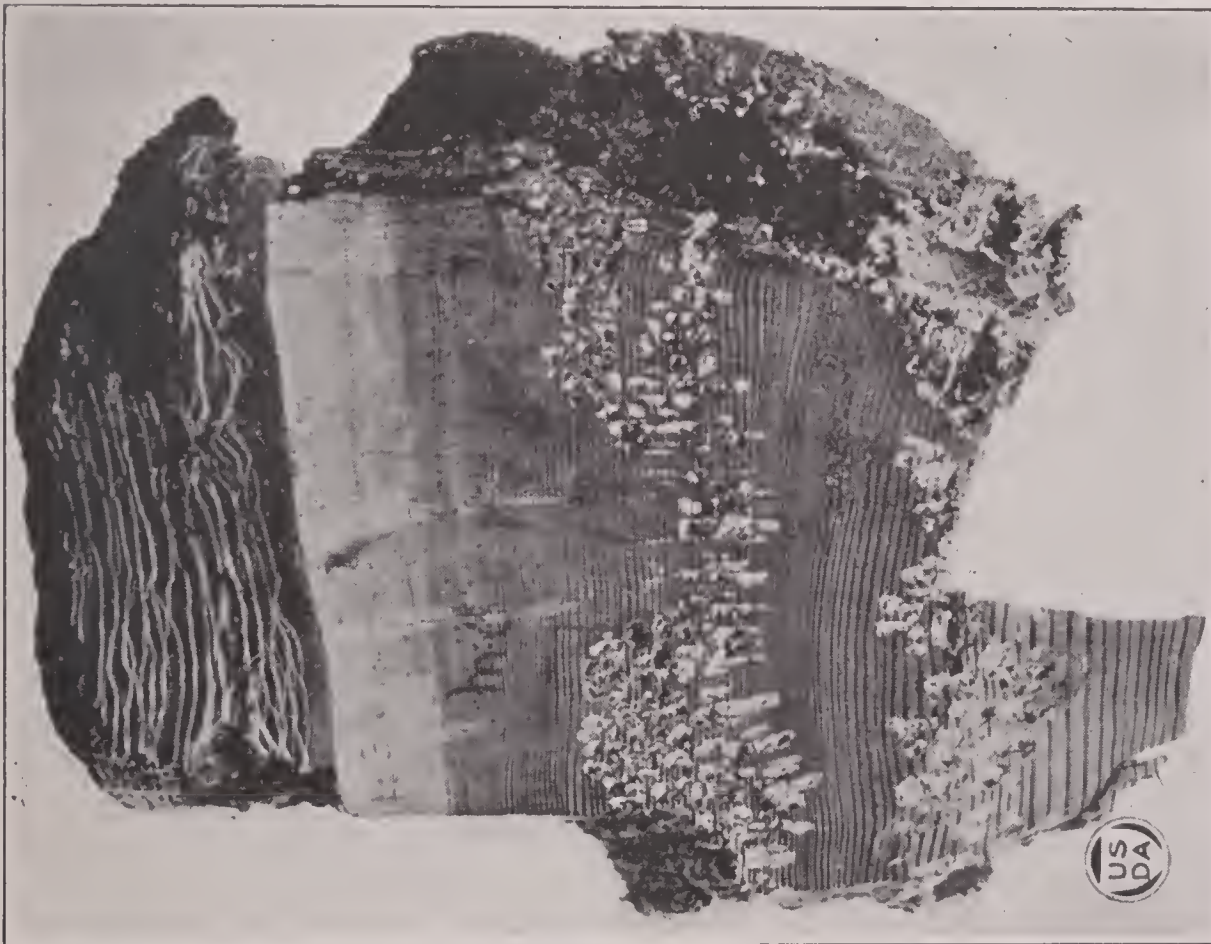
FIG. 1.—CONK-ROT CAUSED BY RING-SCALE FUNGUS.

This shows the upper surface of a sporophore of the rose-colored fomes and the yellow-brown rot caused by this fungus.