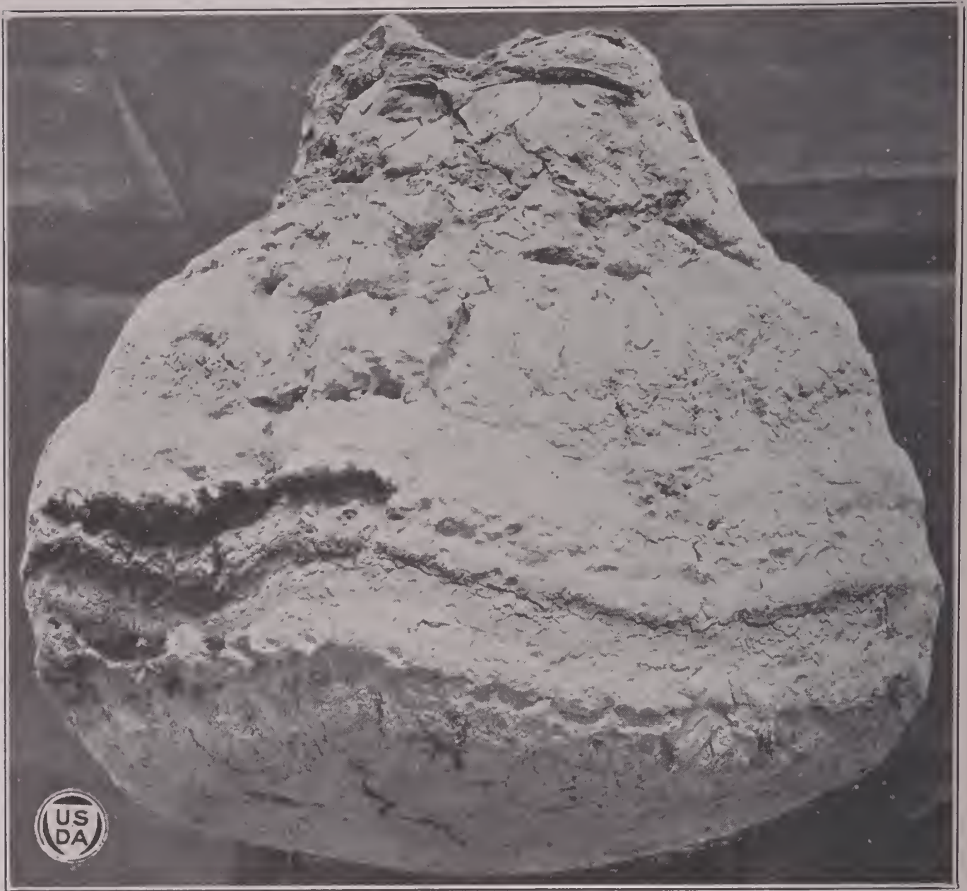
FIG. 1.—SPOROPHORE OF THE QUININE FUNGUS.

These conspicuous whitish fruiting bodies are not common on living trees, but are found more often on dead down timber. The sporophore has a very bitter taste.