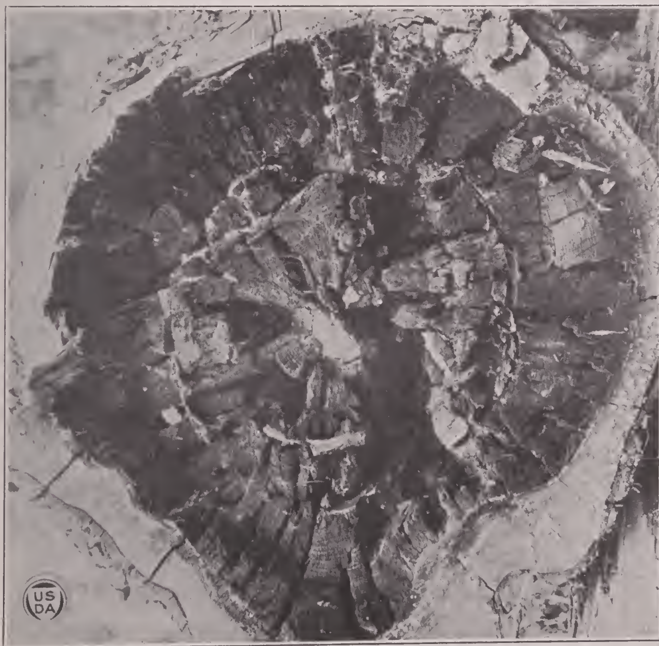
FIG. 2.—RED-BROWN BUTT-ROT CAUSED BY THE VELVET-TOP FUNGUS.

These sporophores indicate red-brown butt-rot in the tree.