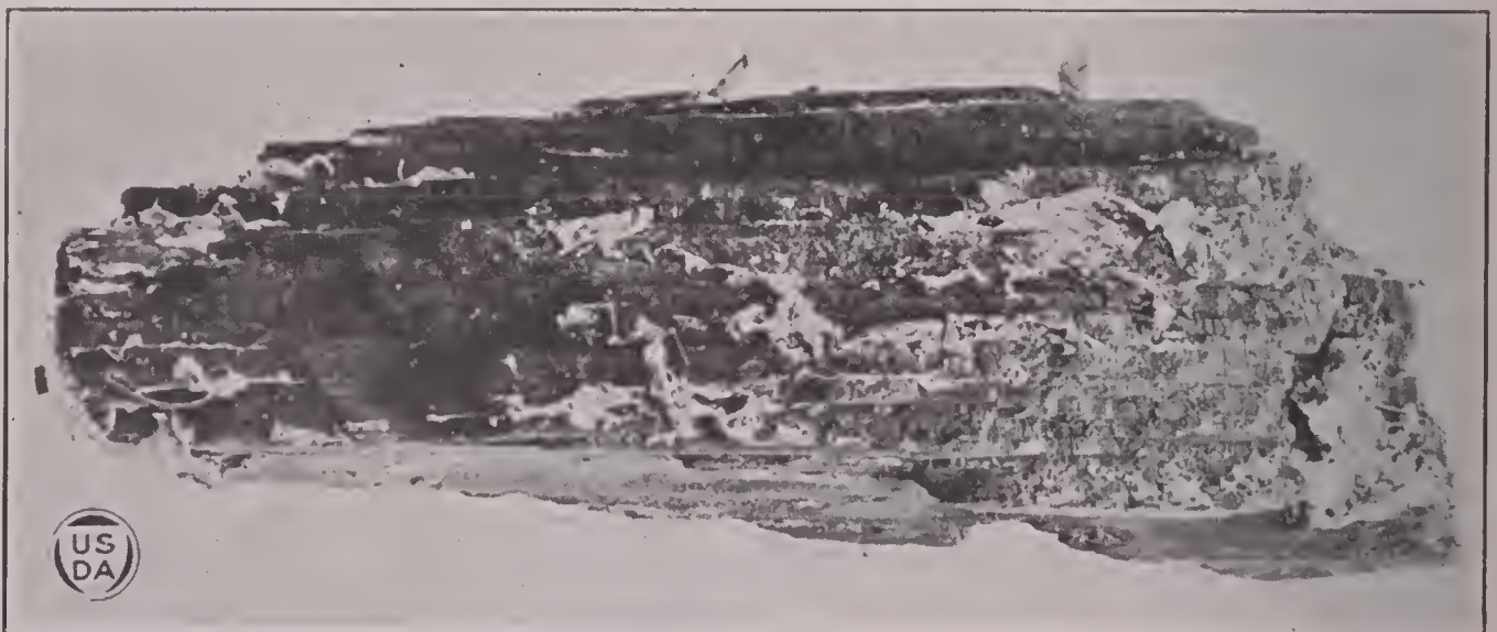
FIG. 2.—BROWN TRUNK-ROT CAUSED BY THE QUININE FUNGUS.

These conspicuous whitish fruiting bodies are not common on living trees, but are found more often on dead down timber. The sporophore has a very bitter taste.