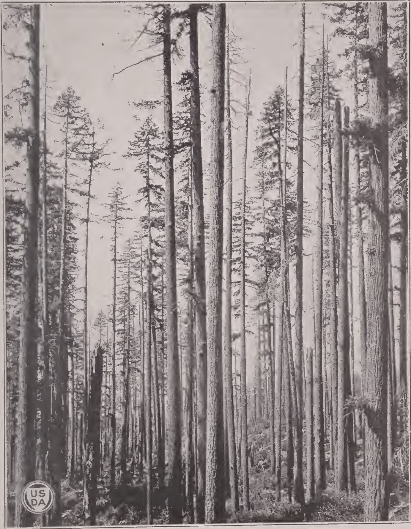
DEFECTIVE DOUGLAS FIRS LEFT STANDING AFTER LOGGING. The principal defect is decay caused by the ring-scale fungus.