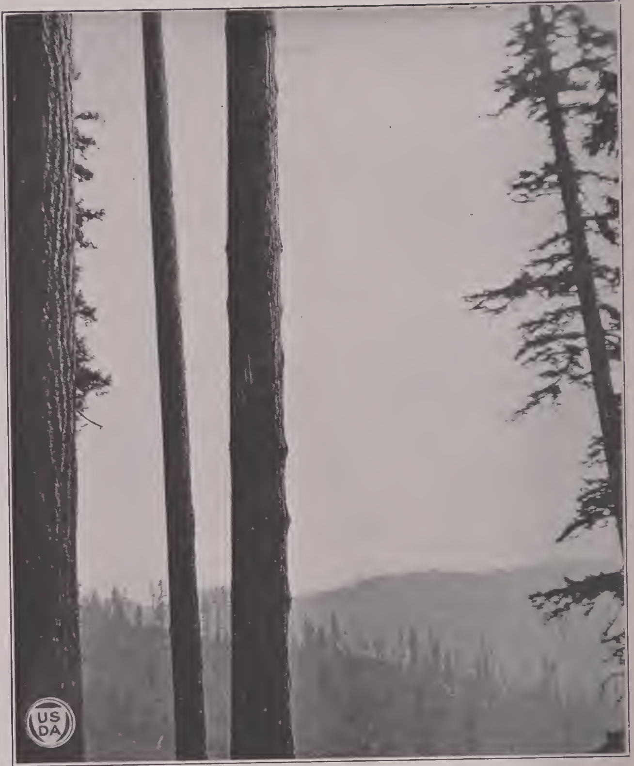
SWOLLEN KNOTS OR BLIND CONKS ON DOUGLAS FIR. These indicate conk-rot in the tree. Compare with Plate VII.