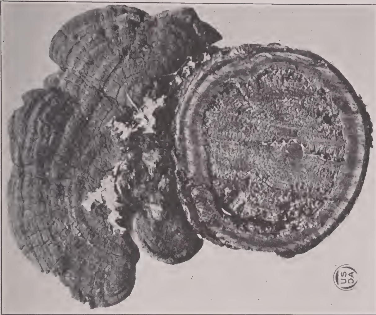
FIG. 2.—CROSS SECTION OF A DOUGLAS FIR TOP.

This shows the upper surface of a sporophore of the rose-colored fomes and the yellow-brown rot caused by this fungus.