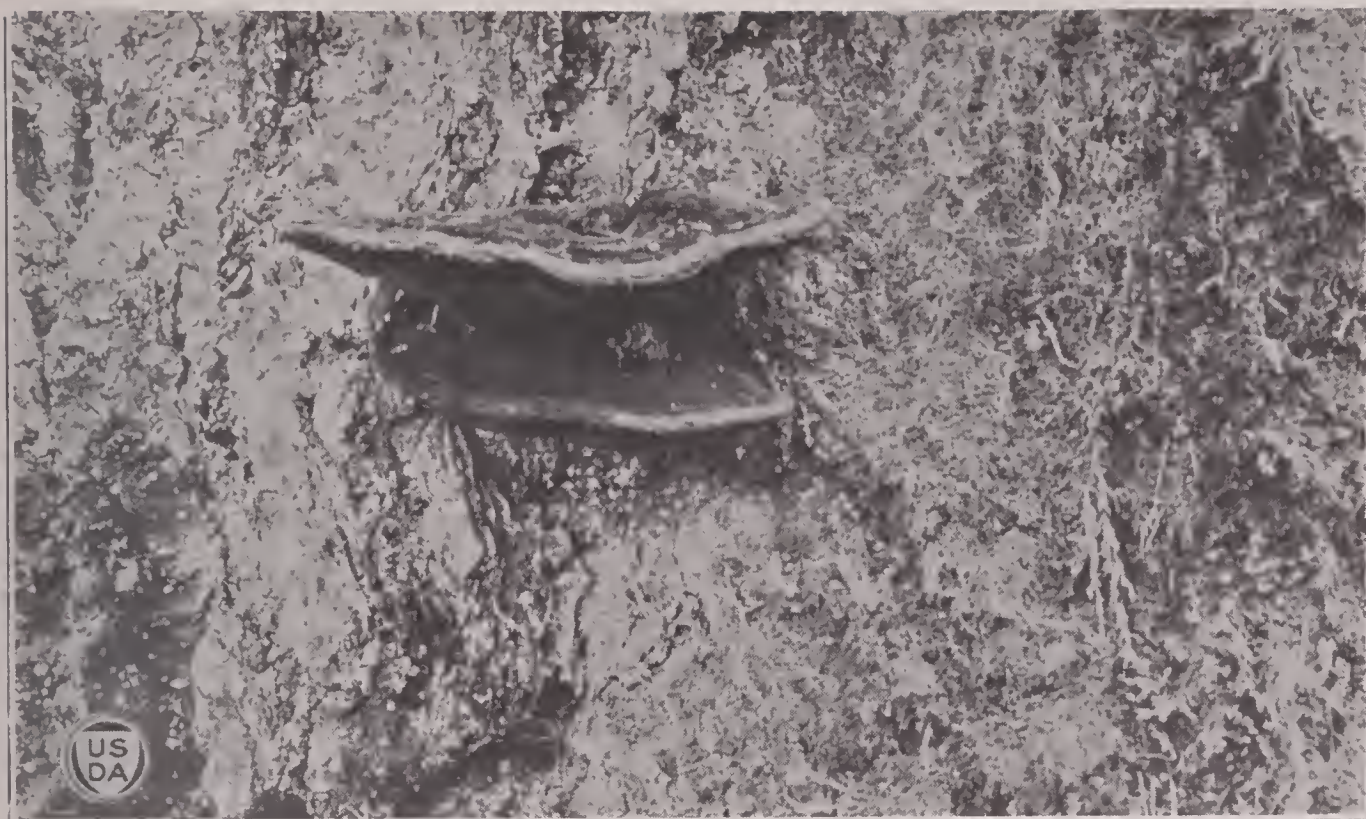
FIG. 1.—SPOROPHORES OF THE VELVET-TOP FUNGUS ON THE BUTT OF A LIVING DOUGLAS FIR.

These sporophores indicate red-brown butt-rot in the tree.