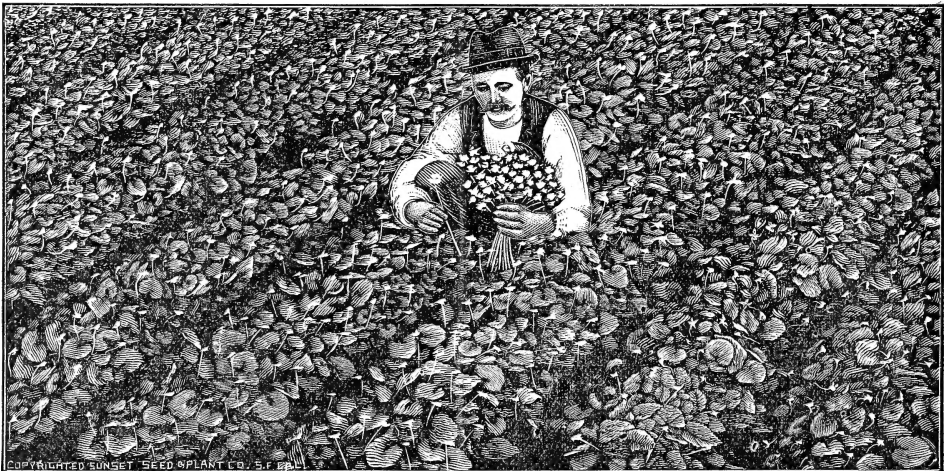
GATHERING BLOOMS OF "THE CALIFORNIA,"

PRICES, One, 20 Cents; Six, 85 Cents; Dozen, $1.50; Hundred, $7.50.