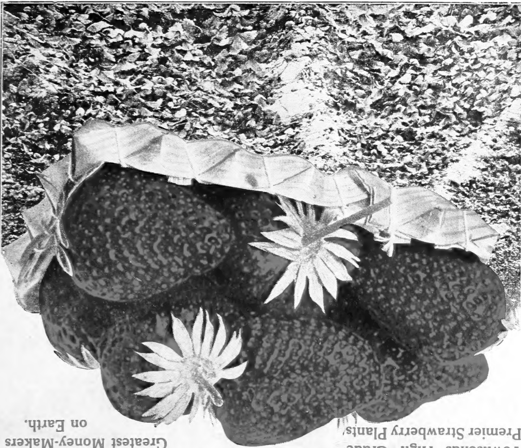
Greatest Money-Makers on Earth.