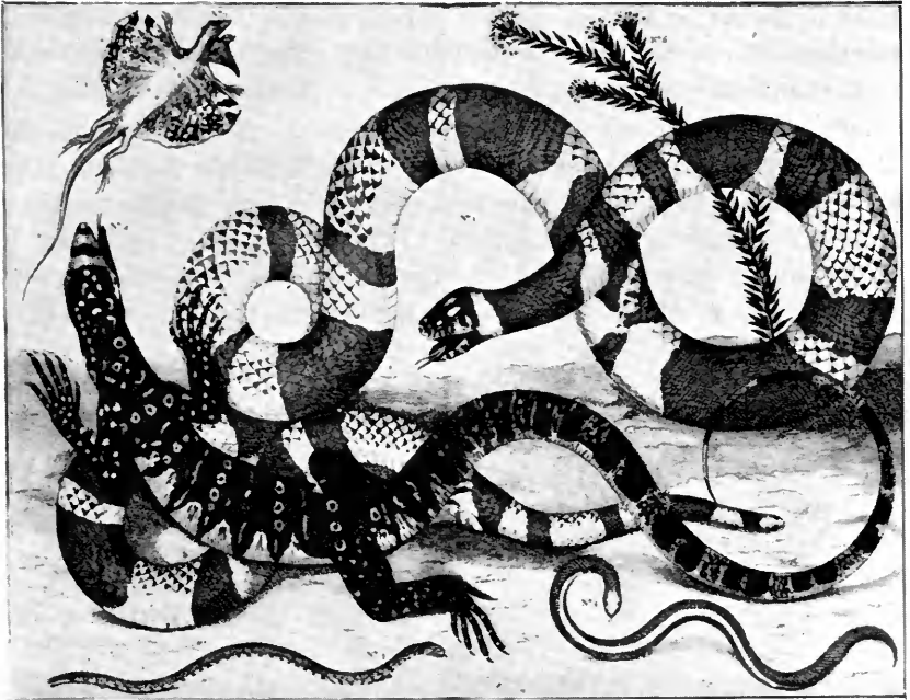
FIG. 5. Illustration from Seba ( Locupletissimi . . . , vol. 2, pl. 86), on which Cuvier based the description of Elaps Surinamensis .

The significant data for these specimens are as follows: