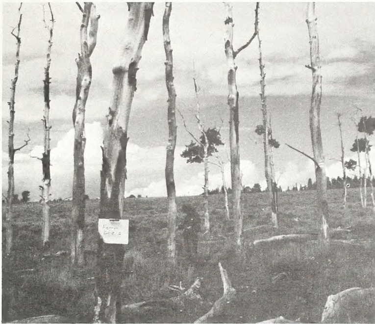
Figure 4.—Isolated aspen stand treated with herbicide with no regeneration of aspen because of heavy grazing by deer and cattle.

(less than 1 acre [0.4 ha]), isolated, and grazed heavily by livestock or big game (fig. 4).