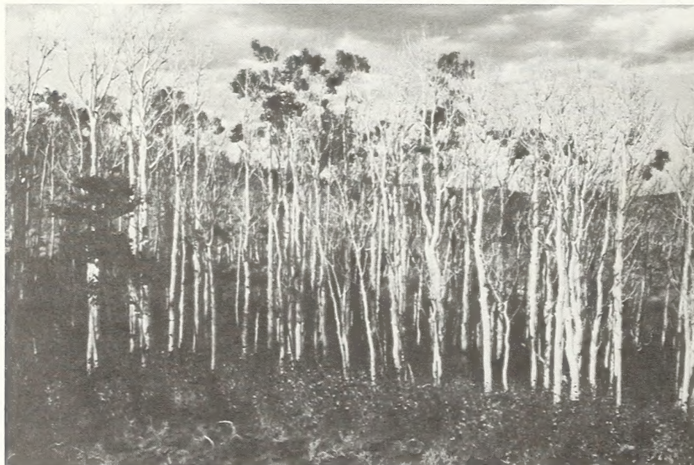
Figure 3.—Abundant regeneration of aspen 3 years after herbicide spraying.