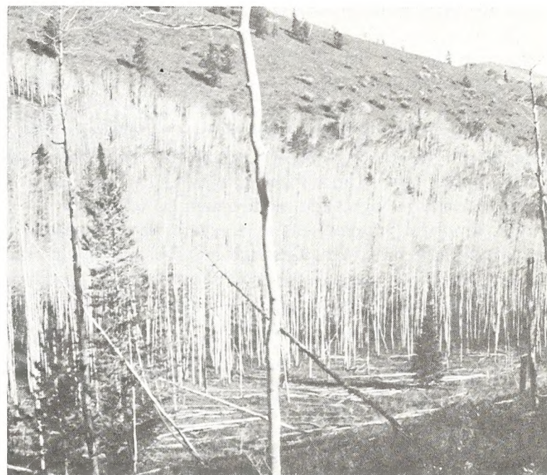
Figure 1.—Herbicide sprayed stand of aspen in southeastern Idaho after 1 year.

We decided to evaluate aspen stands that were accidentally or purposefully treated with herbicides by comparing the overstory and understory of treated and adjacent untreated stands throughout the Intermountain and Rocky Mountain area.