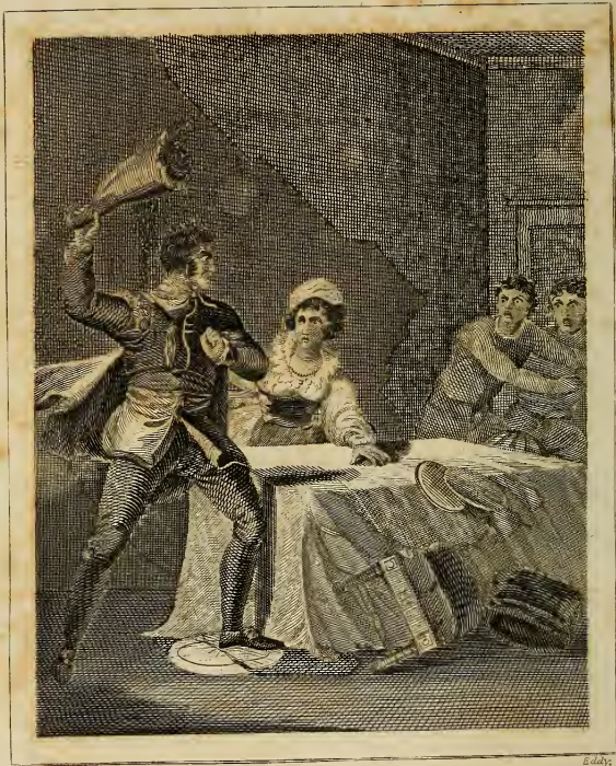
TAMING THE SHREW.