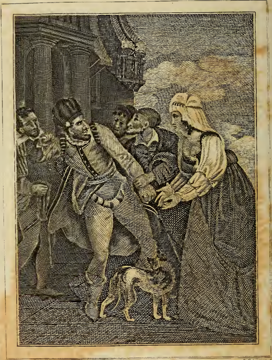
COMEDY OF ERRORS.