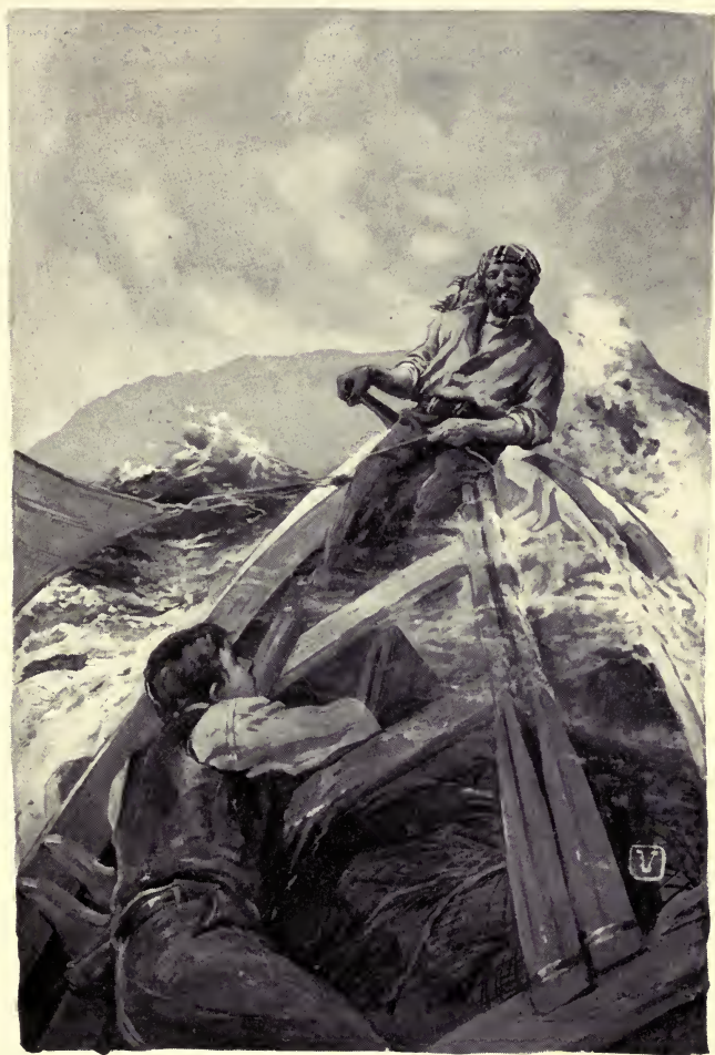
“There, in the stern, sat Demetrios Contos.”