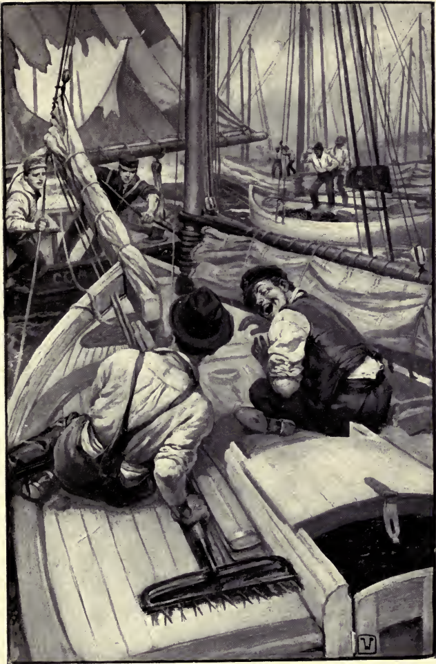
“The Centipede and the Porpoise doubled up on the cabin in paroxysms of laughter.”