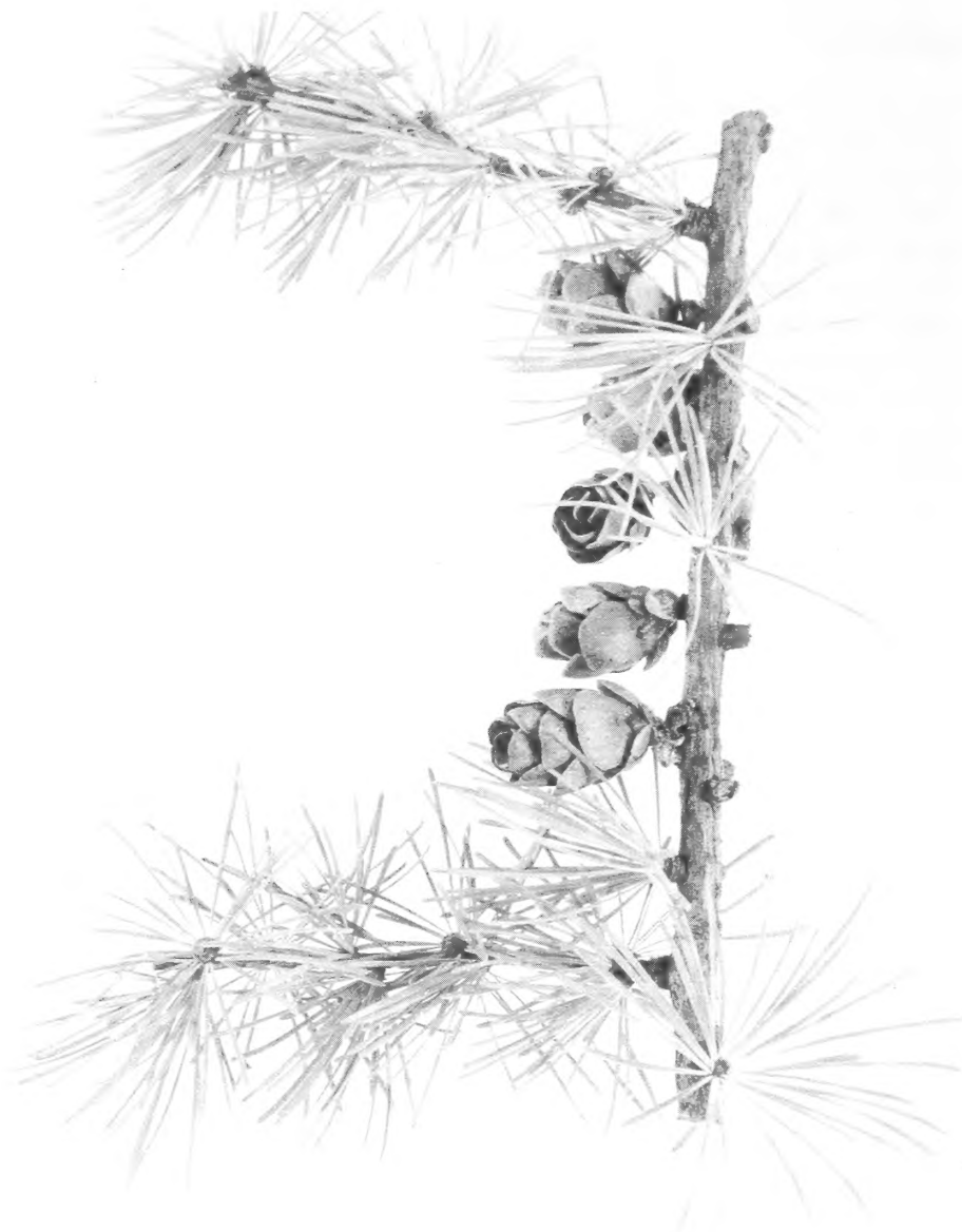
Figure 2—Clusters of tamarack needles.

cedar, and balsam fir. Tamarack forests may be reproduced by clearcutting mature stands in strips or by leaving well-spaced seed trees on harvest areas. However, satisfactory reestablishment will often require site preparation to improve seedbeds and control competing vegetation.