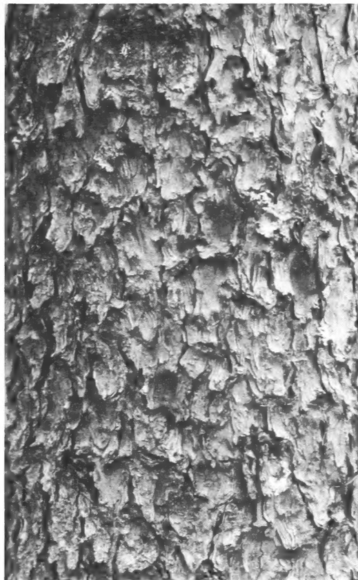
Figure 4—Bark of a mature tamarack.

Agents besides pests may also severely damage tamarack. Impeded drainage caused by road crossings and beaver damming often kills stands or reduces their growth. Tamarack is fairly wind-firm, but strong winds can uproot large trees growing on wet lowlands where rooting is shallow. And although lowlands are normally too wet to burn, almost any ground fire that does occur kills the tree because it has thin bark and shallow roots.