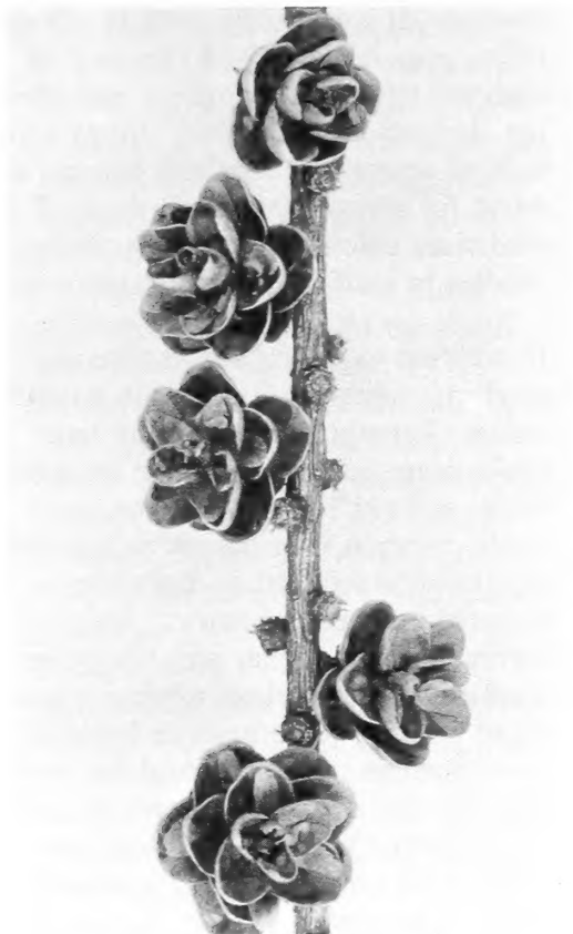
Figure 3—Cones and short shoots of tamarack.

outbreaks have been widespread and recurring, causing tremendous losses. Casebearer outbreaks have killed many trees in some areas. Other pests include the porcupine, which commonly deforms or kills tamarack trees by feeding on the inner bark, and the snowshoe hare, whose browsing sometimes kills many seedlings. Several rots and other diseases are reported on tamarack, but none has an economic impact on its culture.