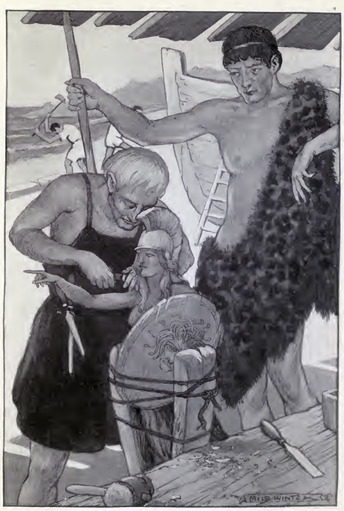
Jason was delighted with the oaken image, and gave the carver no rest until it was completed