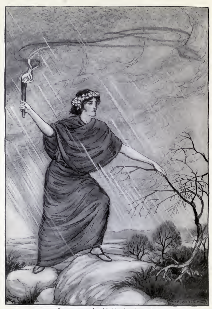
It never was extinguished by the rain or wind