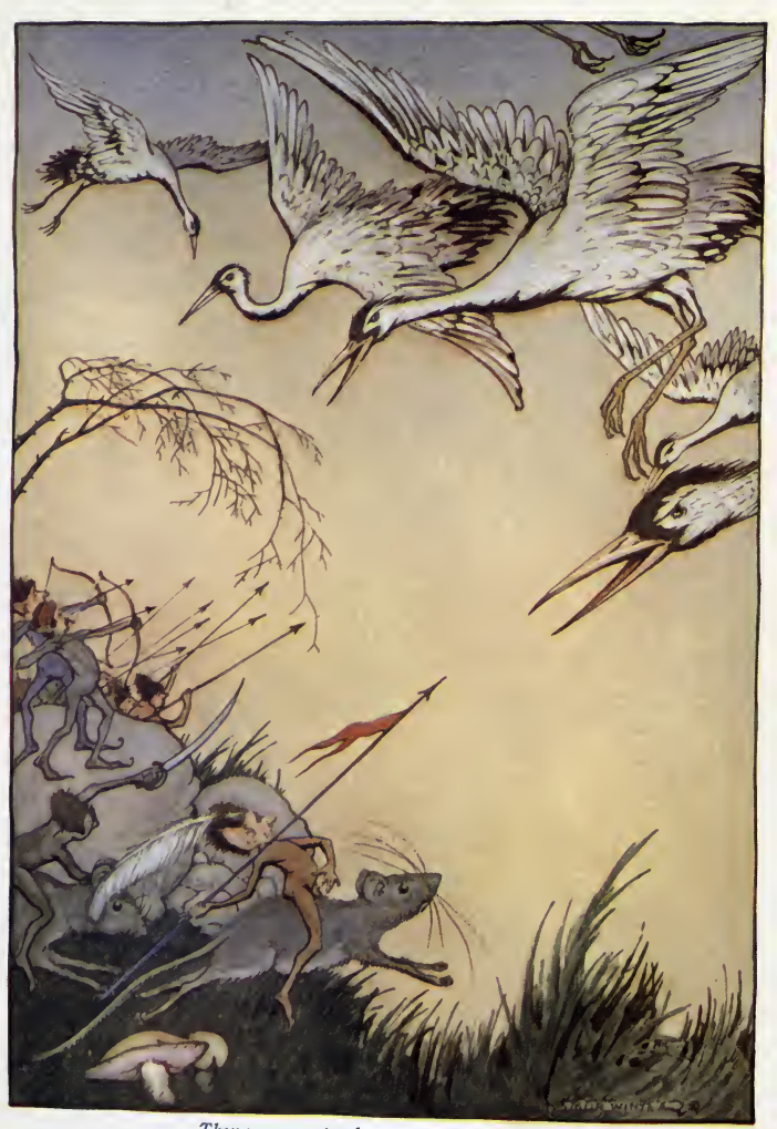
They were constantly at war with the cranes