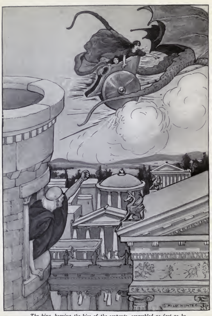
The king, hearing the hiss of the serpents, scrambled as fast as he could to the window