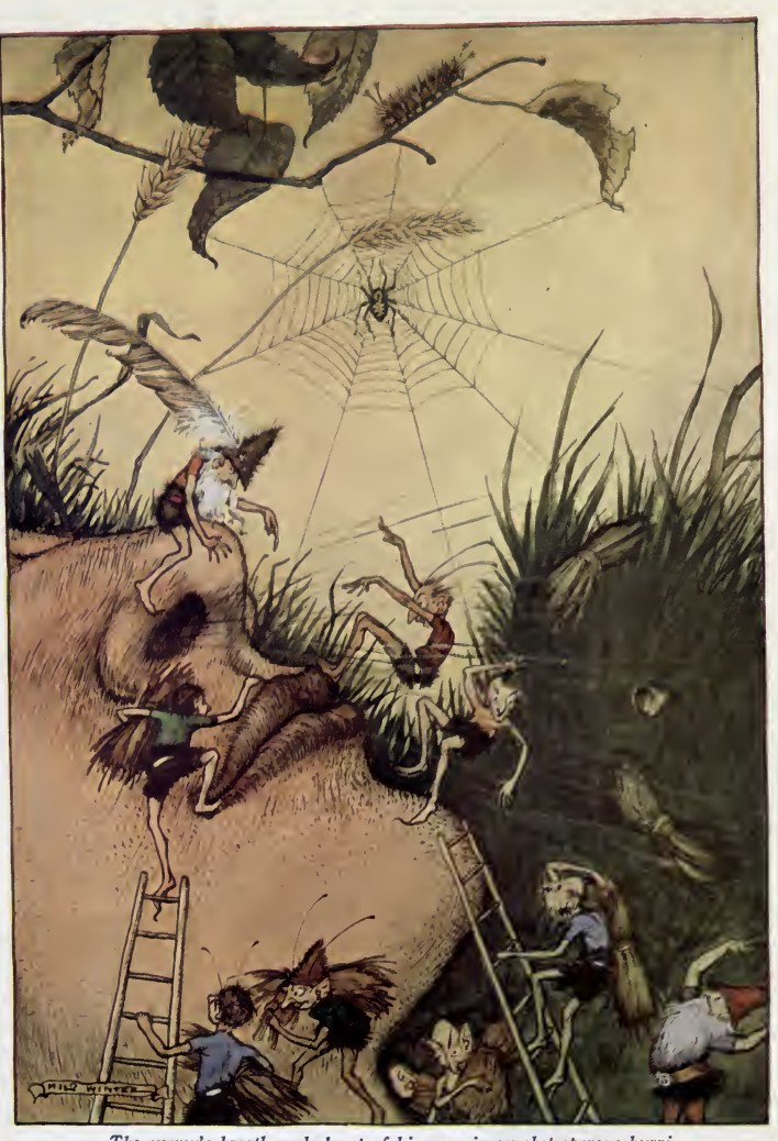
The enemy's breath rushed out of his nose in an obstreperous hurricane and whirlwind