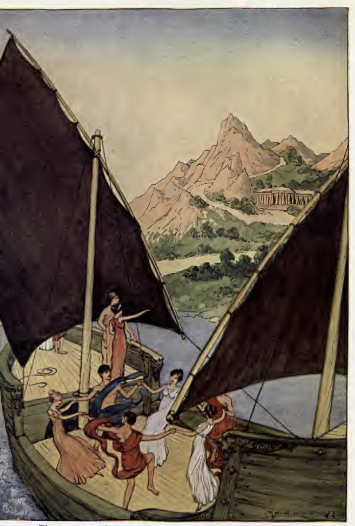
They never once thought whether their sails were black, white, or rainbow colored