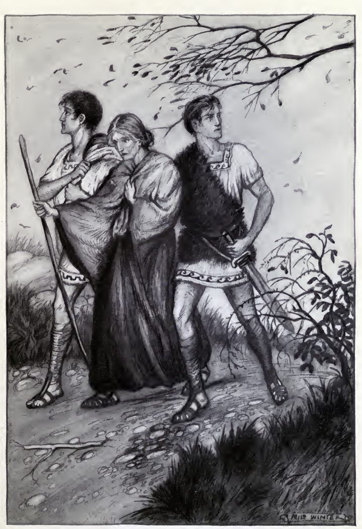
It grieves me to think of them, still keeping up that weary pilgrimage