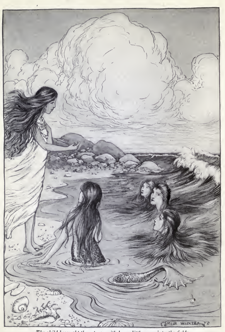
The child besought them to go with her a little way into the fields