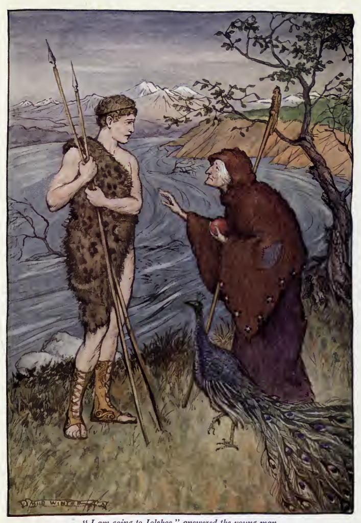
"I am going to Iolchos," answered the young man