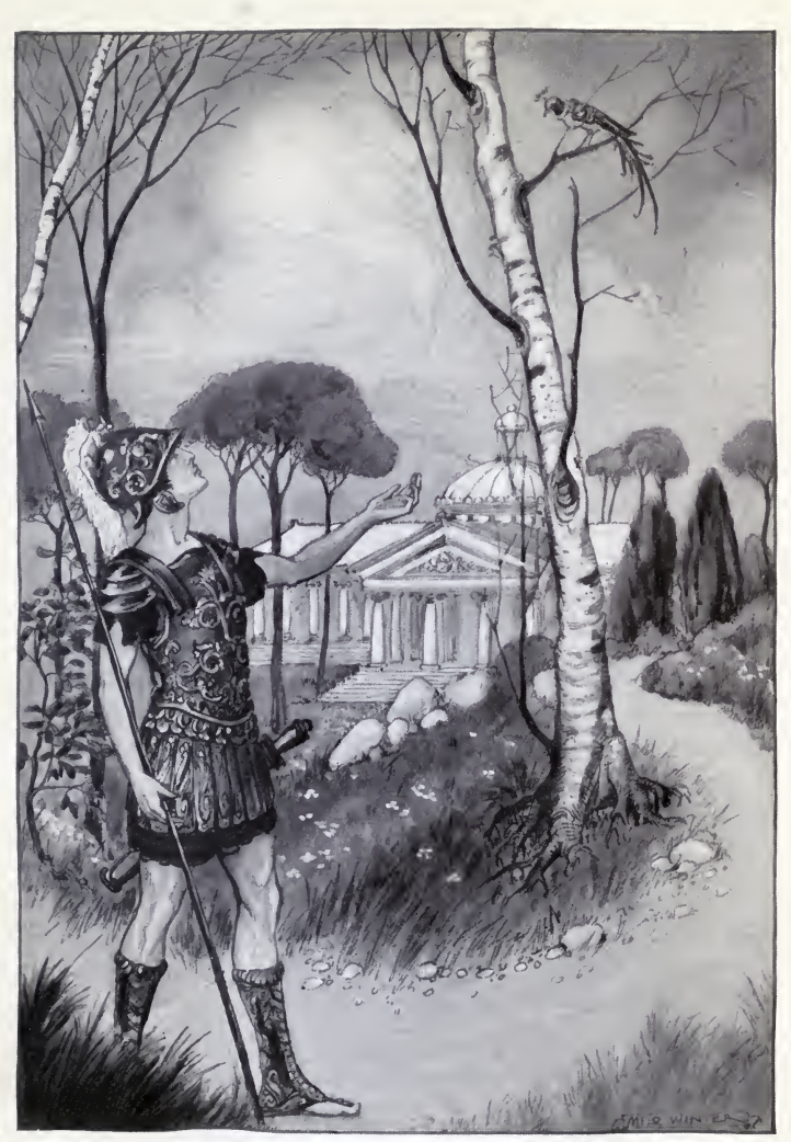
"Have you anything to tell me, little bird?"