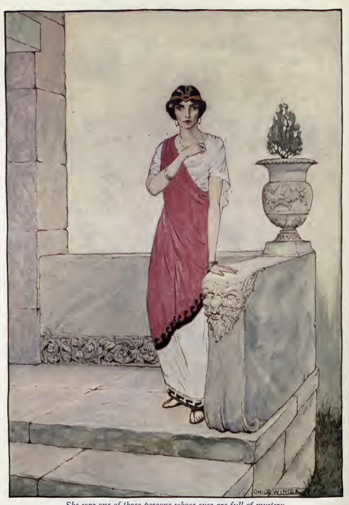
She was one of those persons whose eyes are full of mystery