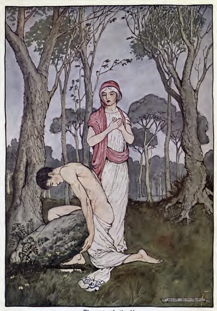
The great rock stirred!