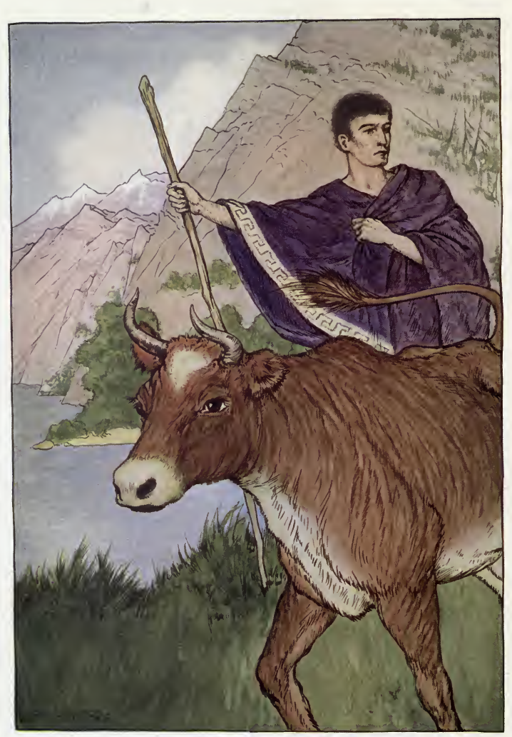
The brindled cow never offered to lie down