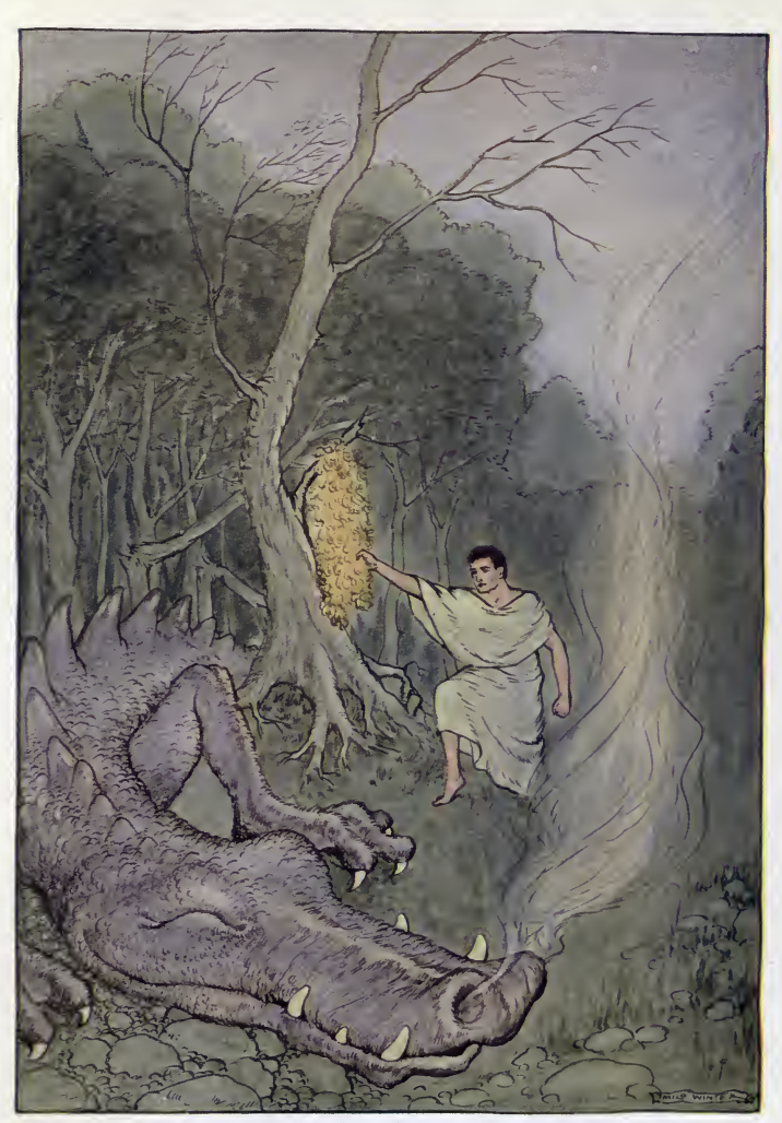
Jason caught the fleece from the tree