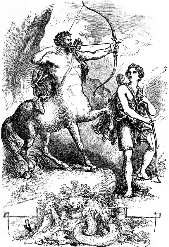
CHIRON AND JASON.