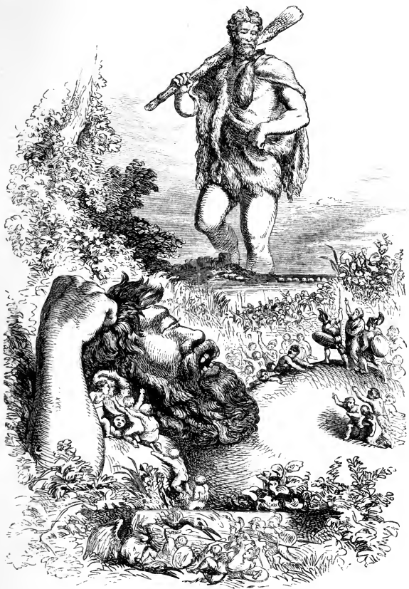
HERCULES AND THE PYGMIES.