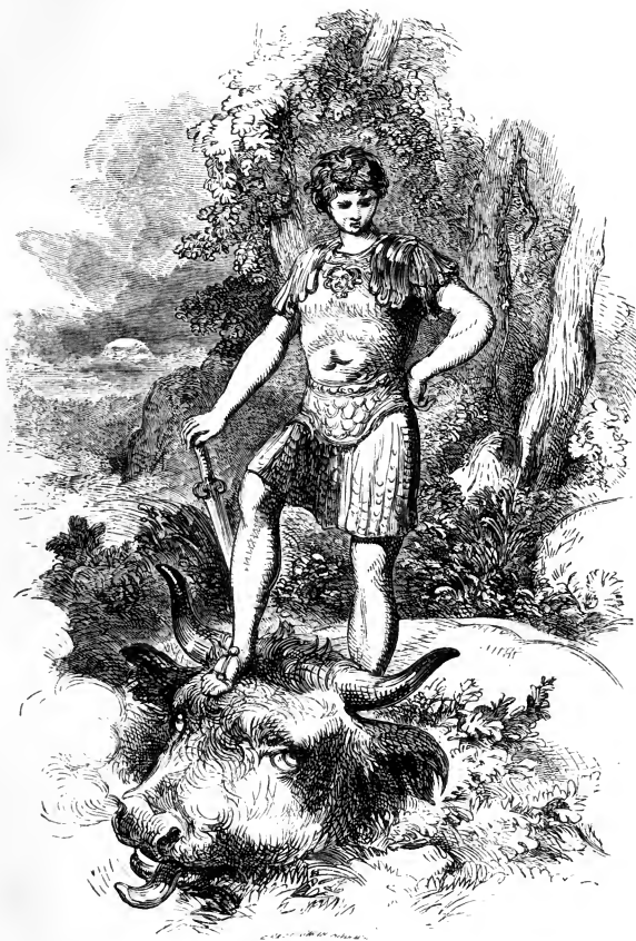
THESEUS AND THE MINOTAUR.