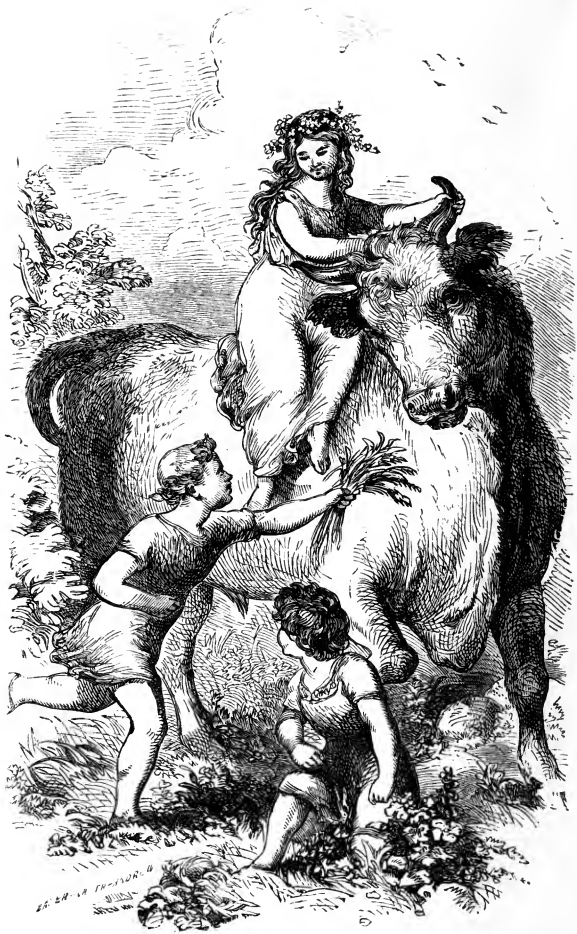
EUROPA AND THE BULL.