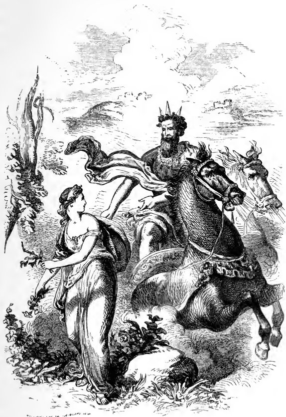
PLUTO AND PROSERPINE.