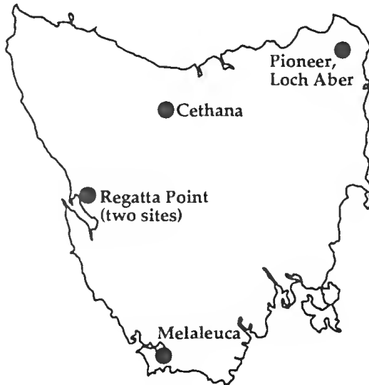
Fig. 1. Map of Tasmania showing the sites which have yielded Banksia -like fossils. There are two sites at Regatta Point that are mentioned in the text. Sites at Pioneer and Loch Aber, which are close together, are approximately 20-25 and 40-45 million years old respectively.

there is no doubt that they are of the Banksia -type, and can be placed in the genus Banksiaeformis , which is reserved for leaves of the Banksiaephyllum -type that have no organic preservation.