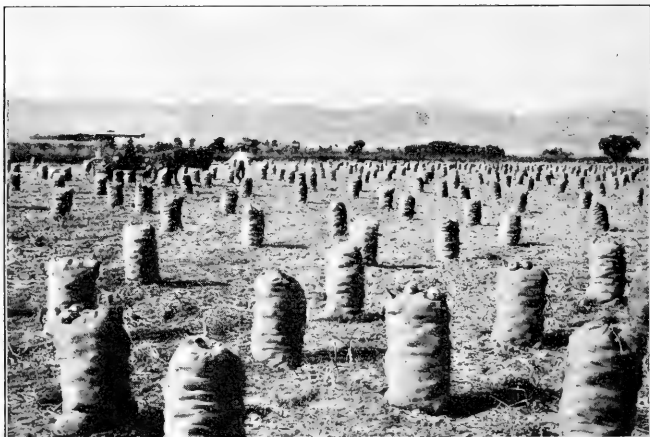
THE RESULTS WHEN EDUCATION IS APPLIED TO FARMING

Crop Rotation. The preceding lessons on field crops will suggest a general plan for studying all crops of special interest to the school. It is very important to call attention to rotation of crops, and a brief outline is here given to be used after work on the special crops is completed.