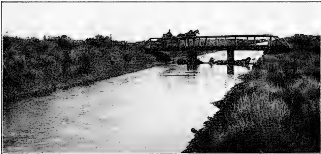
AN IRRIGATION DITCH

Leaf Rosettes. Shepherd's purse, mullein, dandelion, and some primroses possess a circle of leaves which lie flat on the surface of the ground and are thus able to avoid to some extent the severe cold, especially when they are covered with