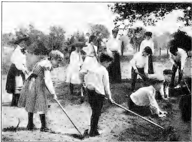
MAKING A SCHOOL GARDEN

Planning the School Grounds. In considering the planting of the school grounds a plan is essential. Without some plan, however simple, one cannot come to a finished, beautiful,