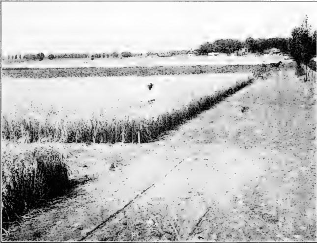
EXPERIMENTAL PLOTS AT THE COLORADO EXPERIMENTAL STATION

Before the opening of the wheat region in the Northwest, Rochester, New York, was the flour city of the Union; to-day