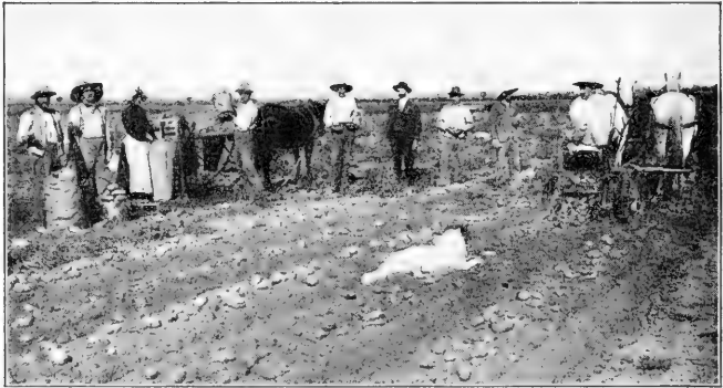
HARVESTING THE POTATO CROP

Make as complete a collection as possible of seeds of field crops from crop-growing regions of the United States.