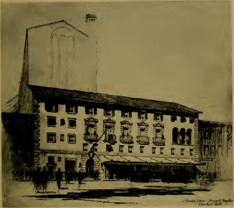
C. Howard Crane, Architect