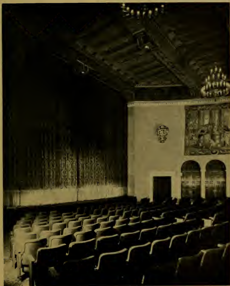
C. Howard Crane, Architect