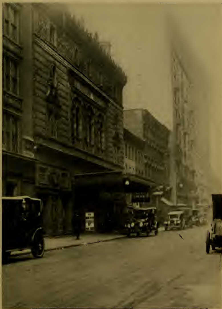
THE GARRICK THEATRE