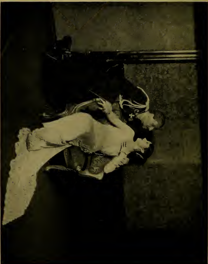
THE GUARDSMAN—ALFRED LUNT AND LYNN FONTANNE