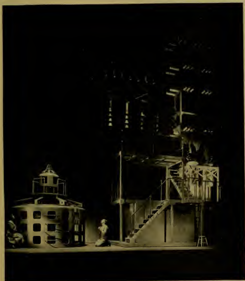
Lee Simonson, Designer