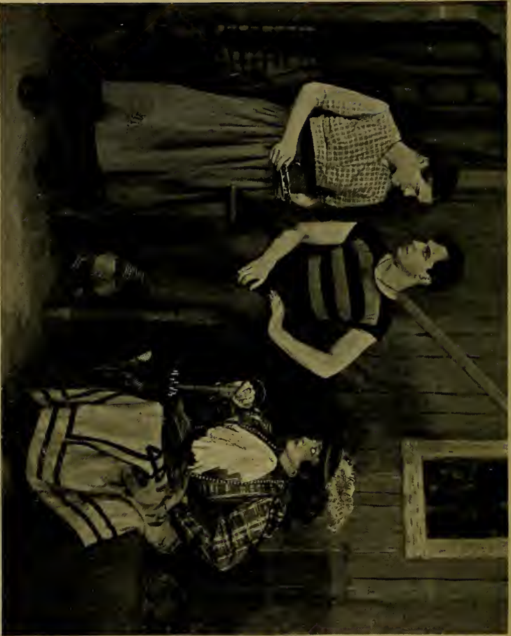
LILKOM—HELEN WESTLEY, JOSEPH SCHILDKRAUT AND EVA LE GALLIENNE