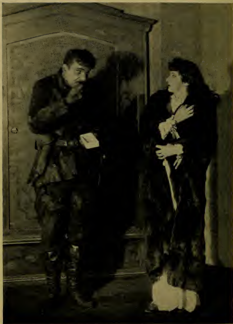
ARMS AND THE MAN ALFRED LUNT AND LYNN FONTANNE