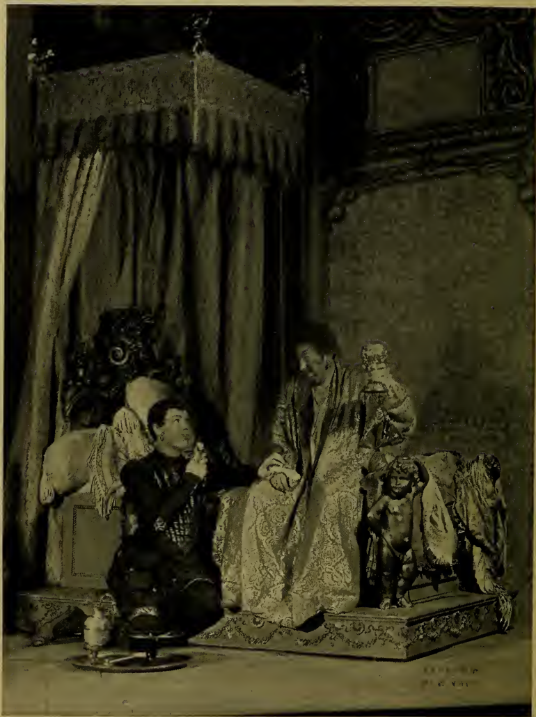
VOLPONE DUDLEY DIGGES AND ALFRED LUNT