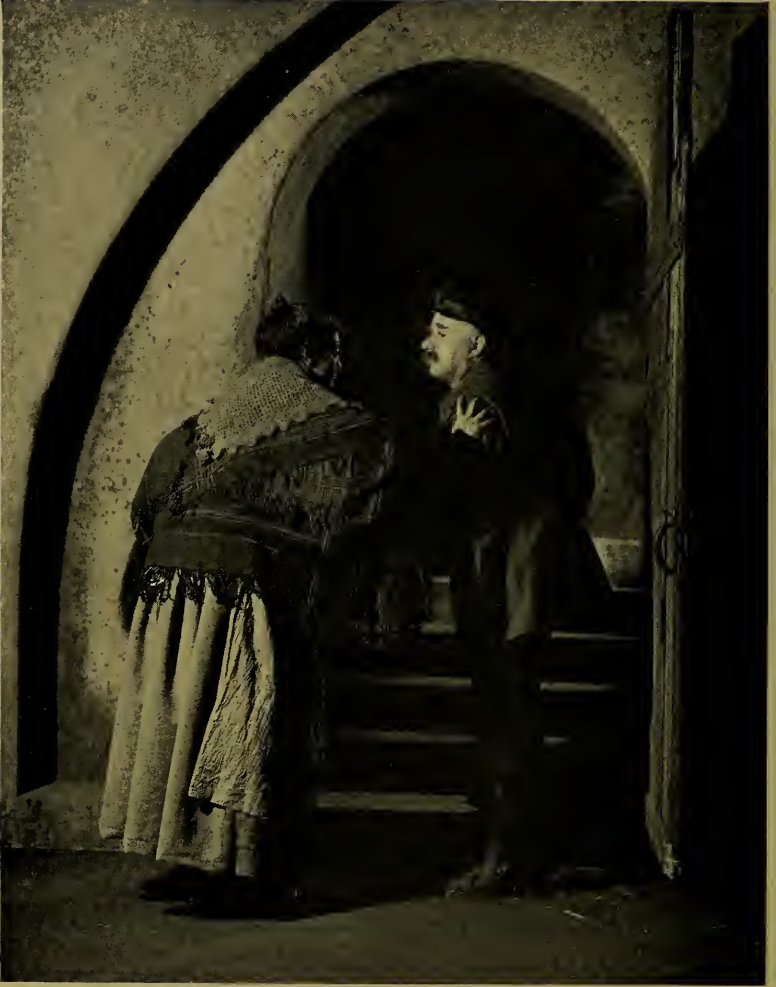
THE CAMEL THROUGH THE NEEDLE'S EYE HELEN WESTLEY AND HENRY TRAVERS