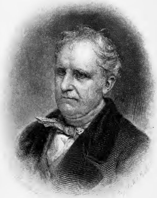
J. Fenimore Cooper