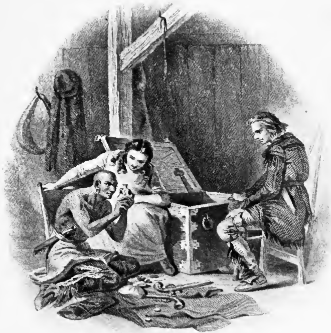
THE OPENING OF THE CHEST