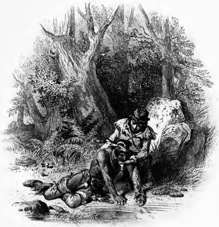
THE DYING INDIAN