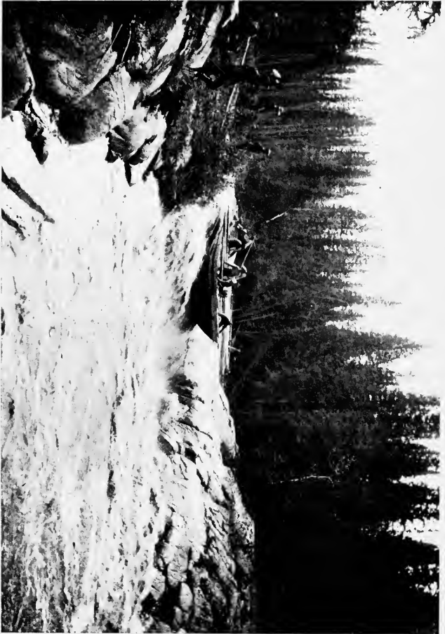
Traders running a mackinaw or keelboat down the rapids of Slave River without unloading.