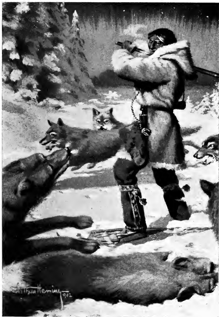
They dodge the coming sweep of the uplifted arm