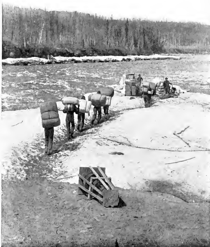
Indian voyageurs "packing" over long portage , each packet containing from fifty to one hundred pounds.